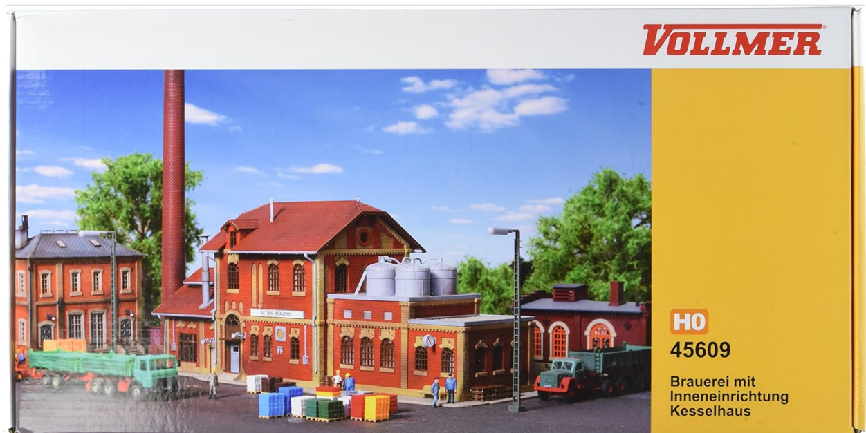
Figure 1.1: Front view of the VOLLMER 45609 Brewery Model Kit packaging. This image displays the completed model on a scenic background, illustrating the detailed structure and its interior features.

This manual provides detailed instructions for the assembly, care, and maintenance of your VOLLMER 45609 HO Scale Brewery Model Kit. This kit is designed for experienced model builders and collectors aged 14 years and older. It is not a toy and contains small parts that may pose a choking hazard for younger children. The VOLLMER 45609 Brewery with Interior is a highly detailed HO scale (1:87) model structure, perfect for enhancing your model railway layout or diorama. Careful assembly is required to achieve the intended realistic appearance.