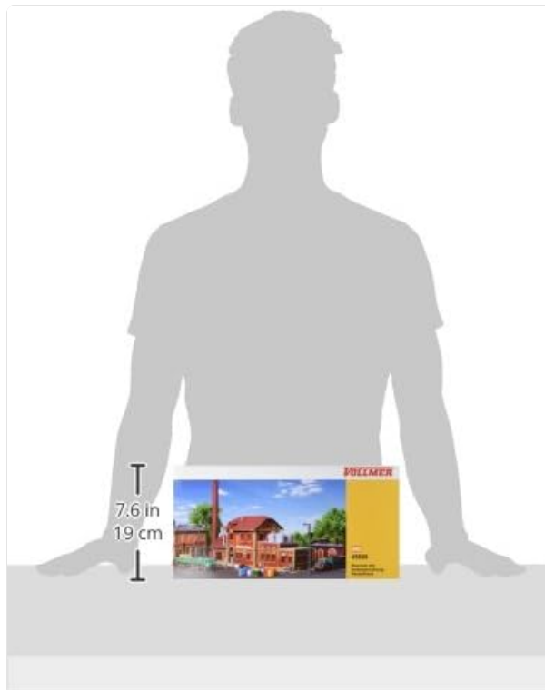
Figure 7.1: Image illustrating the approximate size of the VOLLMER 45609 model kit packaging in comparison to a human figure, indicating a package height of approximately 7.6 inches (19 cm).