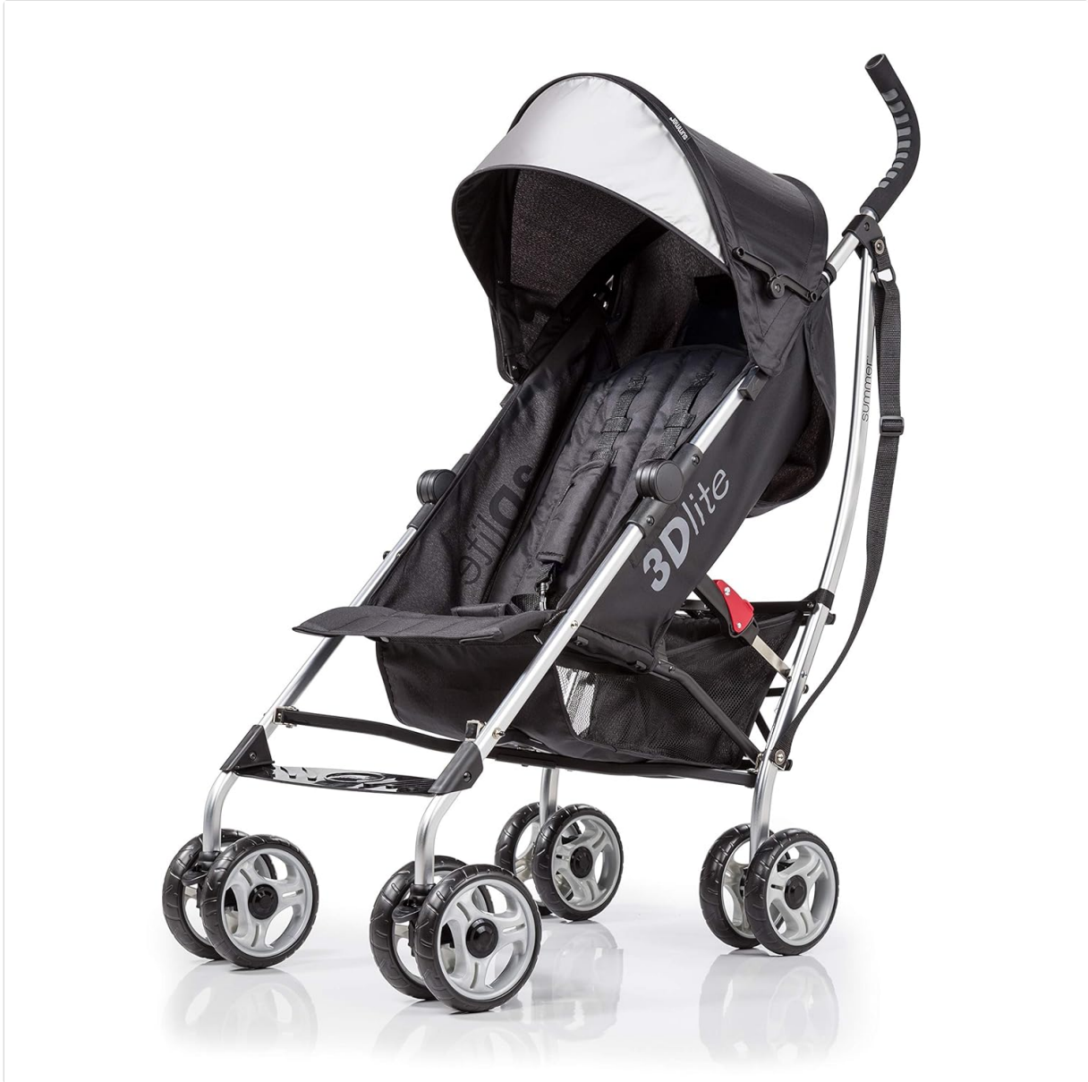
Figure 1: The 3Dlite Stroller in its fully unfolded position.

To unfold the stroller, release the auto-lock mechanism and extend the frame until it clicks securely into place. Ensure all locking mechanisms are engaged before use.