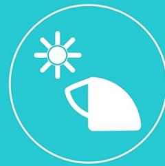
Figure 4: Canopy with pop-out sun visor for sun protection.