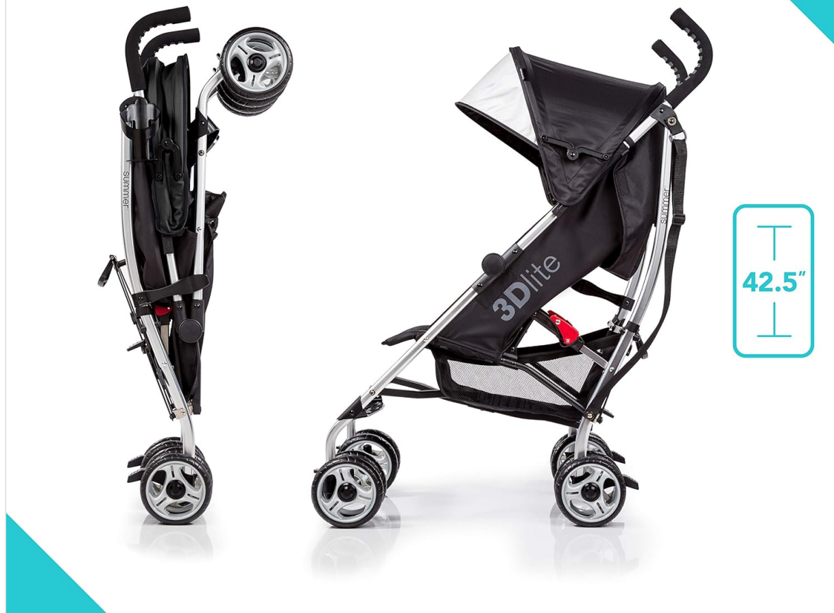
Figure 2: Comparison of the stroller in its compact folded and unfolded states.