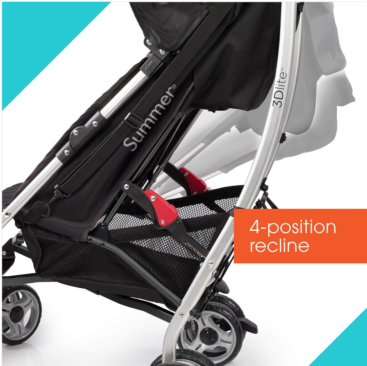
Figure 3: The 4-position recline feature for optimal comfort.