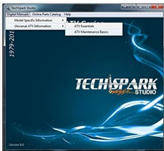
Figure 2.1: The main interface of the TechSpark Studio software, showing navigation menus.

The software provides full access to all information directly from your computer, ensuring availability even without an internet connection.