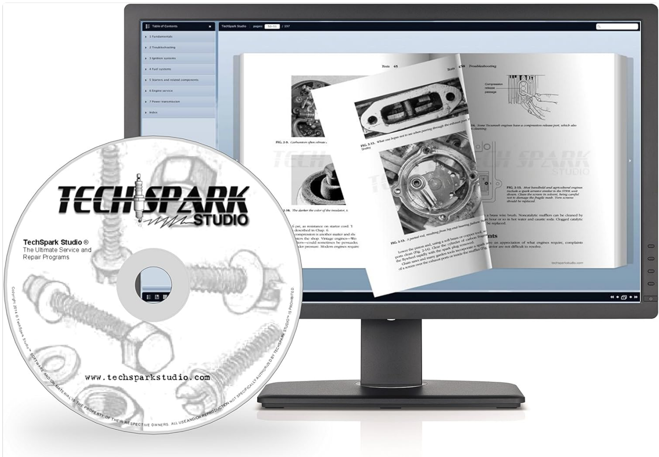
Figure 1.1: The TechSpark Studio CD-ROM alongside a monitor displaying the digital service manual interface.

This manual provides comprehensive service, repair, and maintenance information for Yamaha Grizzly 600 (1998-2001) and Grizzly 660 (2002-2008) models. It is delivered as a software program on a CD-ROM, designed to offer an interactive digital experience similar to a traditional paper manual, but with enhanced search and navigation capabilities.