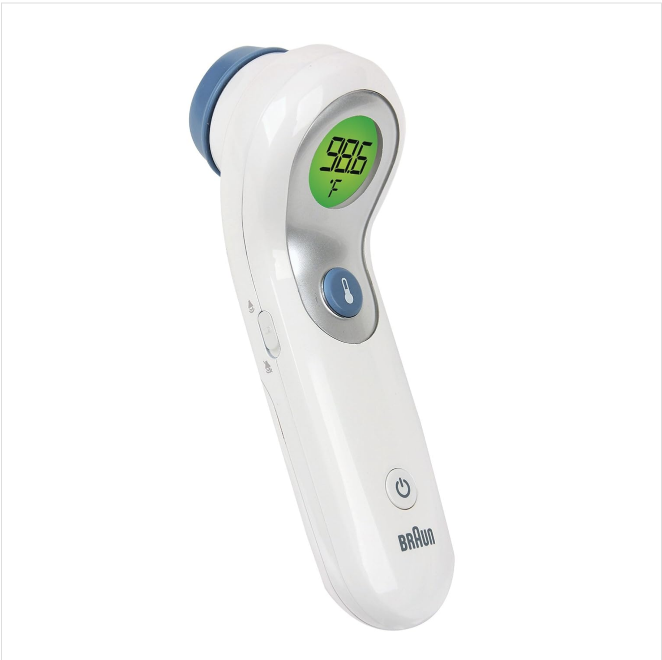
Image: Front view of the Braun No Touch and Forehead Thermometer, displaying a temperature reading.