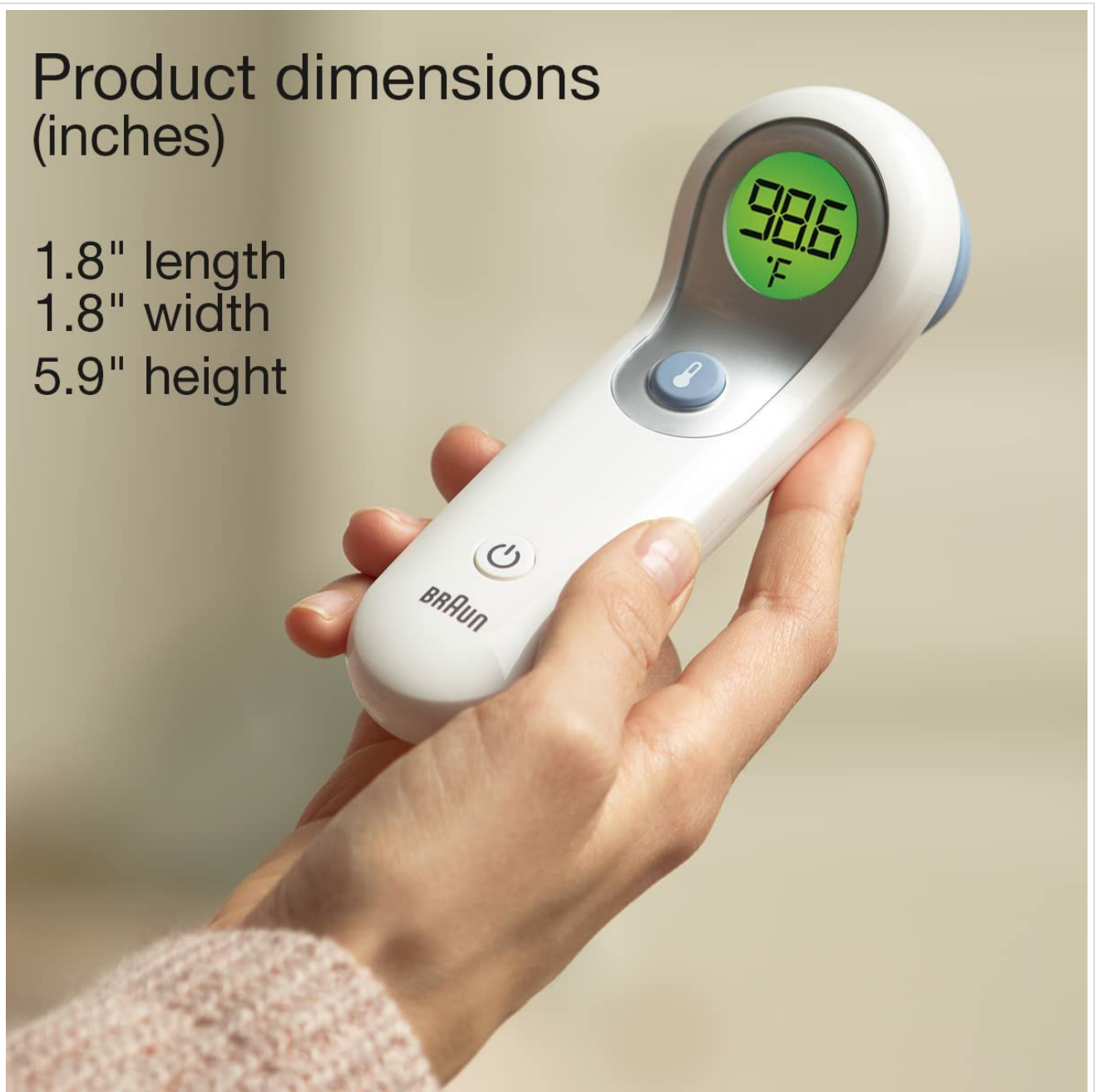
Image: The Braun thermometer with its key dimensions (length, width, height) indicated.