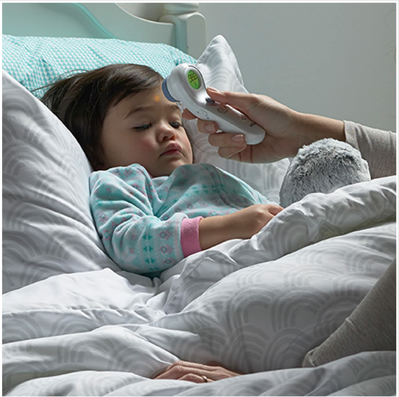
Image: A mother taking her child's temperature by gently touching the thermometer to the child's forehead.