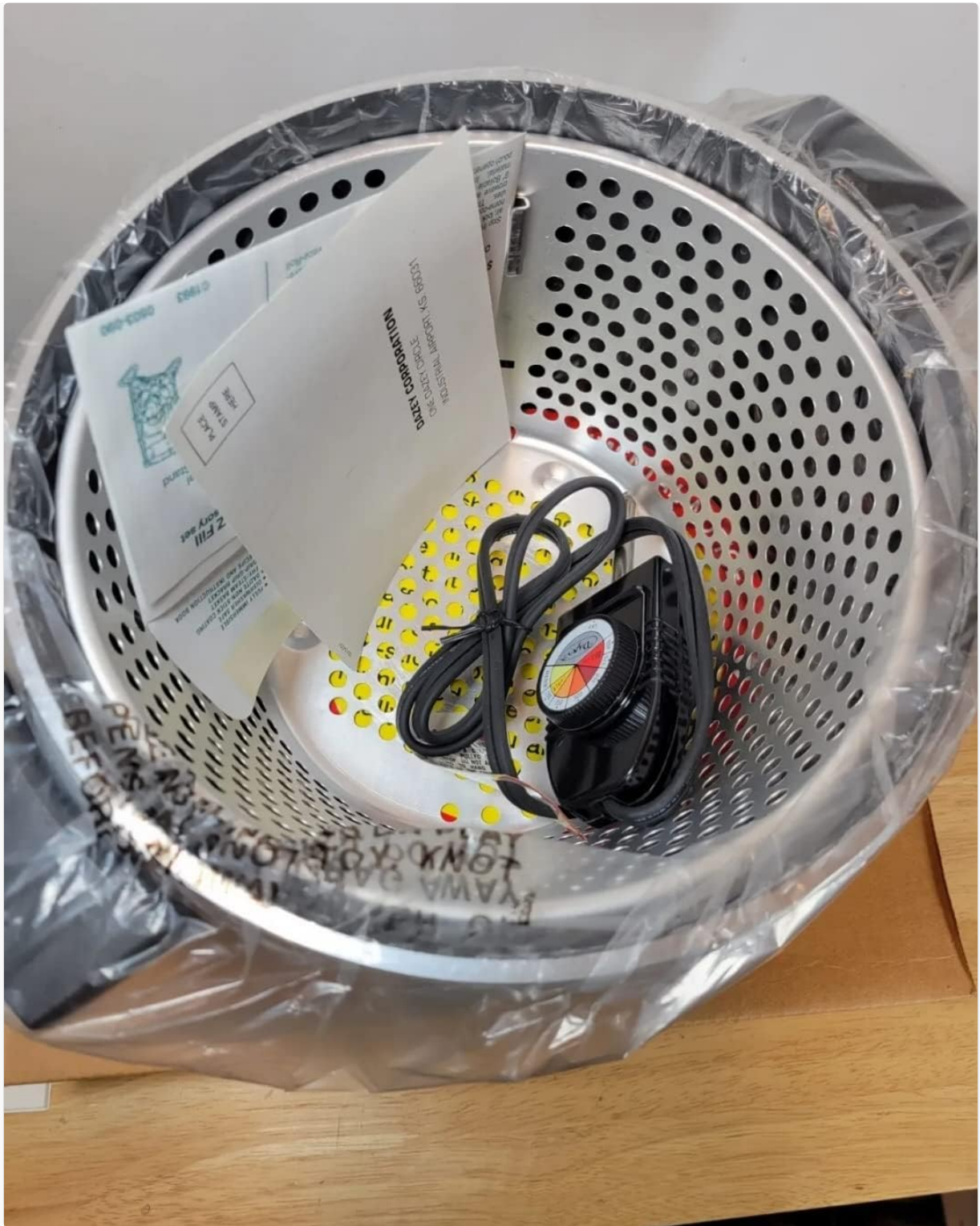
Image: Various components of the Dazey Chef's Pot DCP-6, including the temperature control probe, the instruction manual, and the Drip-Grip fry/steam basket, neatly arranged within the main cooking pot. This illustrates the key parts included with the appliance.