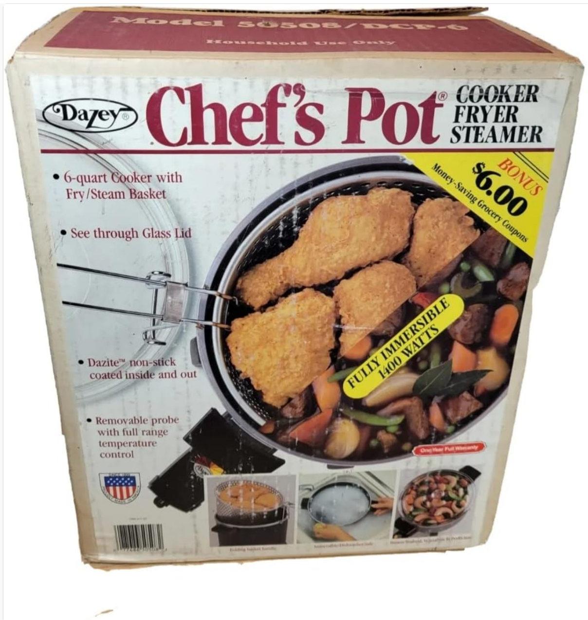
Image: Front of the Dazey Chef's Pot DCP-6 product box, illustrating its use as a fryer and a stew pot. The box highlights features like the 6-quart capacity, glass lid, non-stick coating, and removable temperature probe.