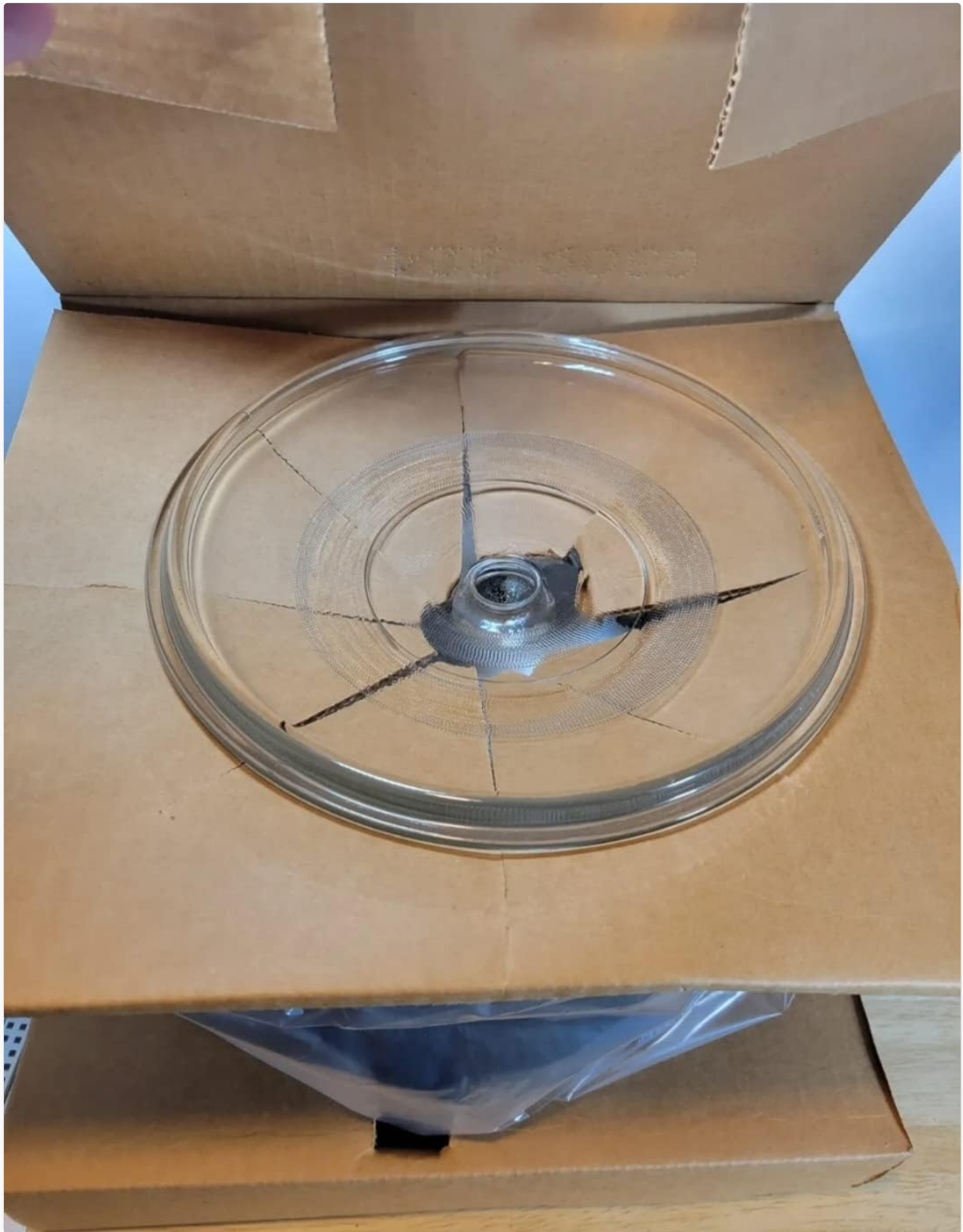
Image: The clear glass lid for the Dazey Chef's Pot DCP-6, displayed within its protective packaging. The lid allows for easy monitoring of food during cooking.