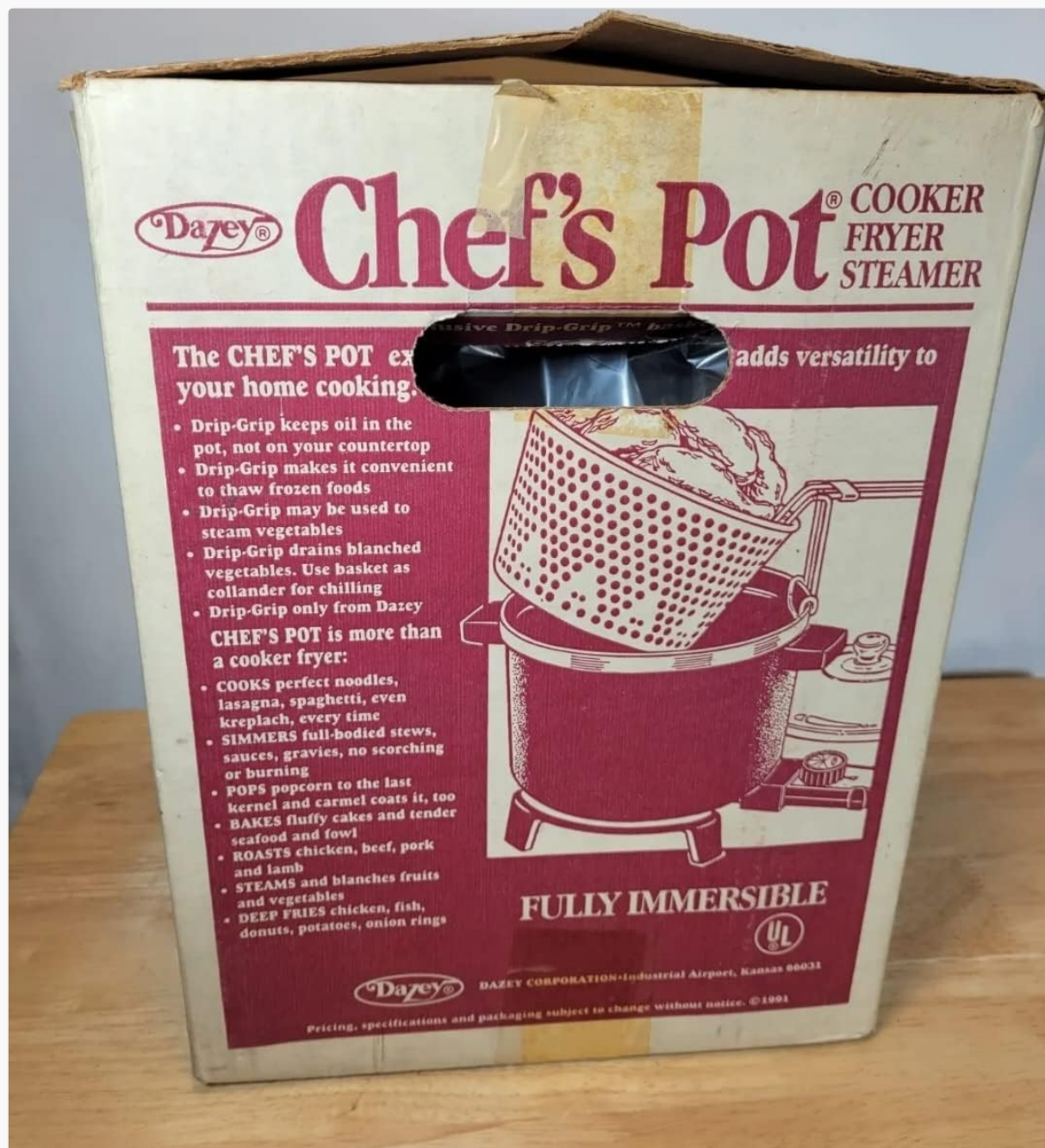
Image: Side panel of the Dazey Chef's Pot DCP-6 product box, highlighting the versatility of the Drip-Grip basket for thawing, steaming vegetables, blanching, and draining. It also lists various cooking functions such as cooking pasta, stews, popcorn, roasting, and deep frying.