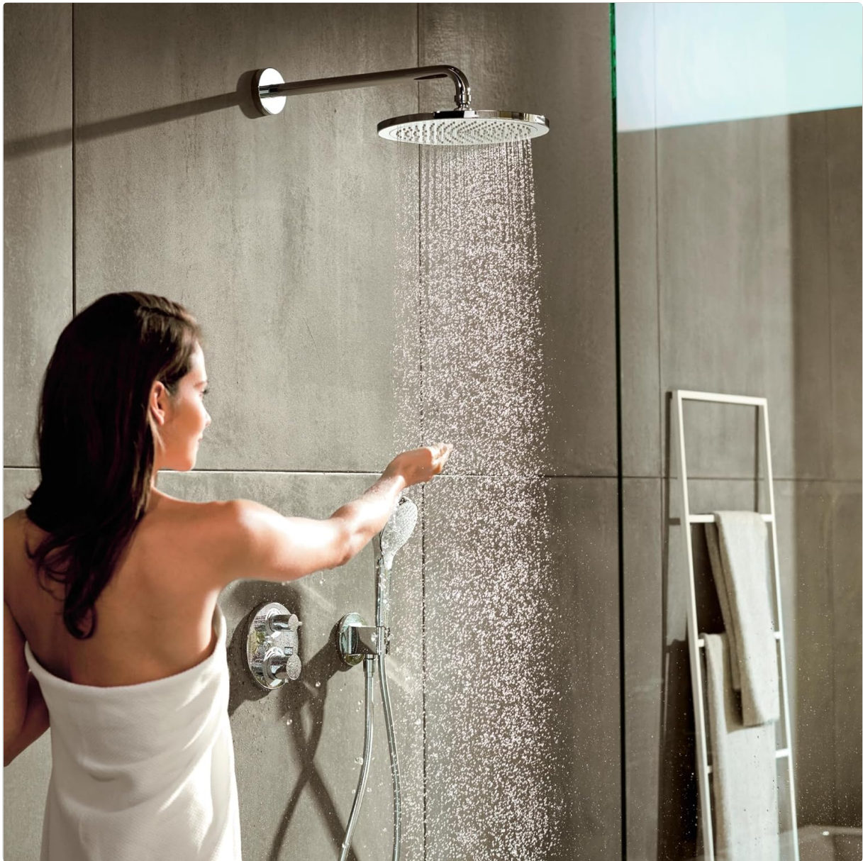
Figure 1: hansgrohe Ecostat S Thermostatic Mixer in use, providing a comfortable shower experience.