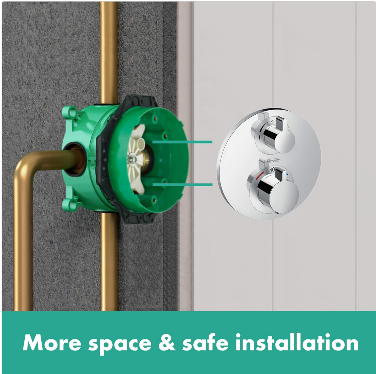
Figure 3: Illustration of the concealed installation process, highlighting the iBox universal base set.

For detailed installation instructions, refer to the separate manual provided with the iBox universal base set