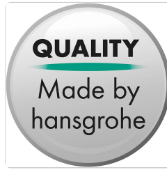
Figure 5: hansgrohe quality assurance emblem.

For technical assistance, spare parts, or warranty inquiries, please contact hansgrohe customer service. Visit the official hansgrohe website for contact details specific to your region.