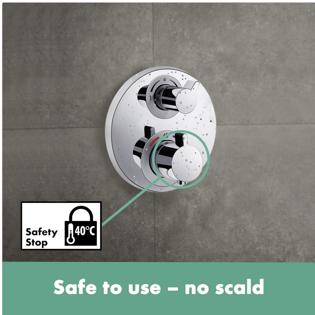
Figure 2: The 40°C safety stop mechanism on the thermostatic mixer, designed to prevent scalding.