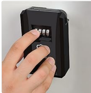
Image 3.3: Detailed view of a hand manipulating the combination dials during the setting process.