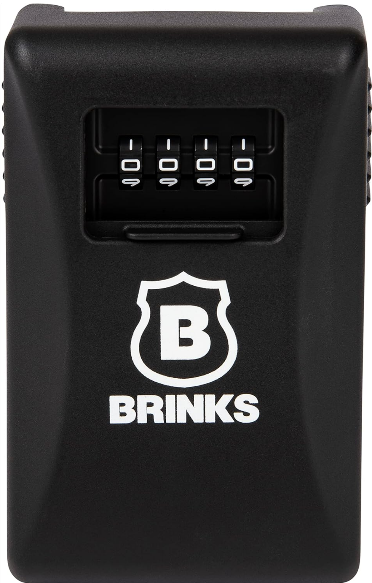
Image 1.1: Front view of the BRINKS 80mm 4-Dial Resettable Combination Lock Box, showing the combination dials and the BRINKS logo.