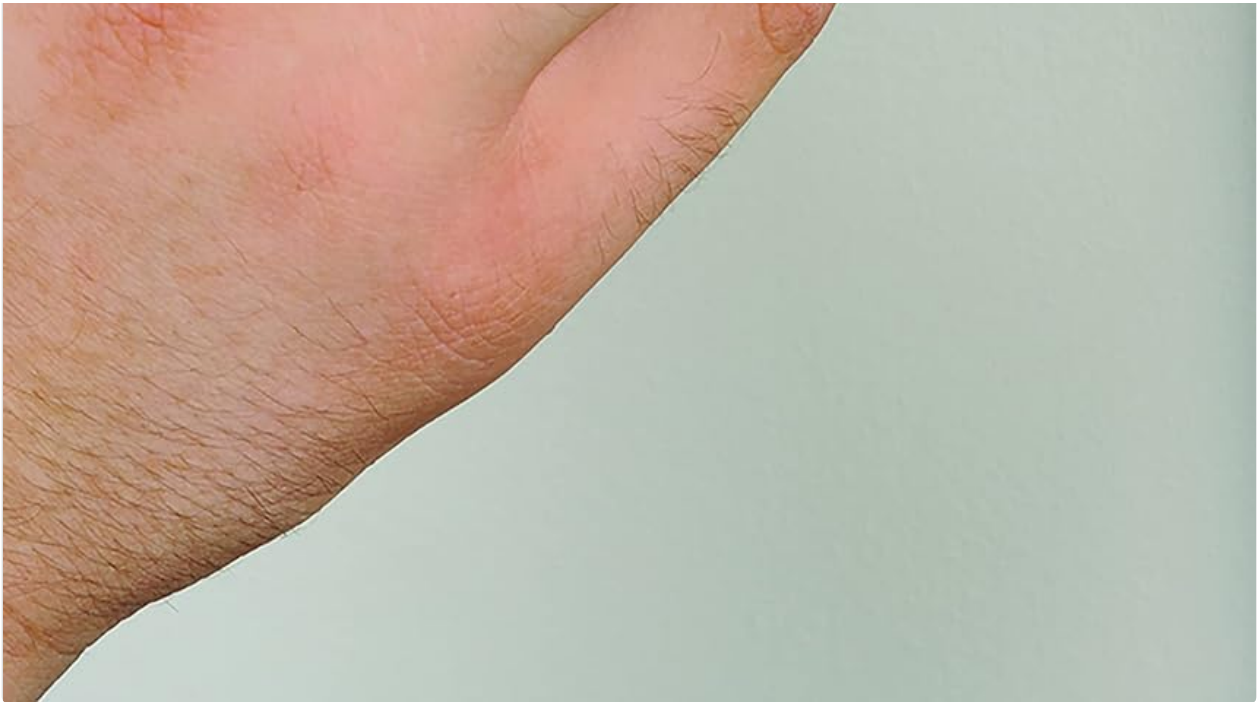
Image 3.2: A hand adjusting the combination dials on the lock box.