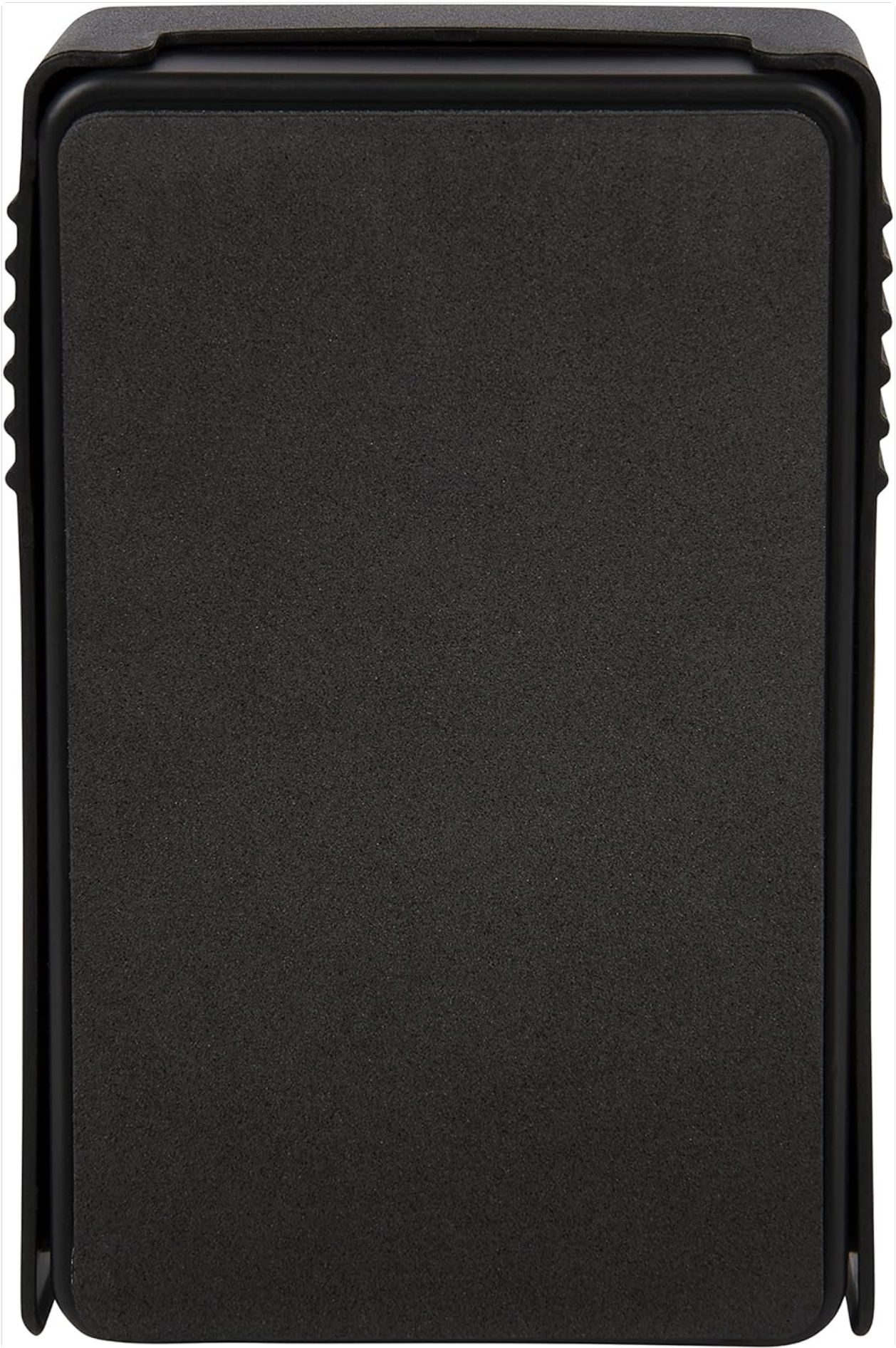
Image 3.1: Rear view of the lock box, illustrating the design for wall mounting.