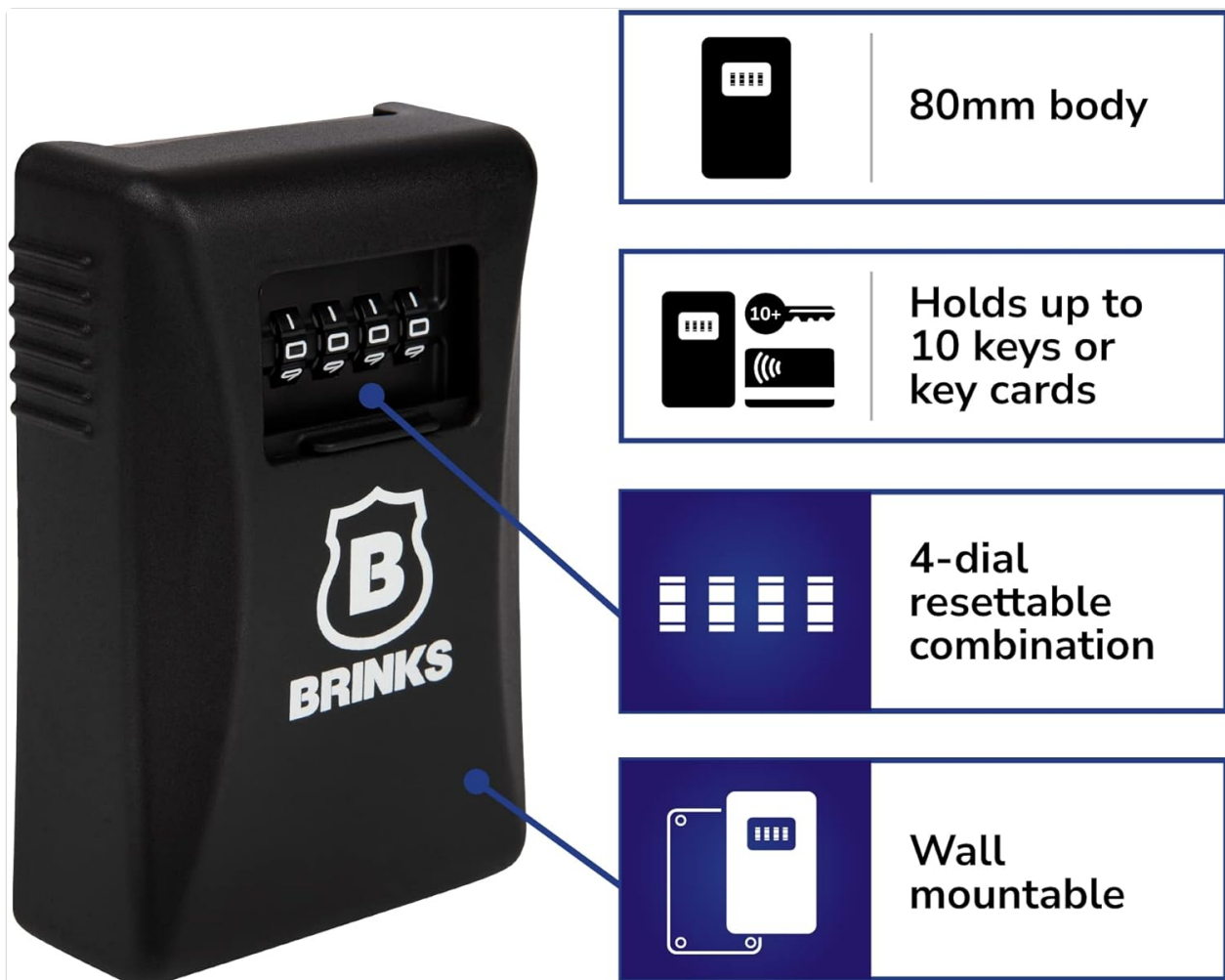
Image 2.1: Diagram highlighting key features: 80mm body, capacity for 10+ keys/cards, 4-dial resettable combination, and wall mountable design.