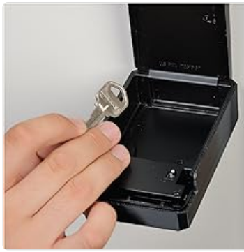
Image 4.2: A hand demonstrating the action of inserting a key into the open lock box.