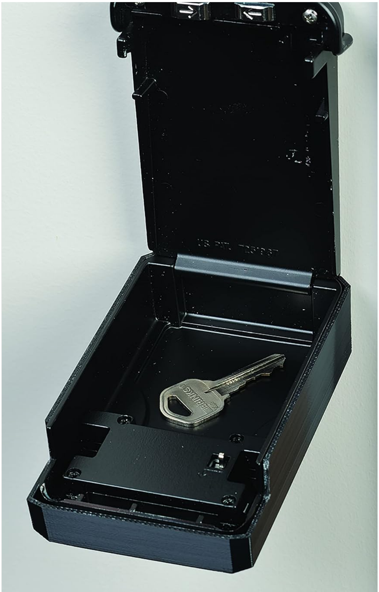
Image 4.1: The lock box in an open position, showing a key placed inside the compartment.