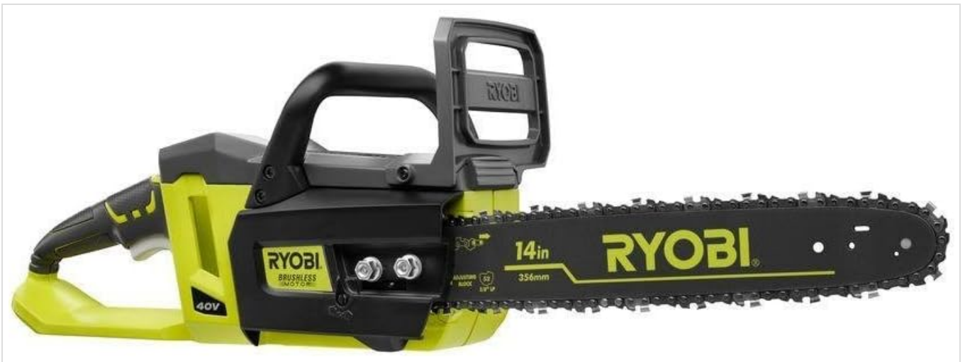
Figure 2: Side view of the chainsaw, showing the battery compartment. The battery slides into the designated slot at the rear of the unit.