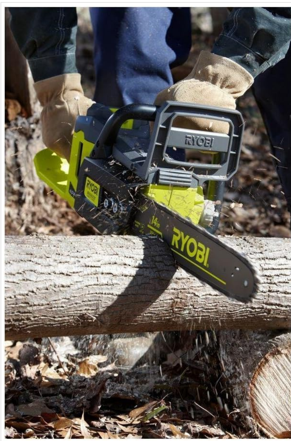
Figure 3: The RYOBI chainsaw effectively cutting through a log. This demonstrates the tool's capability for various cutting tasks.

Always maintain a firm grip with both hands. Position yourself securely and ensure the chain does not contact the ground or other obstacles. Use the wrap-around handle for comfortable cutting and user control in various positions.