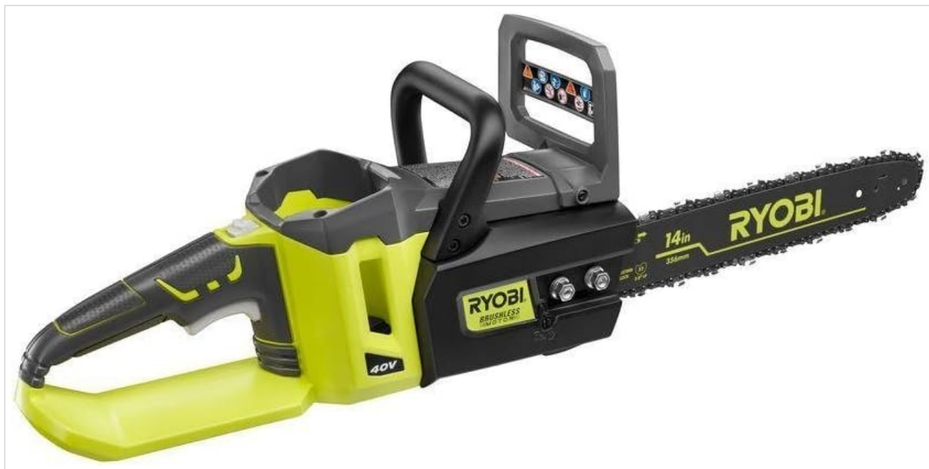
Figure 1: RYOBI 14-Inch 40-Volt Brushless Chainsaw. This image displays the complete chainsaw unit, highlighting its ergonomic design and 14-inch bar.

Thank you for choosing the RYOBI 14-Inch 40-Volt Brushless Chainsaw. This manual provides essential information for the safe assembly, operation, and maintenance of your new tool. Please read it thoroughly before use and keep it for future reference.