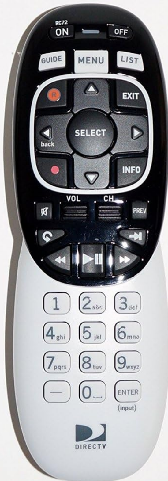
Image: Front view of the DIRECTV RC72 Remote Control. The remote is black and white, with a black top section containing navigation and function buttons, and a white bottom section with a numeric keypad. The DIRECTV logo is at the bottom.