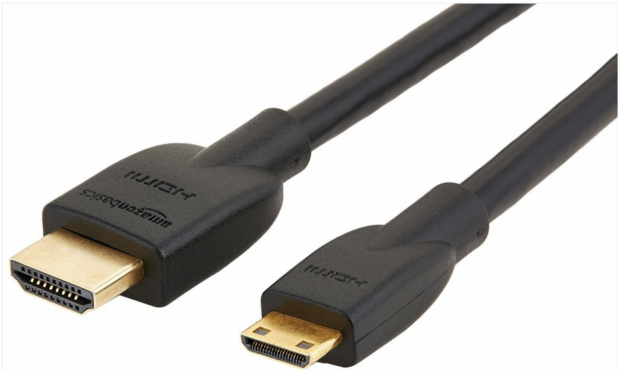
Image 1.1: Overview of the Amazon Basics High-Speed Mini-HDMI to HDMI Cable.

This manual provides essential information for the proper use and care of your Amazon Basics High-Speed Mini-HDMI to HDMI Cable. This cable is designed to connect devices with a Mini-HDMI output to displays or devices with a standard HDMI input, supporting high-quality audio and video transmission, including Ethernet, 3D, and Audio Return functionalities.