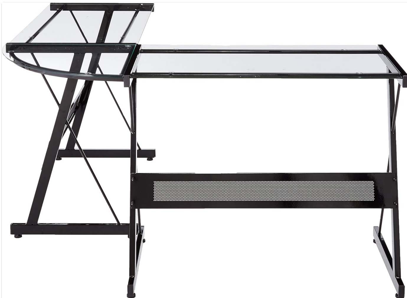
Figure 4: Side profile of the assembled desk frame, illustrating the L-shape and structural integrity before glass installation.