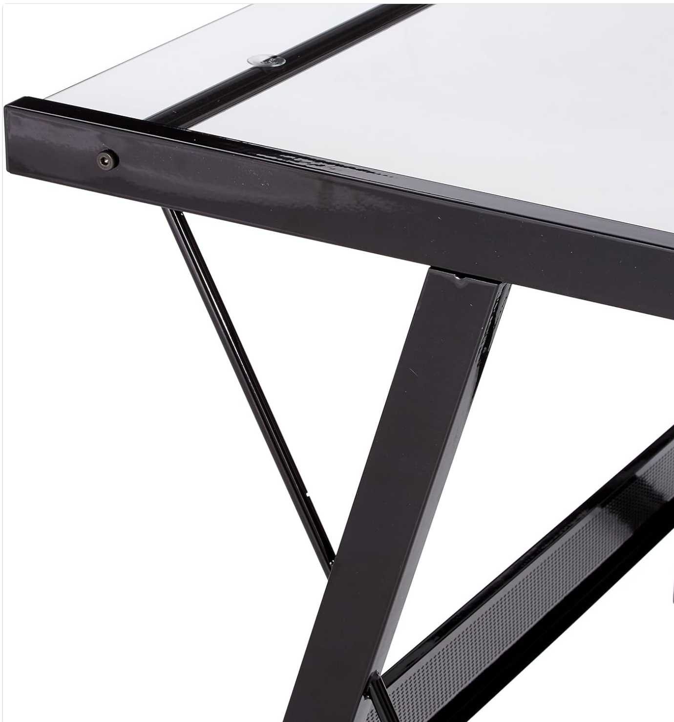
Figure 3: Example of a reinforced joint on the desk frame, illustrating the connection points for assembly.