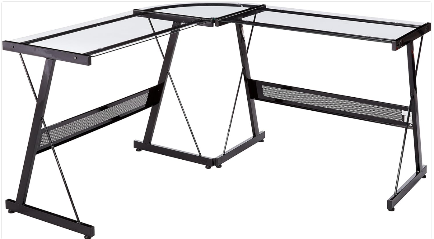
Figure 1: Fully assembled Solano L Desk, showcasing its modern design and spacious L-shaped configuration with clear glass surfaces and black metal frame.

Thank you for choosing the Solano L Desk by Z-Line Designs. This contemporary "L" desk configuration features a sandy black finish and clear tempered safety glass desktops. Designed for strength and durability with reinforced plates on all welding joints, this spacious desk is ideal for any home or office environment. Please read this manual thoroughly before assembly and use to ensure proper setup and longevity of your product.