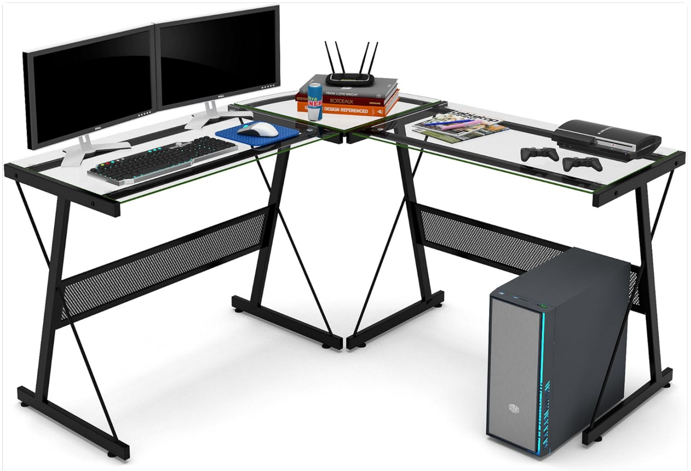
Figure 5: The Solano L Desk in a typical setup, demonstrating its capacity for multiple monitors and office accessories.