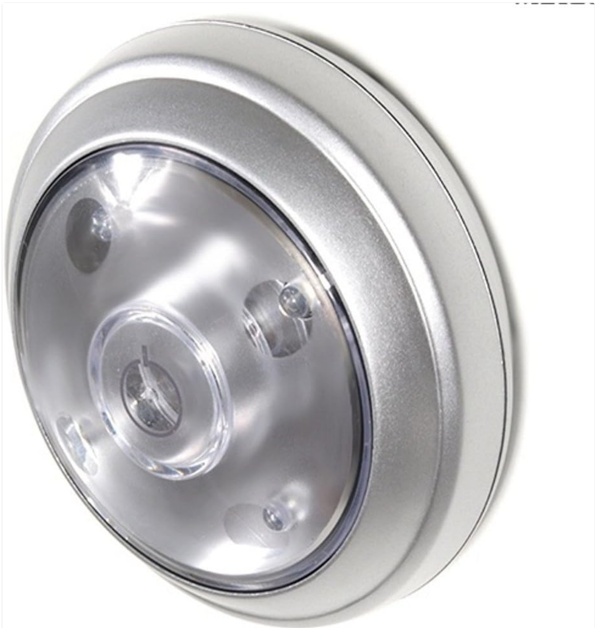
Figure 5: The light head can be rotated to adjust the beam direction.