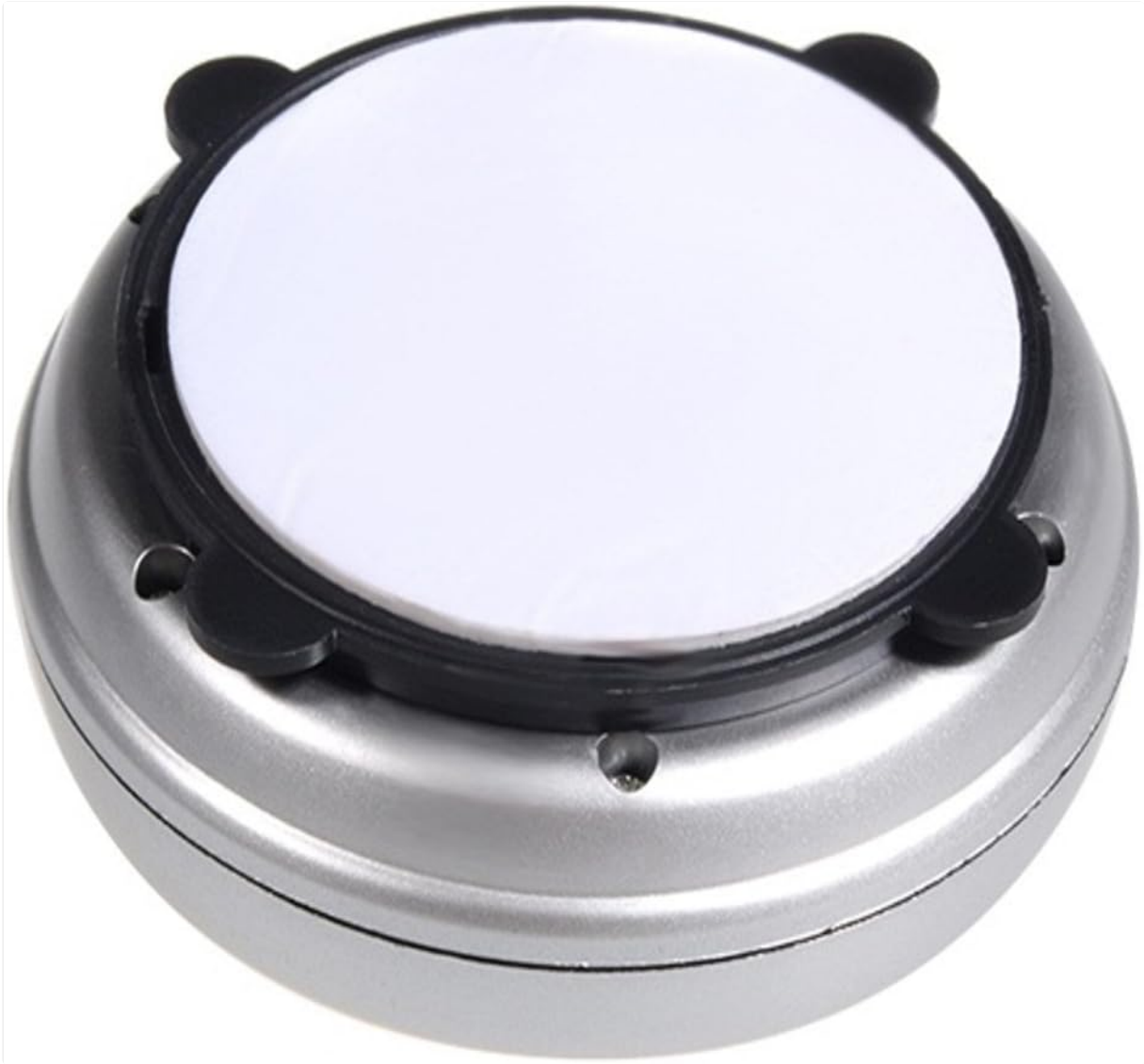
Figure 3: Rear view showing the adhesive pad for mounting.