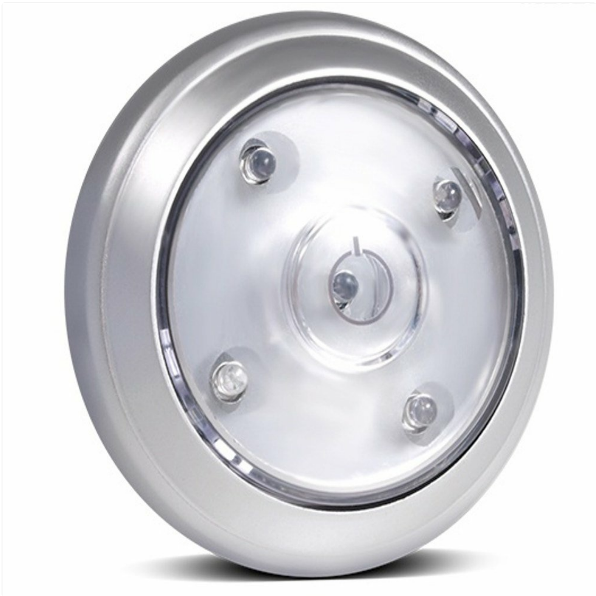
Figure 1: Front view of the Maclean MCE28 LED Cabinet Light.