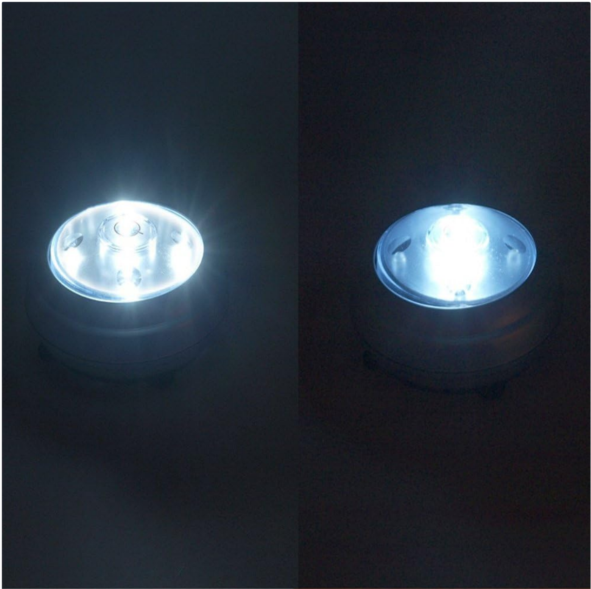
Figure 4: Comparison of the light output in different modes.