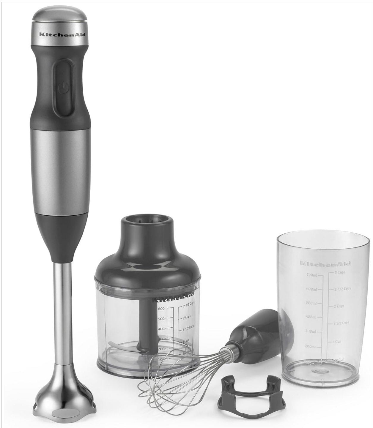
Image: The KitchenAid KHB2352CU 3-Speed Hand Blender showing the motor body, blending arm, whisk attachment, chopper attachment, and blending jar.

Familiarize yourself with the components of your KitchenAid Hand Blender: