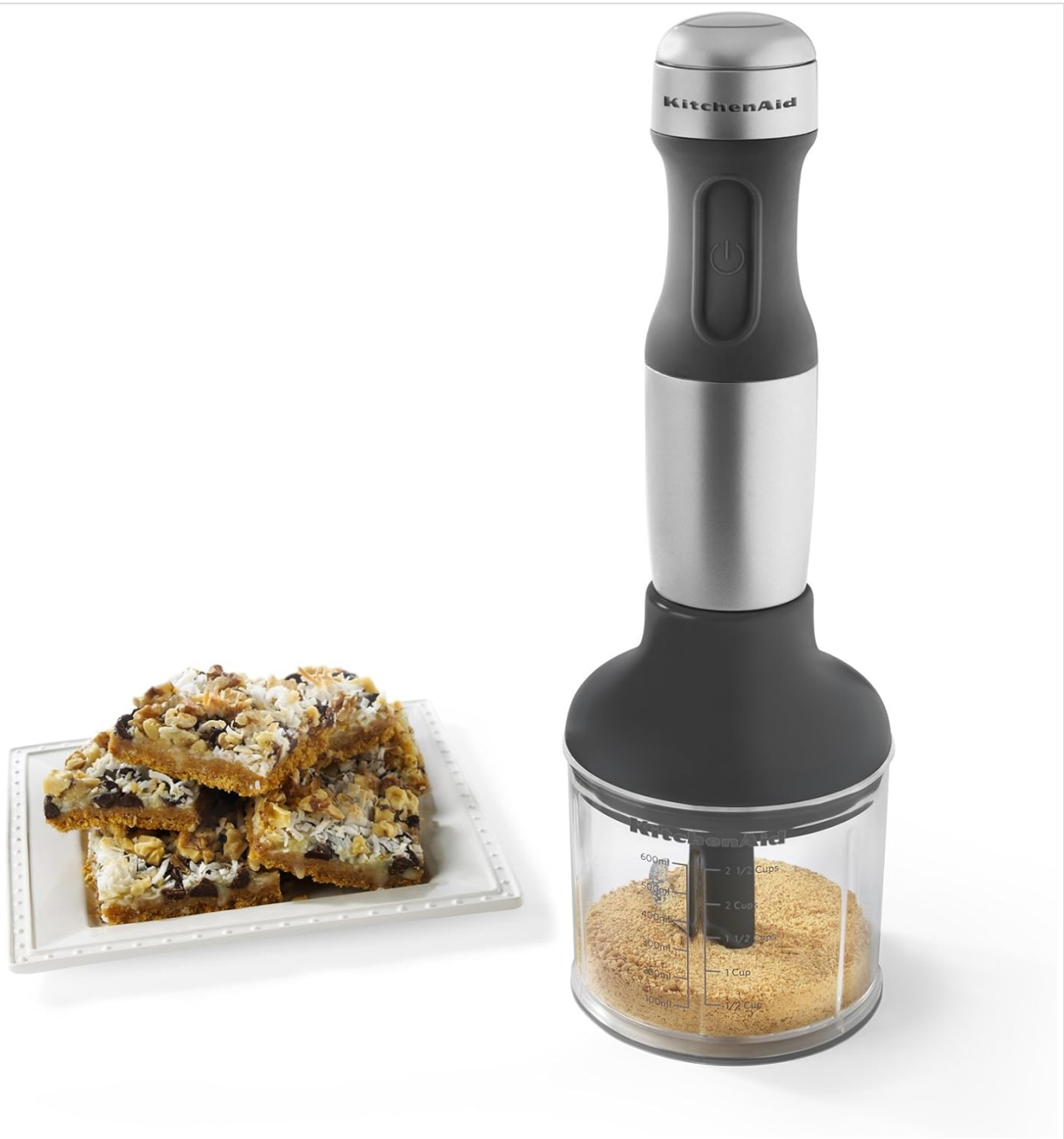
Image: The KitchenAid Hand Blender motor body attached to the chopper attachment, actively processing ingredients inside the chopper bowl.