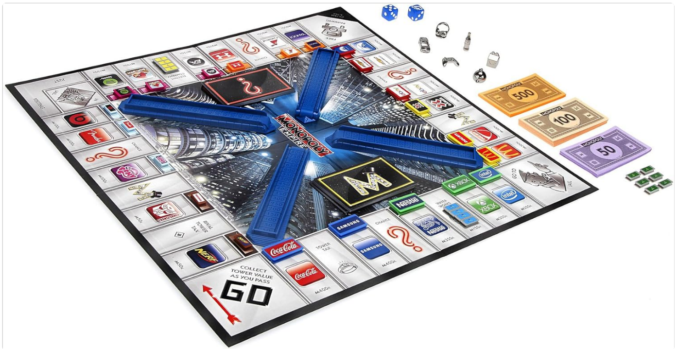
Image 2: The Monopoly Empire game board fully set up with player towers, tokens, dice, and money.

8. Starting Player: Each player rolls both dice. The player with the highest total starts the game. Play proceeds clockwise.