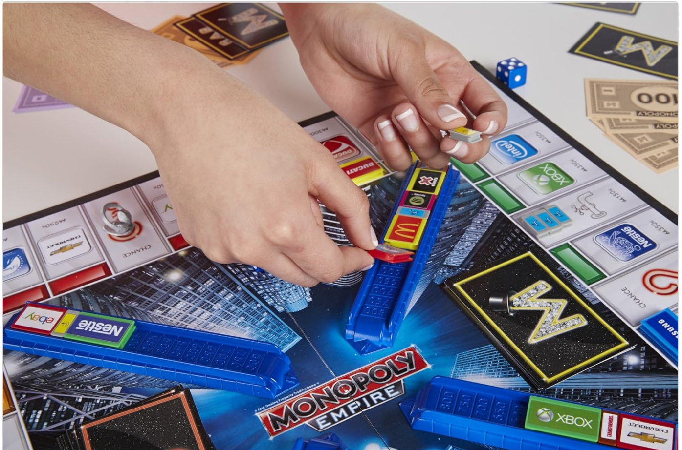
Image 3: A player placing a brand billboard tile into their personal tower.

Once you own all brands of a color set, you can buy an Office Tile. An Office Tile counts as an additional billboard in your tower, helping you reach the top faster. You can only have one Office Tile per color set.