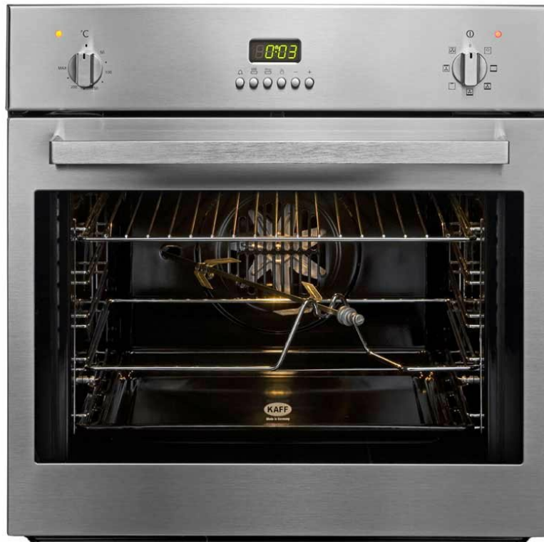
Image 3.1: Front view of the Kaff K OV 60 MGM Oven. This image displays the control panel with knobs, digital display, oven door, and interior racks, along with the rotisserie spit visible inside.