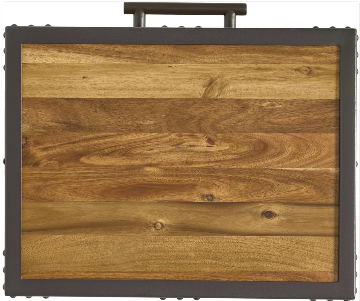
Image: A close-up view of the table's leg and the industrial metal frame, showing the attachment point and rivet details, illustrating the assembly area.

Tools Recommended: A hammer may be useful for minor adjustments if needed, though not typically required for primary assembly.