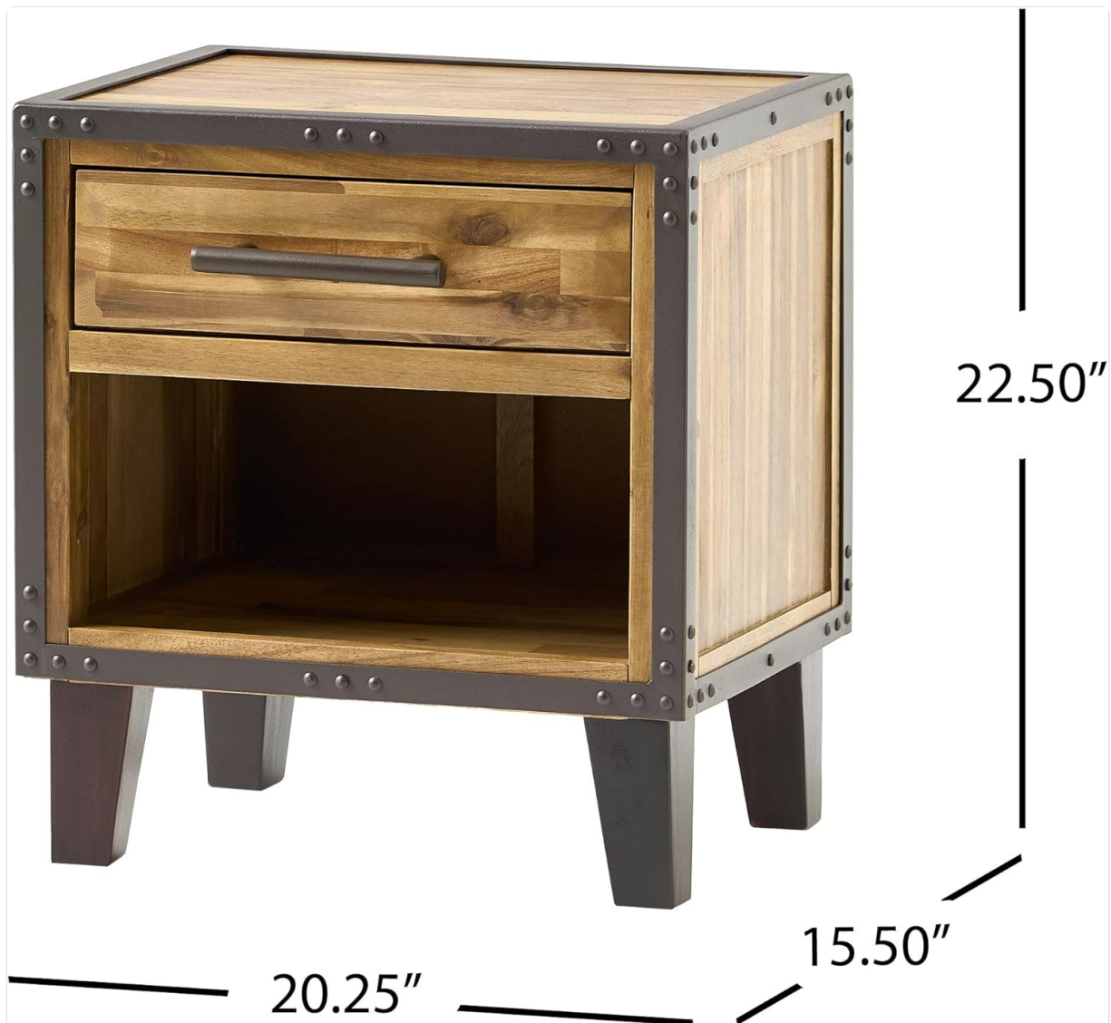
Image: A diagram illustrating the dimensions of the GDFStudio Luna Accent Table: 22.5 inches high, 20.25 inches wide, and 15.5 inches deep.