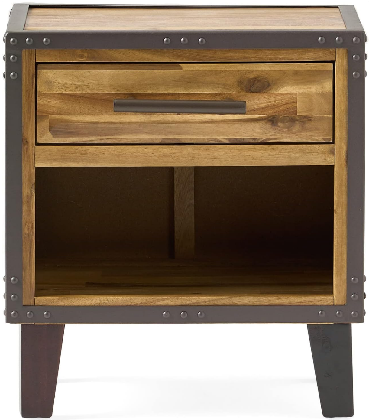
Image: A clear front view of the GDFStudio Luna Accent Table, showing the main body with its drawer and open shelf, ready for leg attachment.