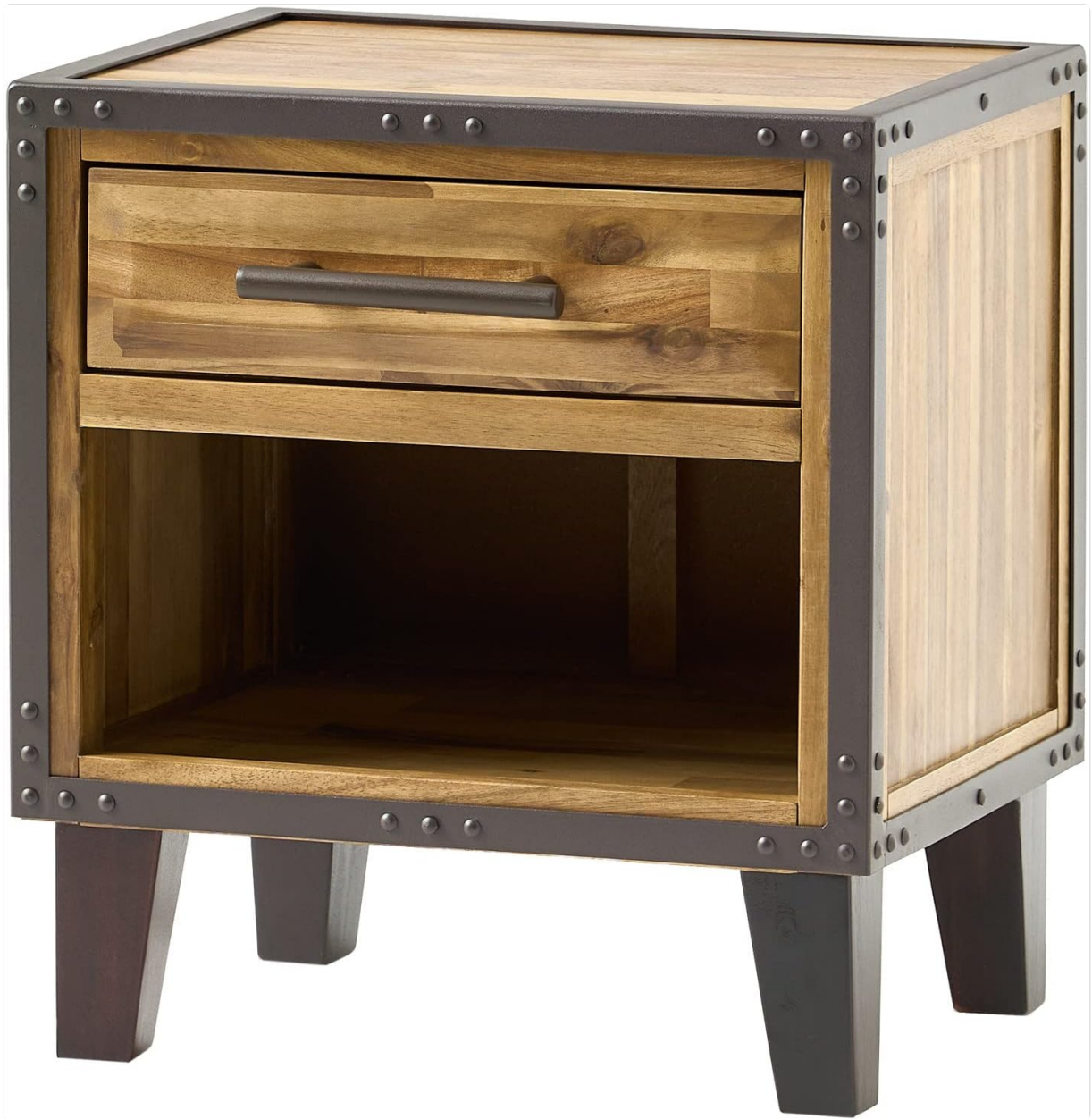
Image: The GDFStudio Luna Acacia Wood Accent Table, showcasing its natural acacia wood finish and industrial iron frame with a single drawer and open bottom shelf.