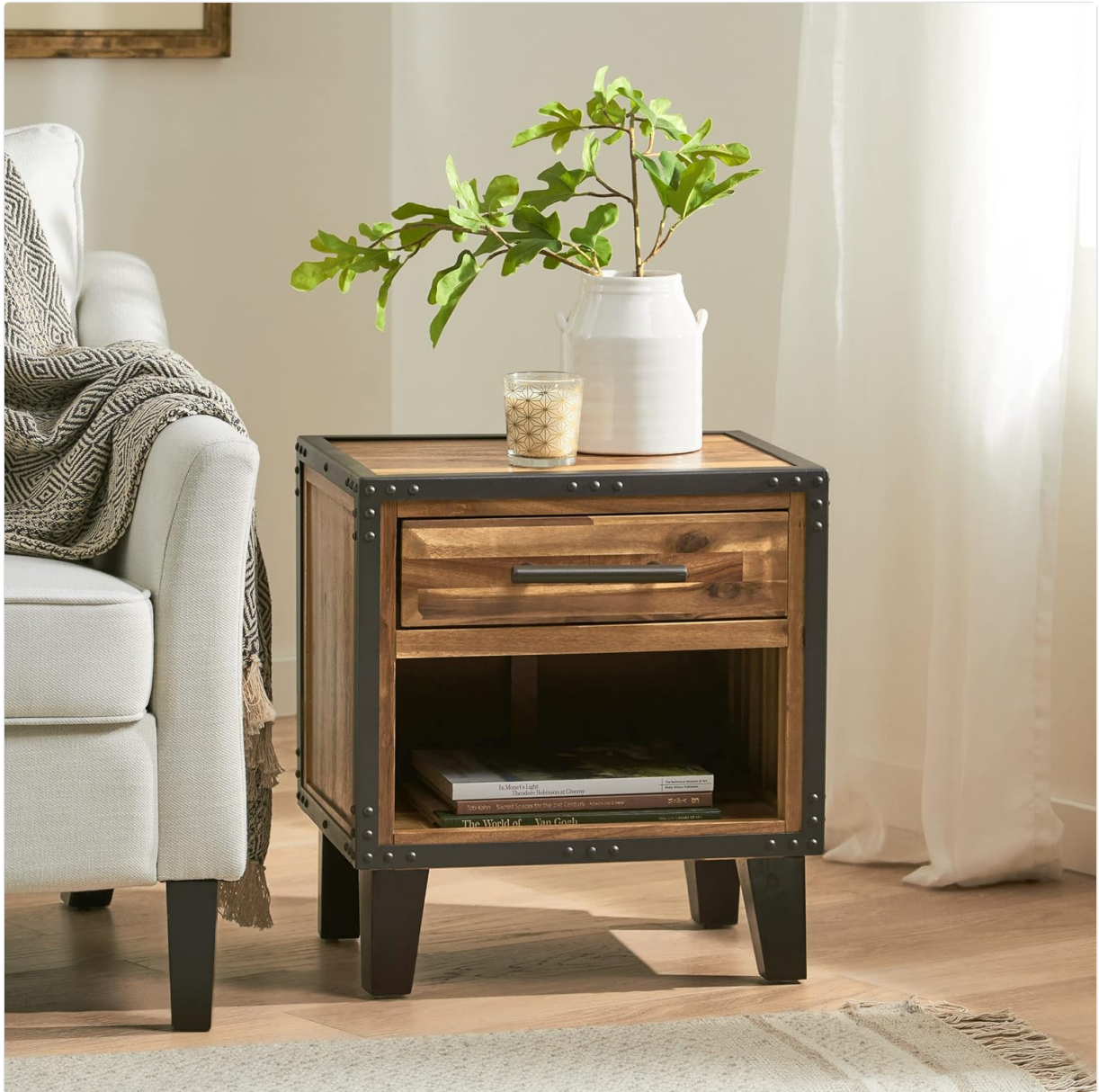
Image: The GDFStudio Luna Accent Table positioned next to a sofa in a living room, demonstrating its use as an end table with a plant and candle on top, and books on the shelf.