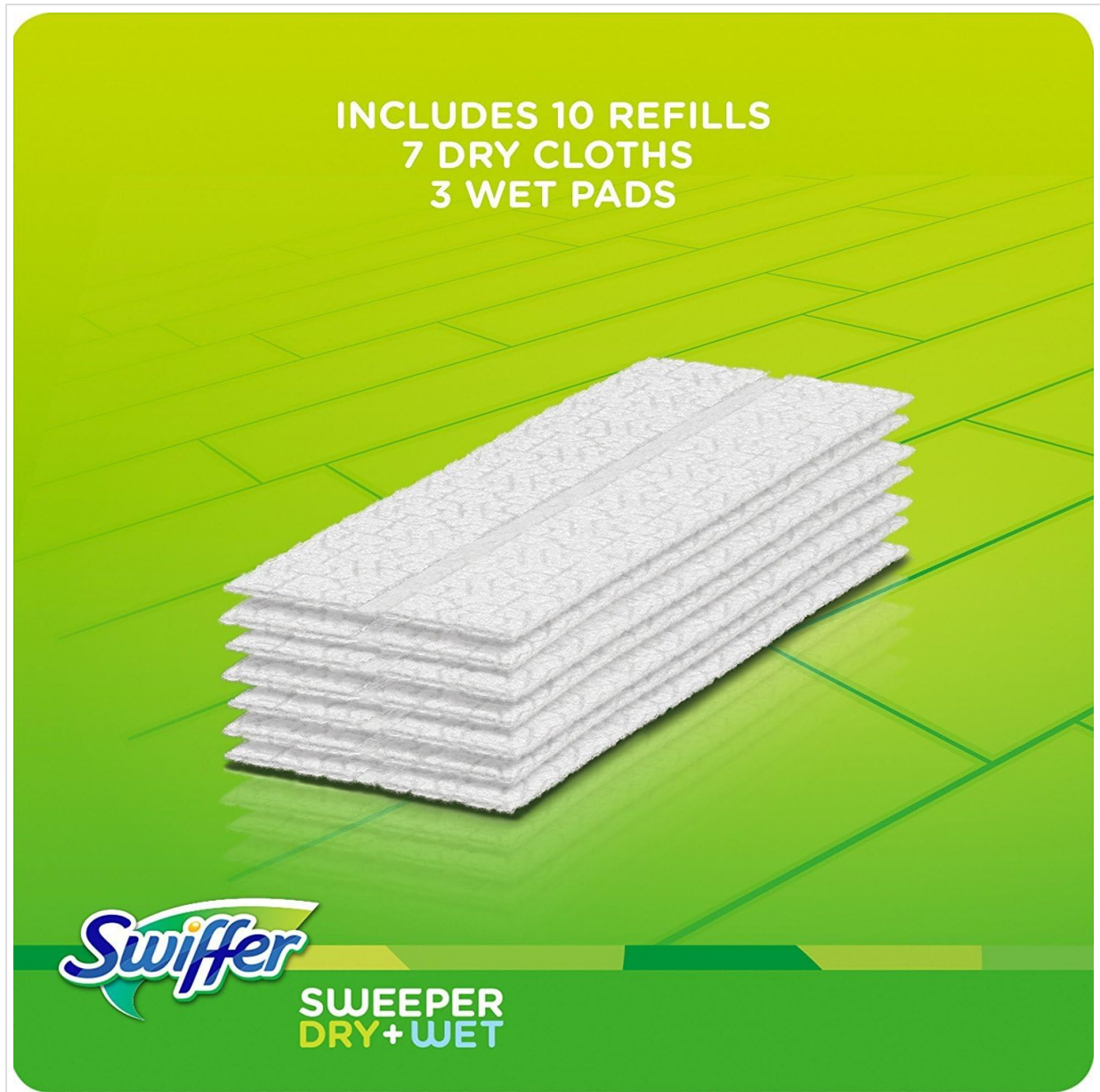
Figure 8: Swiffer Sweeper refill pads for continuous cleaning.