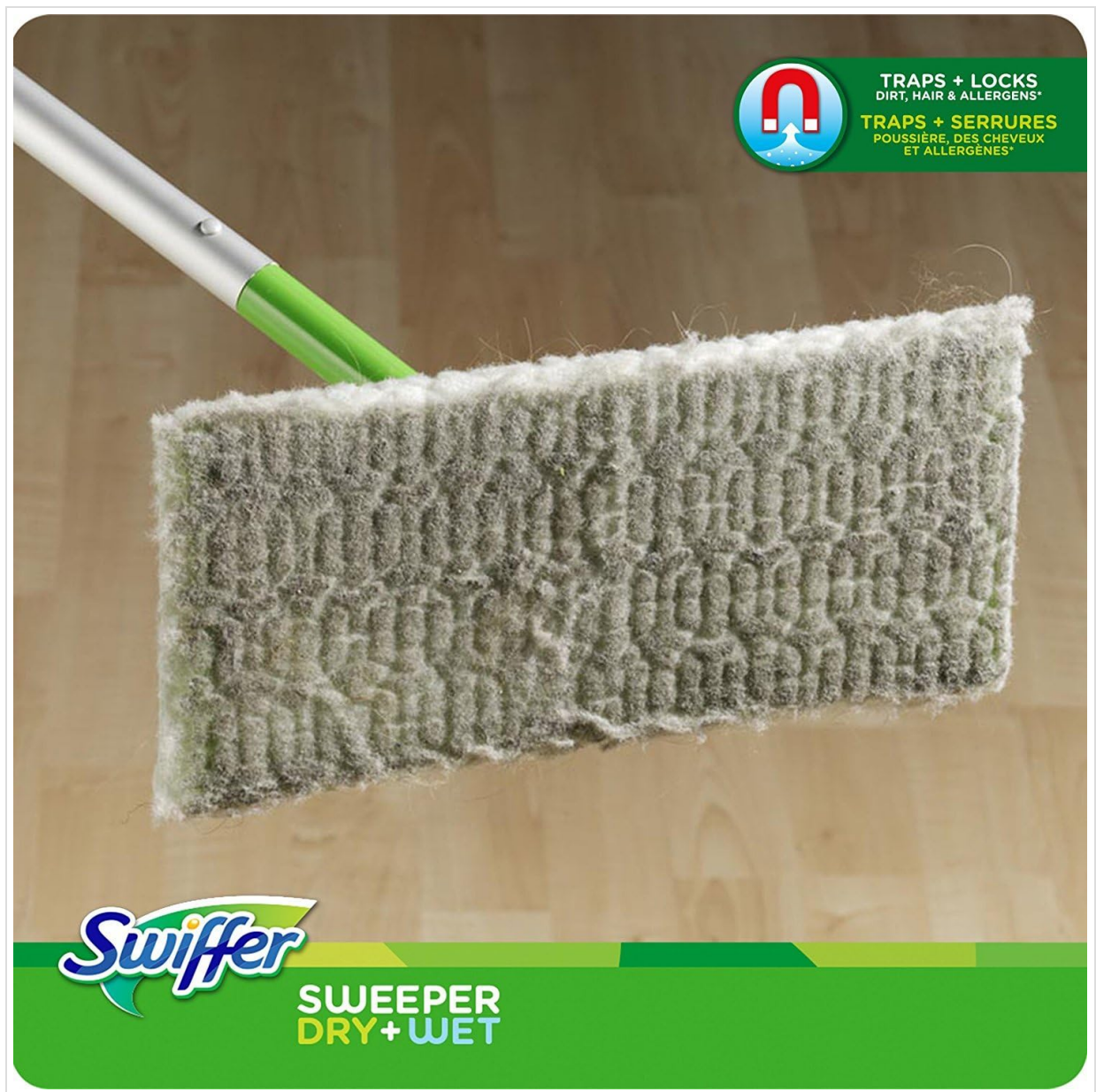
Figure 5: A used dry cloth demonstrating its dirt-trapping capabilities.