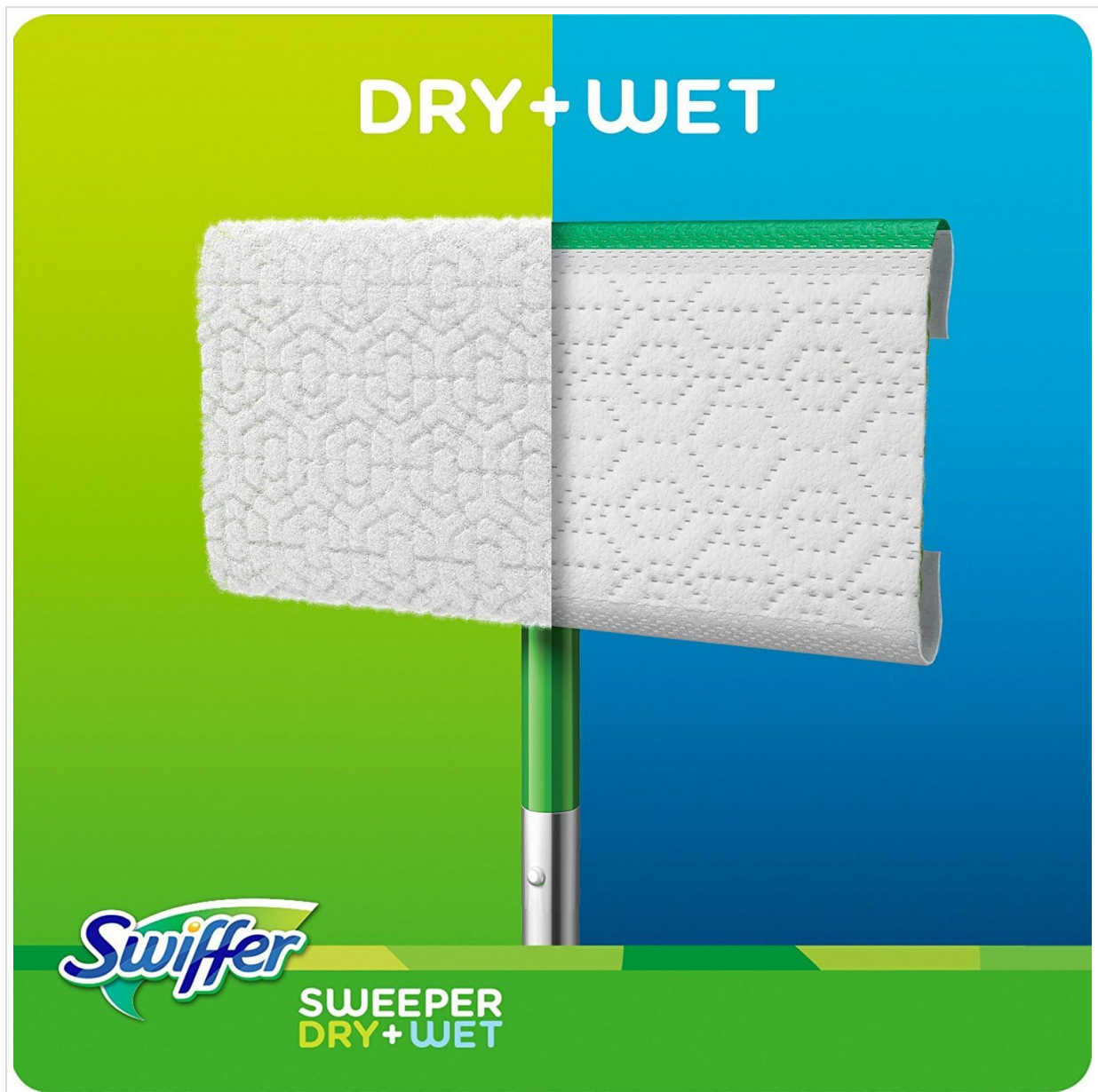
Figure 3: Comparison of dry and wet pads on the Swiffer Sweeper.