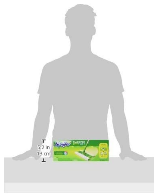
Figure 9: Product packaging displaying dimensions and key features.