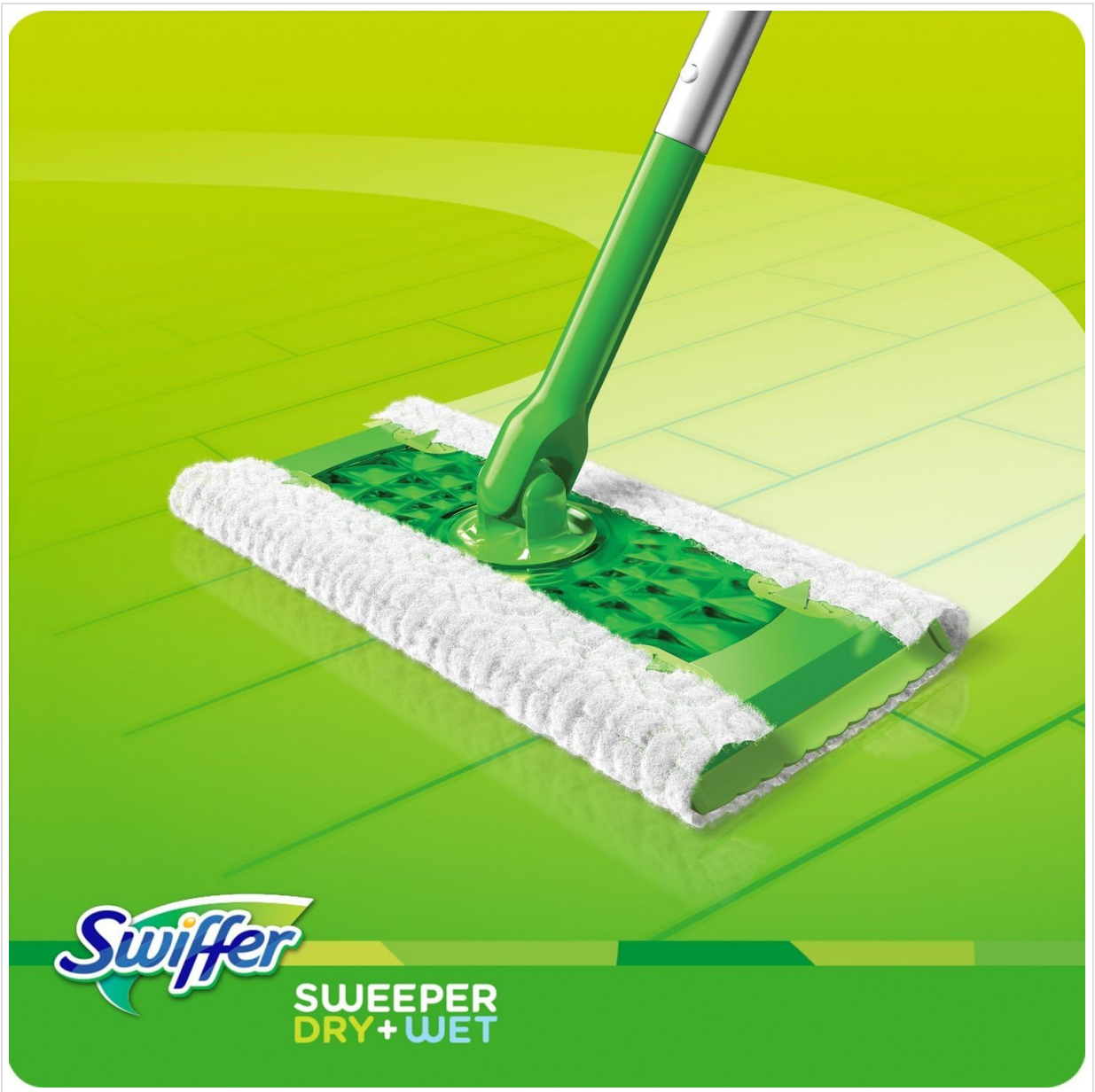
Figure 6: Wet mopping in progress, showing the cleaning action.