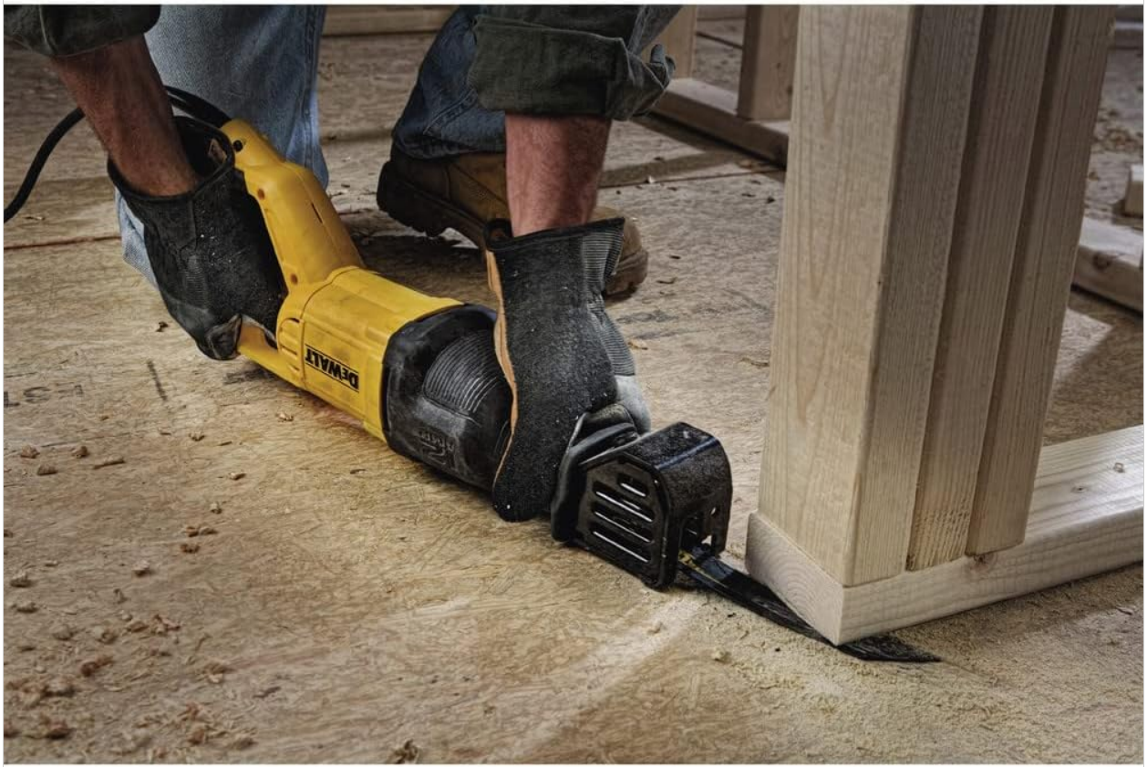
Image: A person demonstrating a flush cut with the DEWALT DWE305 reciprocating saw, cutting a piece of wood flush with a vertical wooden frame.