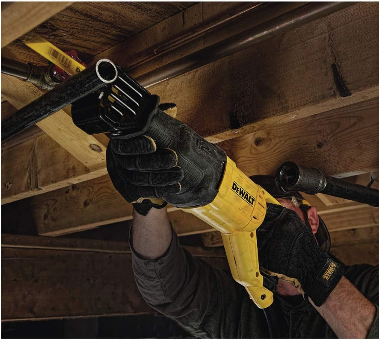
Image: A person using the DEWALT DWE305 reciprocating saw to cut an overhead metal pipe, illustrating the tool's versatility for various angles and positions.