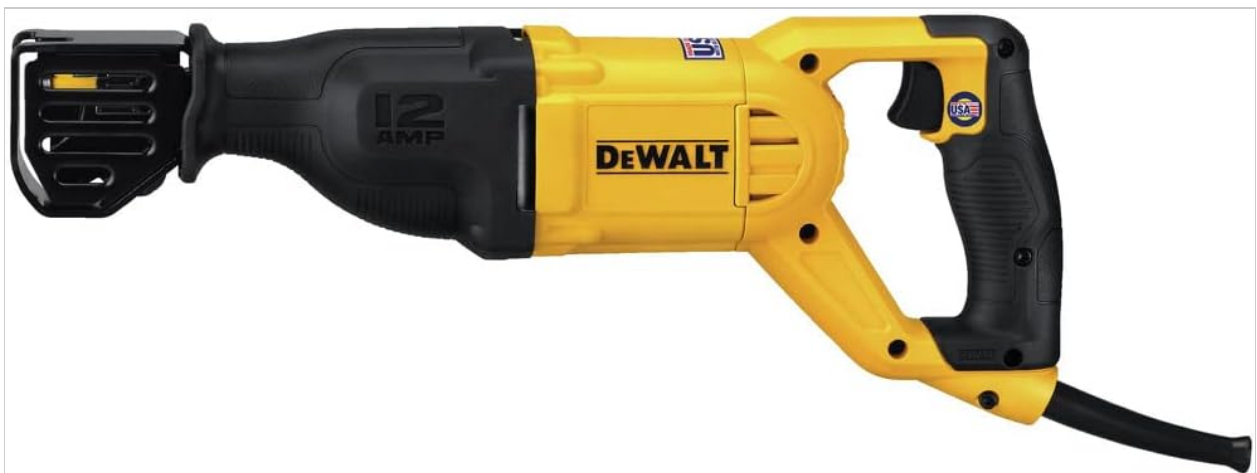
Image: Front view of the DEWALT DWE305 Reciprocating Saw, highlighting the blade clamp mechanism.