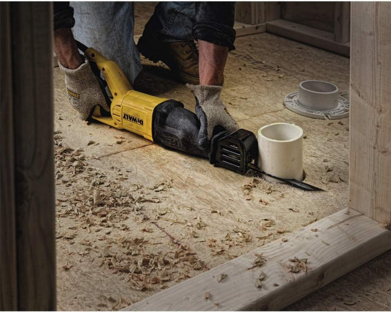
Image: A person using the DEWALT DWE305 reciprocating saw to cut through a wooden beam laid on a floor, demonstrating a common cutting application.