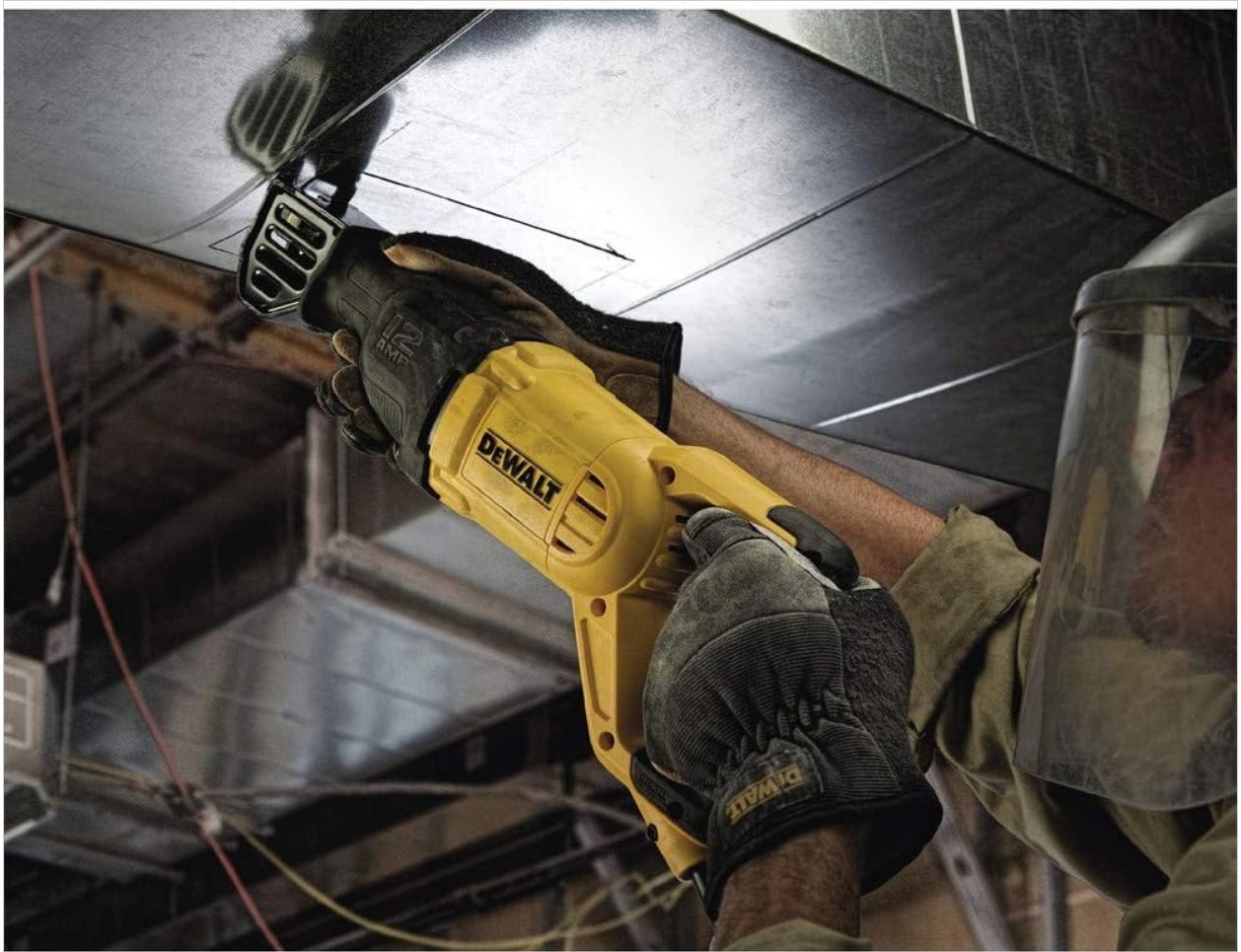
Image: A person using the DEWALT DWE305 reciprocating saw to cut through metal ductwork, highlighting its application in HVAC or demolition tasks.