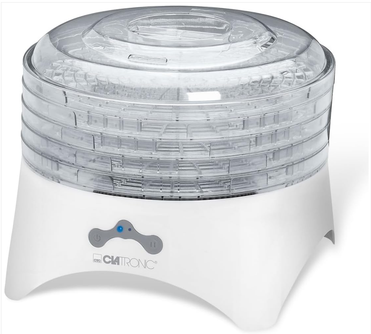
Image 1: Fully assembled Clatronic DR 3525 Food Dehydrator. This image shows the base unit, five transparent drying trays, and the top lid, providing a complete view of the appliance.