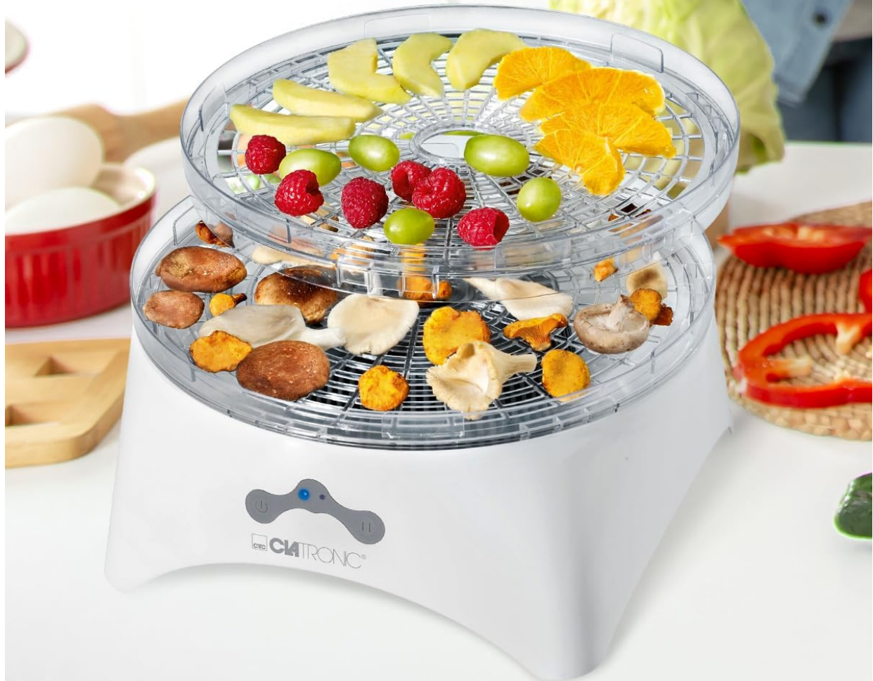
Image 5: The Clatronic DR 3525 in operation, showing various fruits and mushrooms on the drying trays. This image emphasizes the ease of use: simply place ingredients, set the desired temperature, and enjoy naturally preserved foods.

Legen Sie einfach Ihre Zutaten in den Dörrautomat, stellen Sie die gewünschte Temperatur ein und genießen Sie natürlich konservierte Lebensmittel.