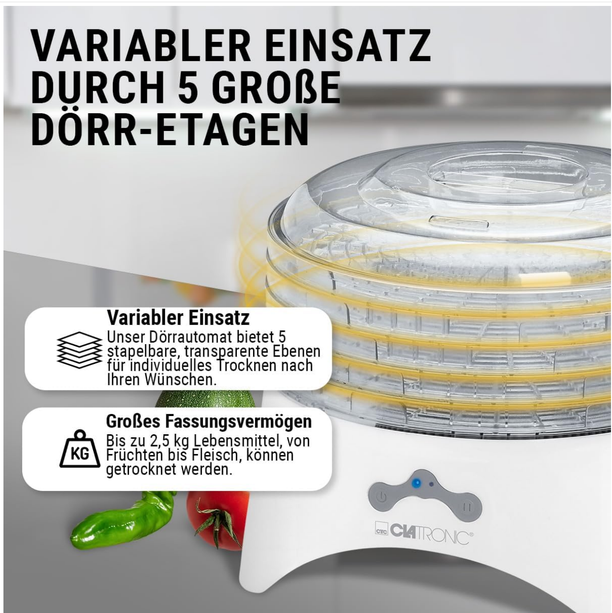
Image 2: The Clatronic DR 3525 demonstrating its 5 stackable drying trays. The image highlights the variable use and large capacity of up to 2.5 kg of food, showcasing the transparent design of the trays.

Bis zu 2,5 kg Lebensmittel, von Früchten bis Fleisch, können getrocknet werden.