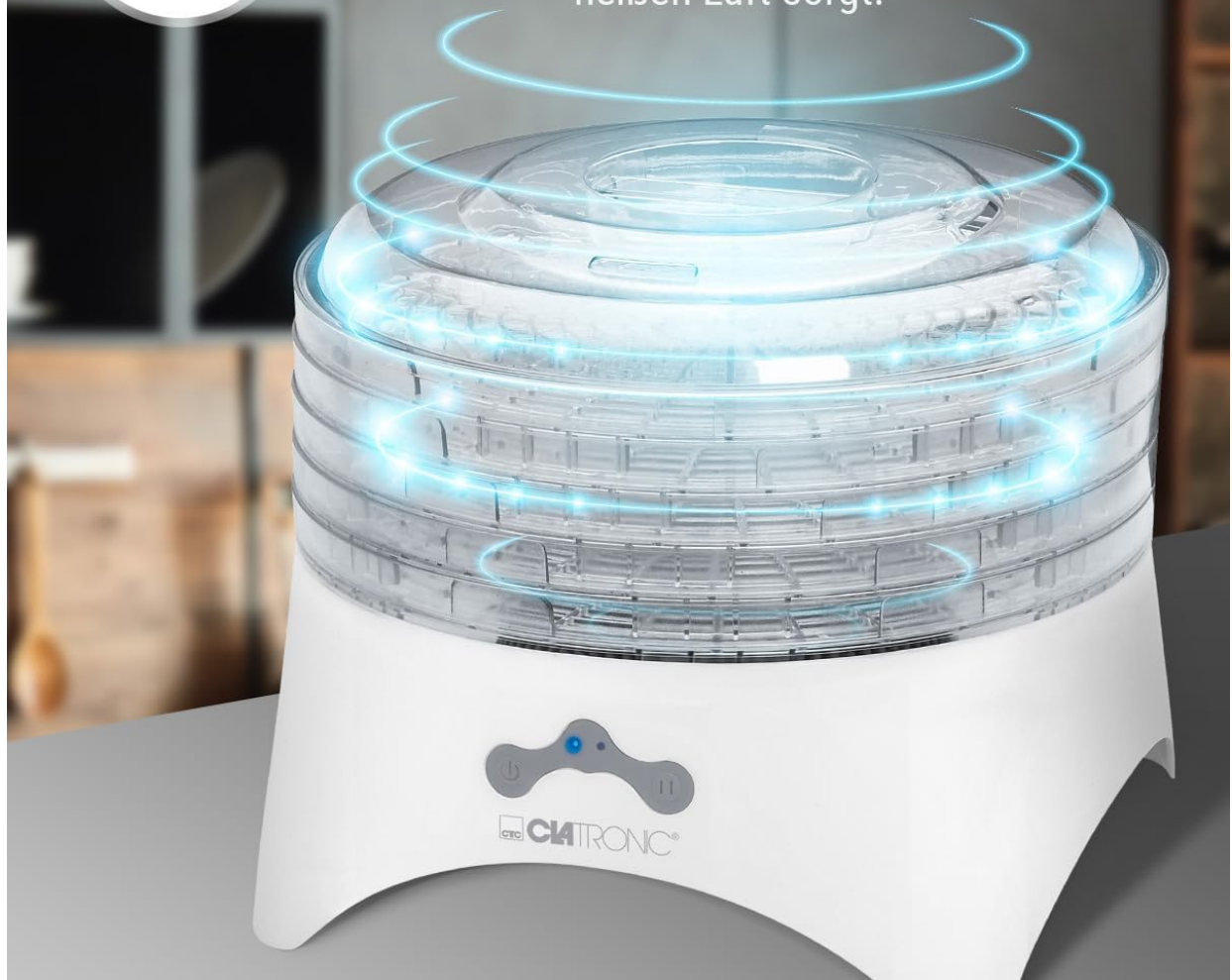
Image 4: Illustration of the high-quality recirculation fan within the Clatronic DR 3525. This graphic demonstrates how the fan ensures even distribution of hot air for consistent drying results across all trays.

Unser Dörrautomat verfügt über ein leistungsstarkes Umluftgebläse, das für eine gleichmäßige Verteilung der heißen Luft sorgt.