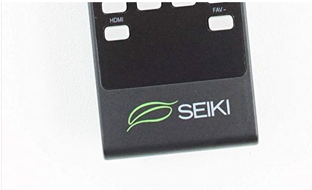
Figure 3: Angled view of the Seiki remote control, showing the arrangement of buttons.

Power (Red Button): Turns the television on or off.