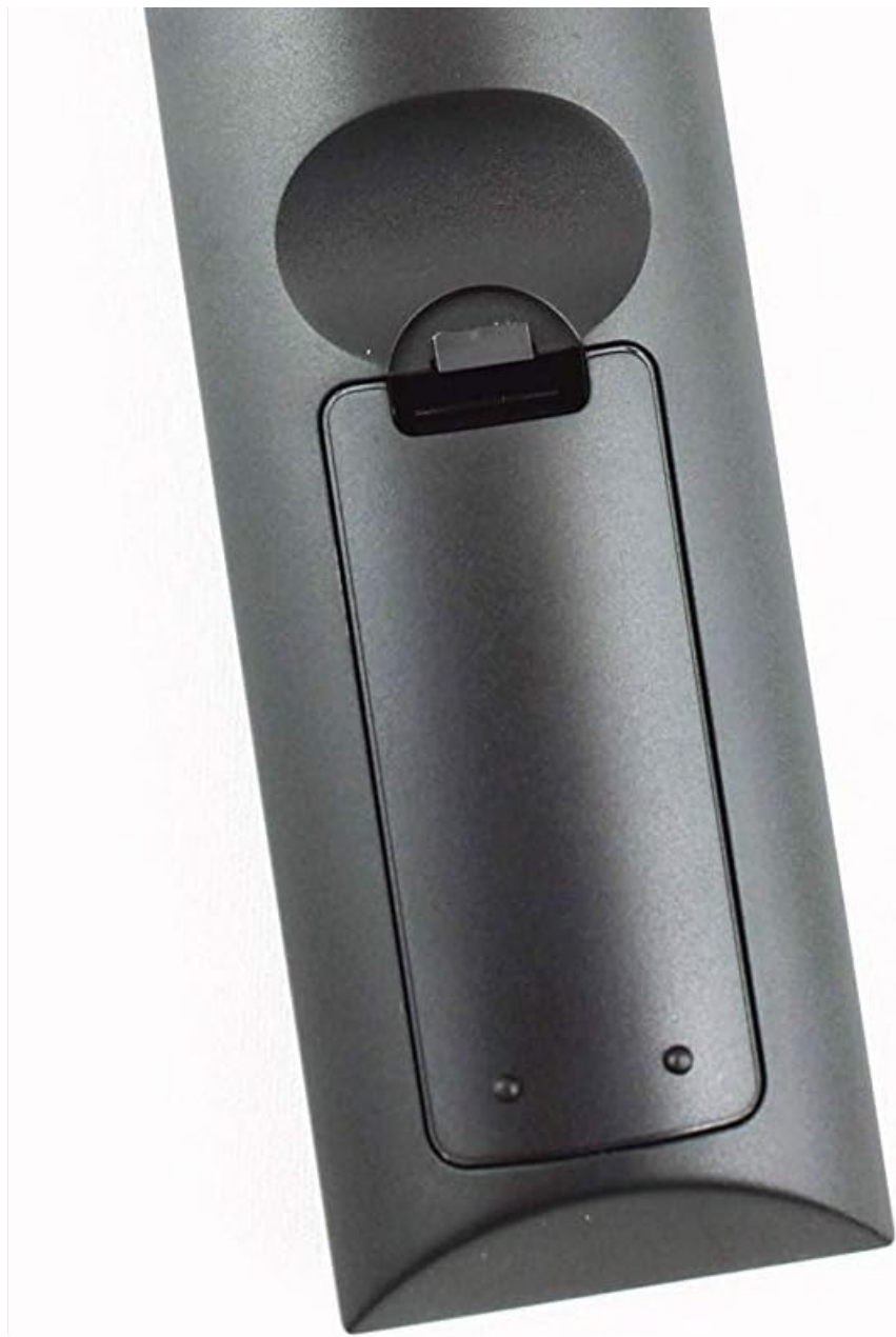
Figure 2: Back view of the Seiki remote control, showing the battery compartment cover.