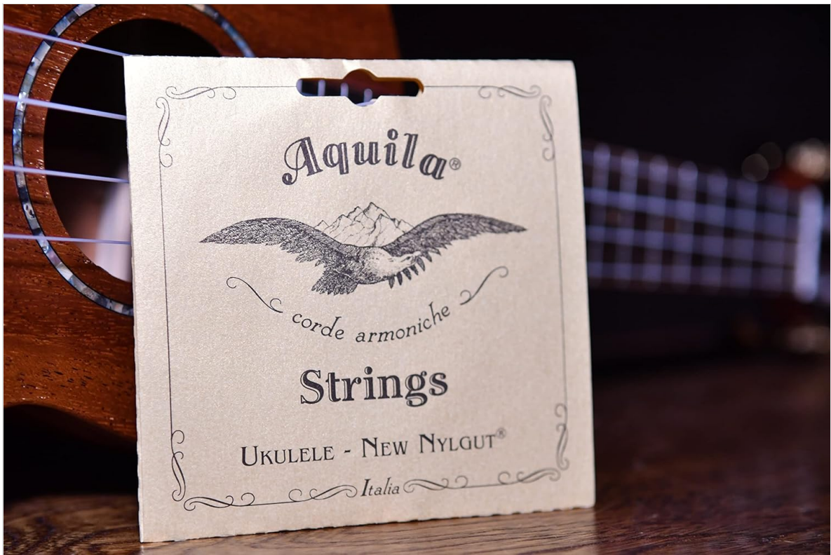
Image: Front of Aquila AQ-10 New Nylgut Tenor Ukulele Strings packaging, showing the brand logo and product name.