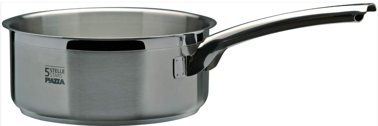
Image: The Piazza 5 Star Collection Stainless Steel Medium Sauce Pan, showcasing its polished exterior and ergonomic handle.