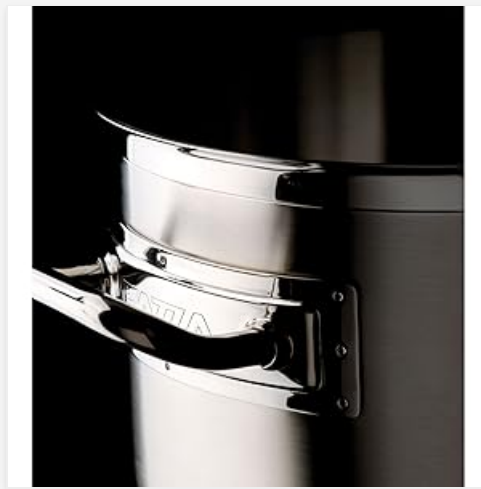
Image: A detailed view of the handle's attachment to the pan, showing the secure welding points.