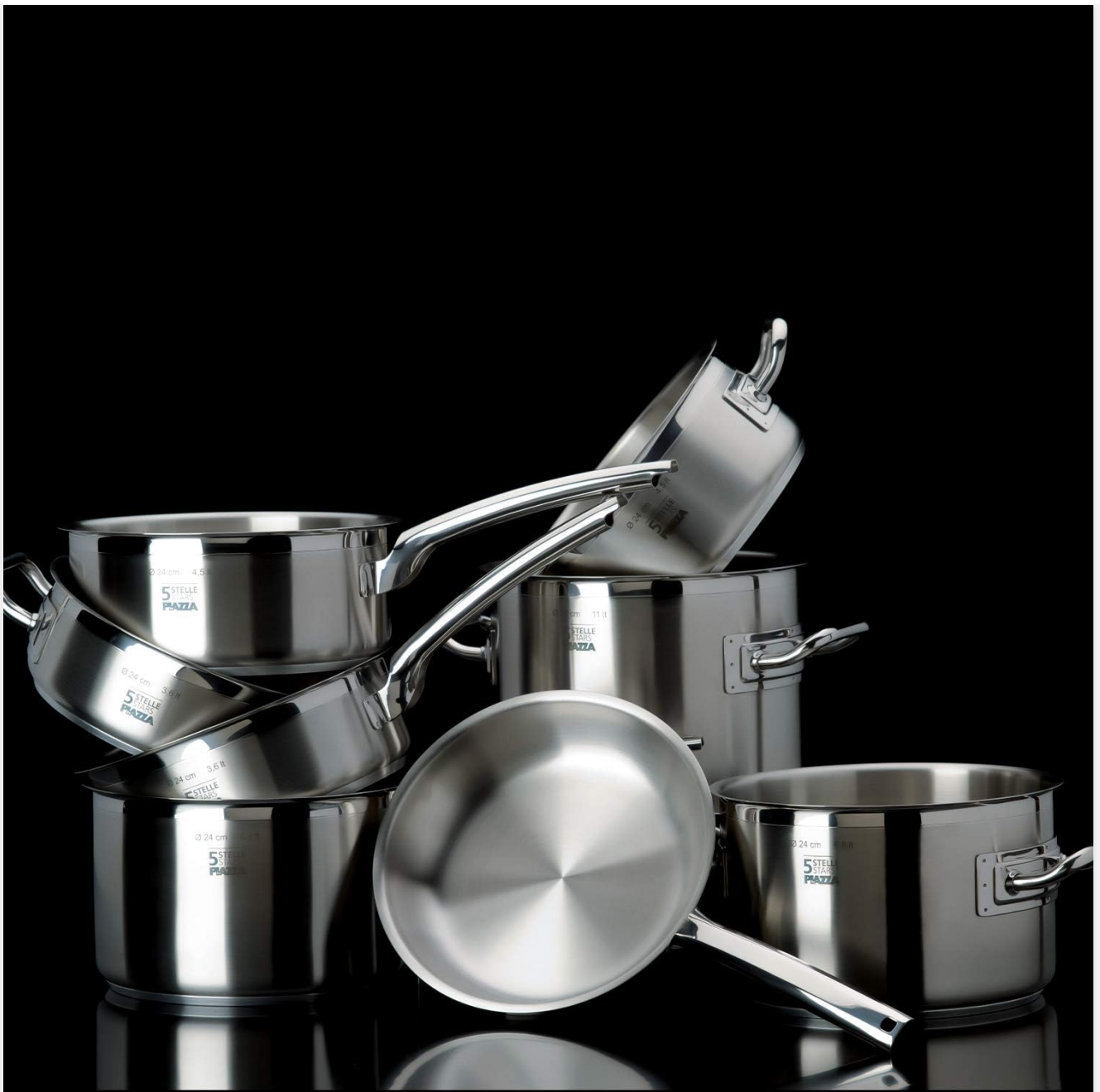
Image: A display of various pots and pans from the Piazza 5 Star Collection, highlighting the range of available cookware.