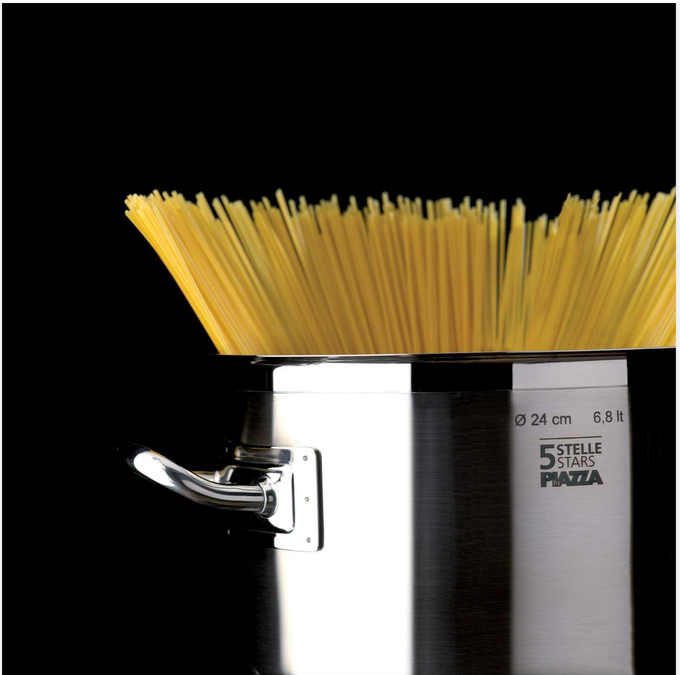
Image: The sauce pan filled with spaghetti, demonstrating its capacity and suitability for various cooking tasks.