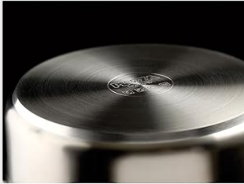
Image: A close-up view of the bottom of the sauce pan, showing the Piazza brand engraving.