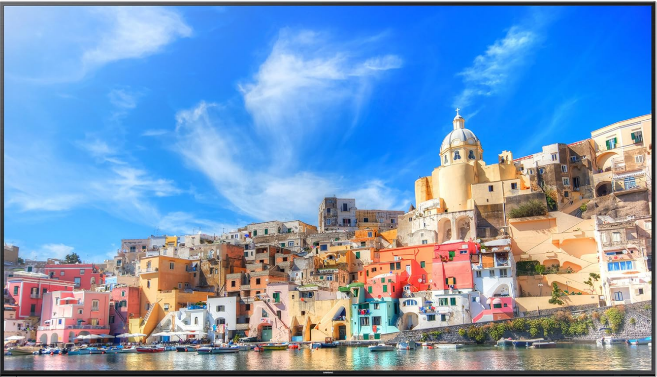
Figure 4.1: Front view of the Samsung QM85D UHD SMART Signage Display. This image shows the large 85-inch screen displaying a colorful image of a coastal town under a blue sky, highlighting its superior picture quality.

Due to the size and weight of the QM85D, it is recommended that at least two people handle the display during unpacking and installation. Place the display on a stable, flat surface or mount it securely using a VESA-compatible wall mount (not included).