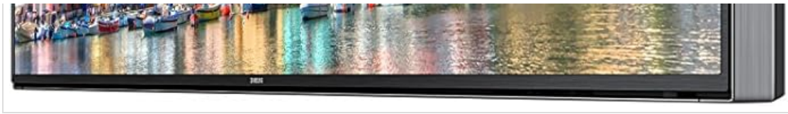
Figure 5.1: Angled view of the Samsung QM85D display. This perspective highlights the display's sleek design and large screen area, ideal for impactful digital signage applications.