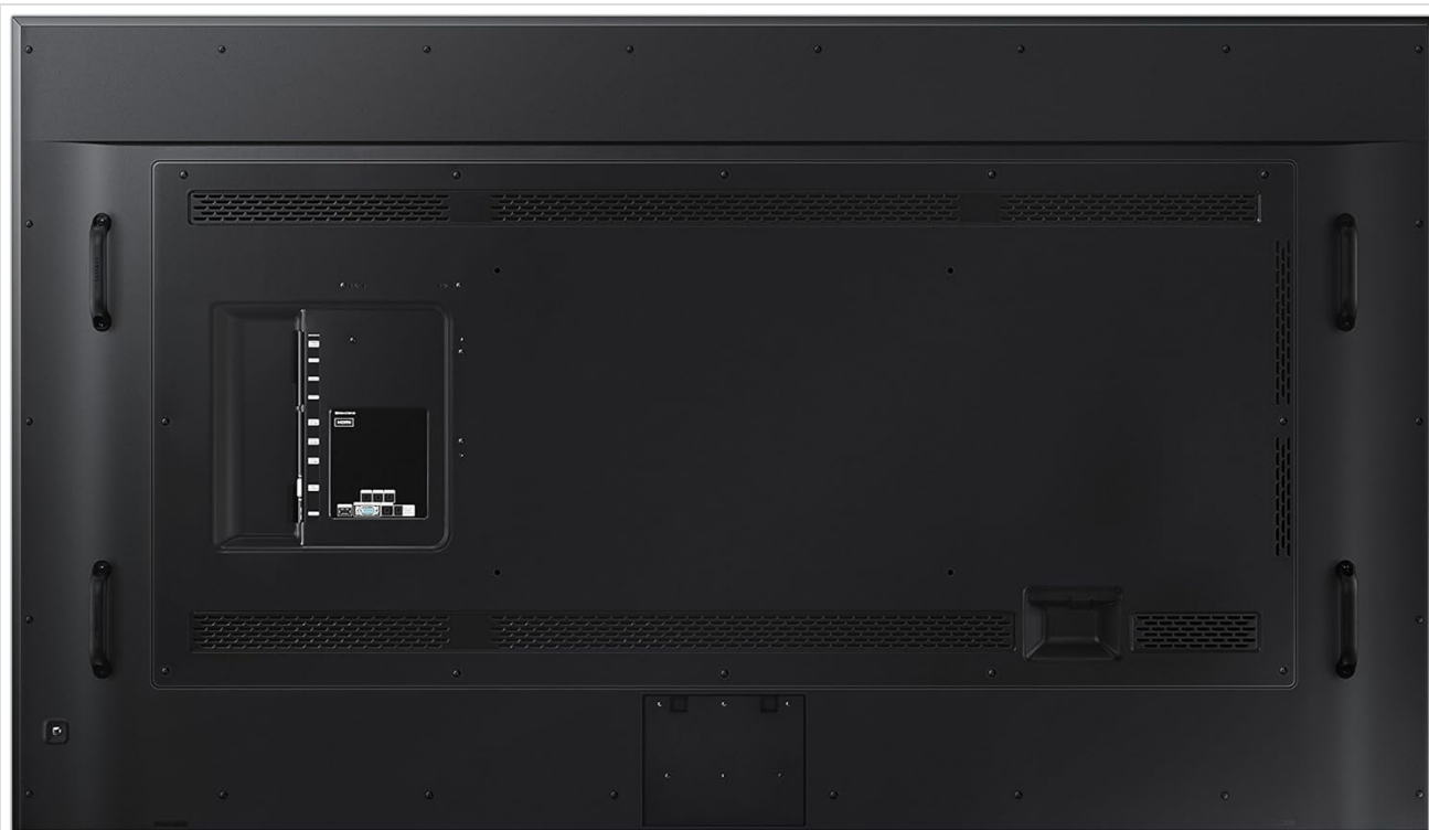
Figure 4.2: Rear view of the Samsung QM85D display. This image details the arrangement of input/output ports, including HDMI, DisplayPort, USB, and LAN connections, essential for connecting external devices and power.