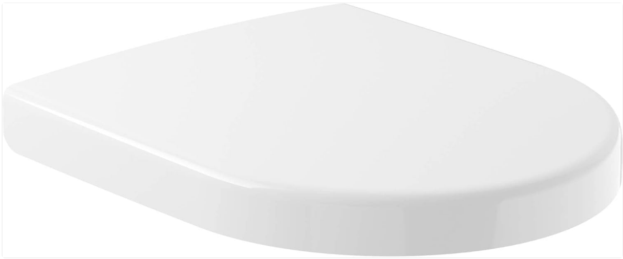
Image: The Villeroy & Boch Subway Compact Toilet Seat in White Alpin, showcasing its D-shaped design and smooth finish.