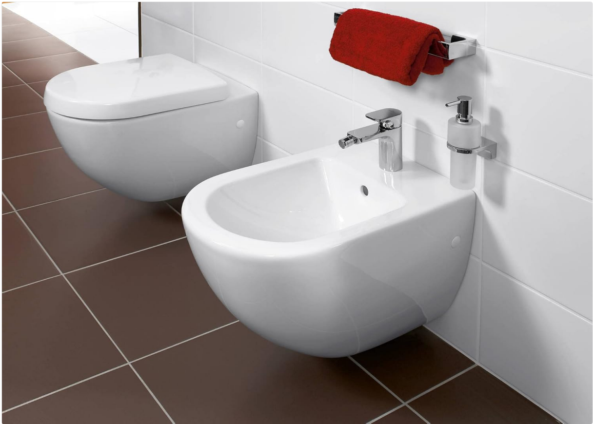
Image: The Villeroy & Boch Subway Compact Toilet Seat shown installed on a wall-mounted toilet, demonstrating its integrated appearance.