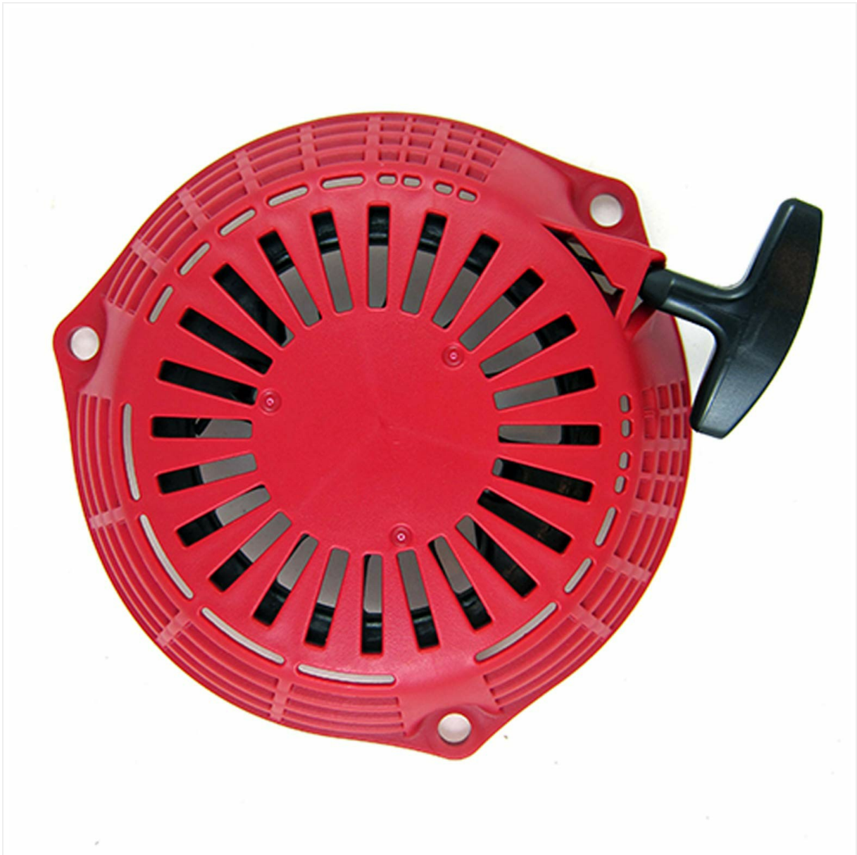
Figure 1: Location of the recoil starter assembly on a Honda walk-behind lawn mower.

This recoil starter assembly is specifically designed for the following Honda HRR216 series walk-behind lawn mower models: