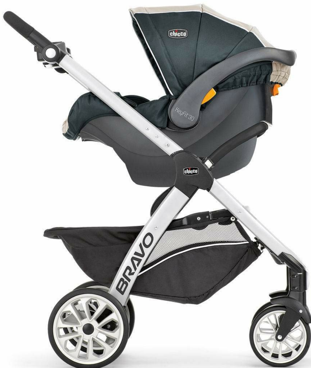
Figure 2: KeyFit 30 Infant Car Seat securely attached to the Bravo Stroller.

Video 1: Official overview of the Chicco Bravo Trio Travel System, demonstrating key features and assembly.