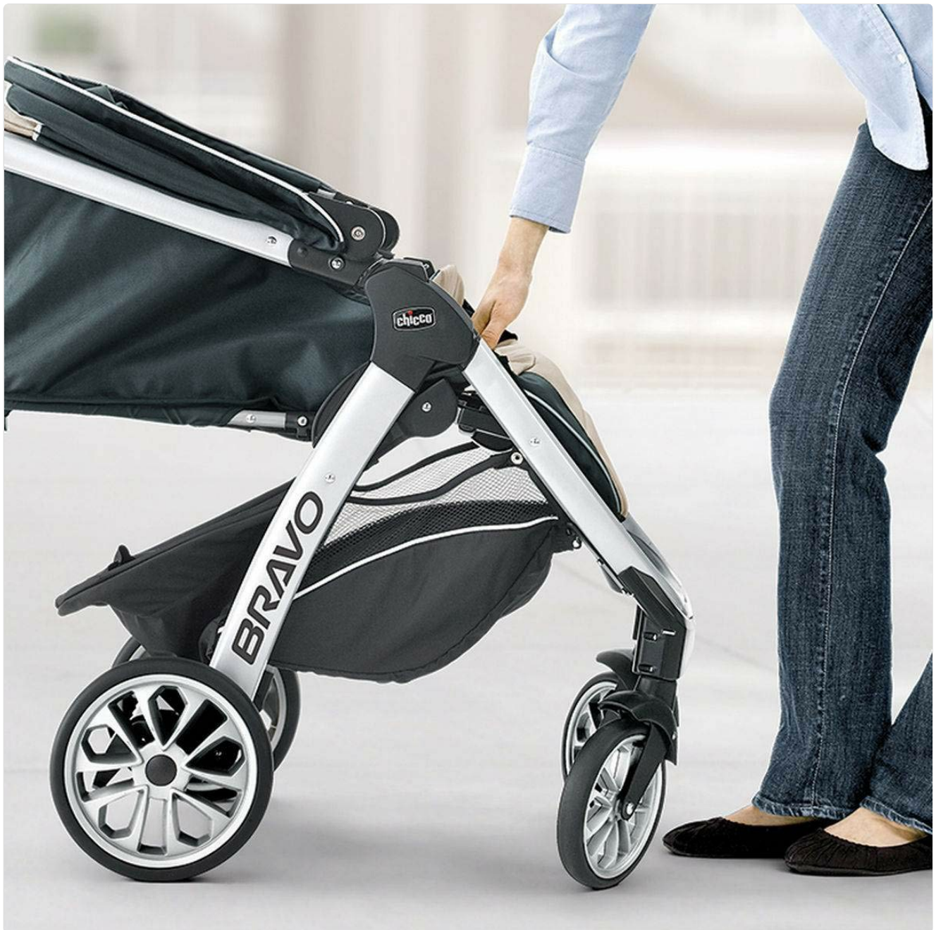
Figure 5: The Bravo Stroller in its compact, self-standing folded position.

Video 2: Quick demonstration of the one-hand folding and unfolding of the Chicco Bravo Stroller.