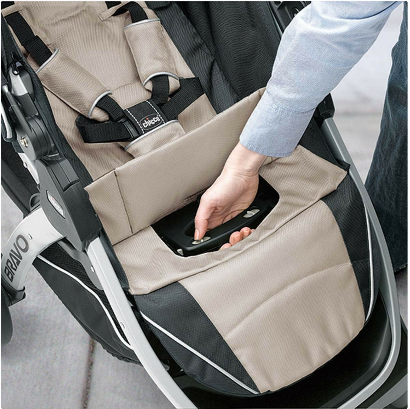
Figure 4: Demonstrating the one-hand fold mechanism.