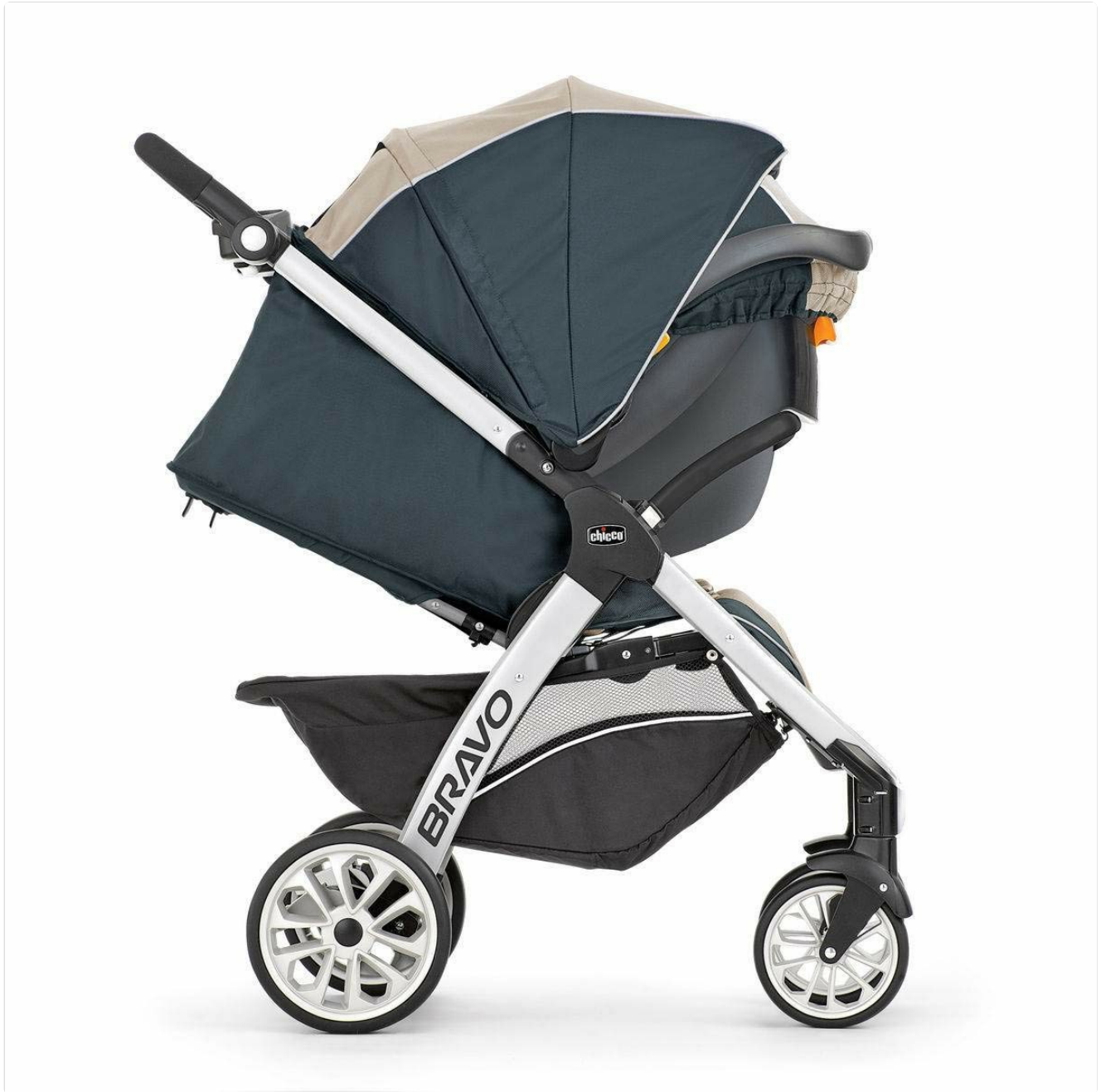
Figure 3: Stroller canopy extended for sun protection.

The extendable canopy provides ample shade. Pull the canopy forward to extend it. A peek-a-boo window allows you to check on your child without disturbing them.