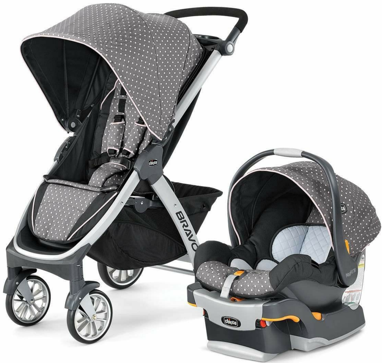
Figure 1: Chicco Bravo Trio Travel System, featuring the stroller and KeyFit 30 Infant Car Seat.