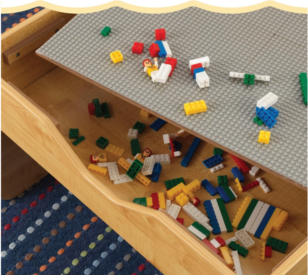
Image: A close-up view of the hidden storage compartment beneath the reversible tabletop, which is partially lifted. The compartment is filled with various colorful building bricks. The text "Hidden storage under lid" is displayed.