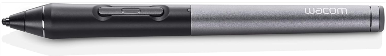
Image 3.1: The stylus, its protective case, and the Micro-USB charging cable.