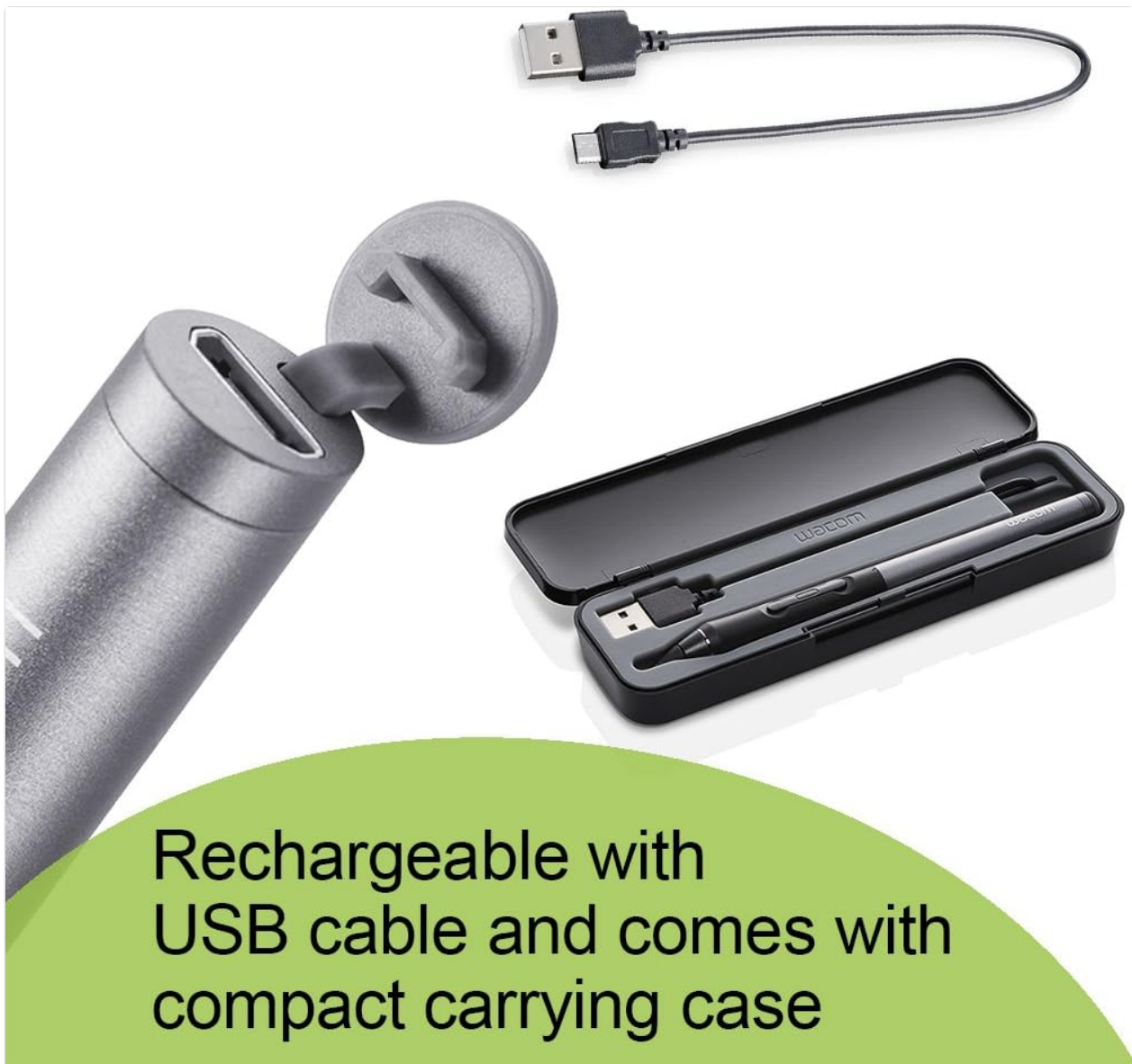
Image 4.1: The Micro-USB charging port located at the end of the stylus.