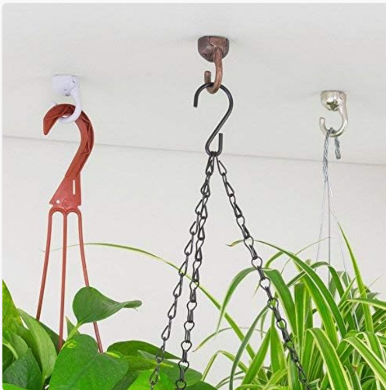
Image: Example of the ceiling hook in use, supporting hanging plants.