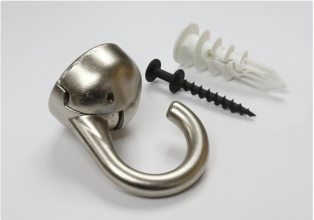
Image: The package includes the main hook, a screw, and a drywall anchor for versatile installation.