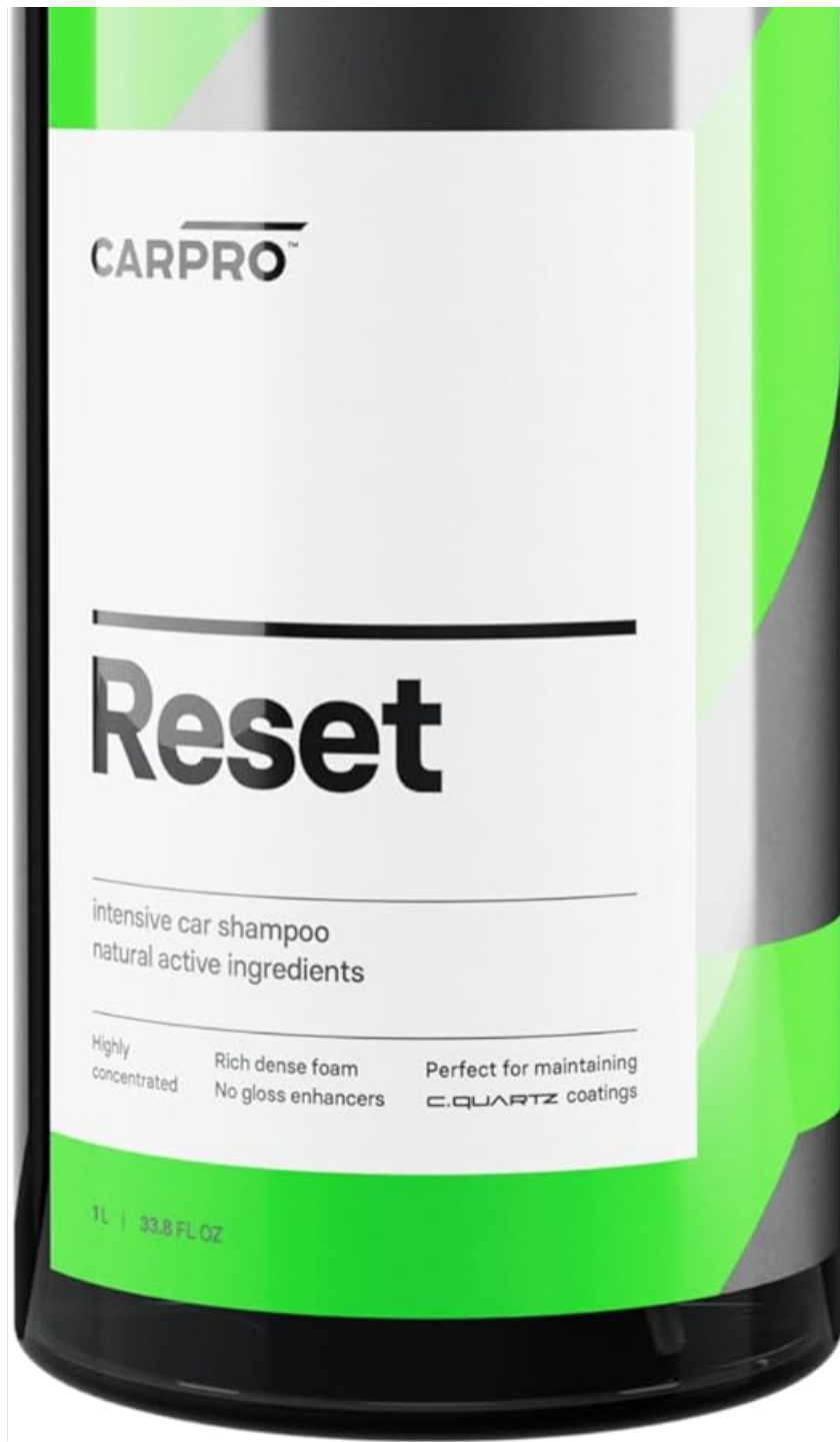
Image: A 1-liter bottle of CARPRO Reset car shampoo, featuring a black bottle with green and grey accents and white labeling.