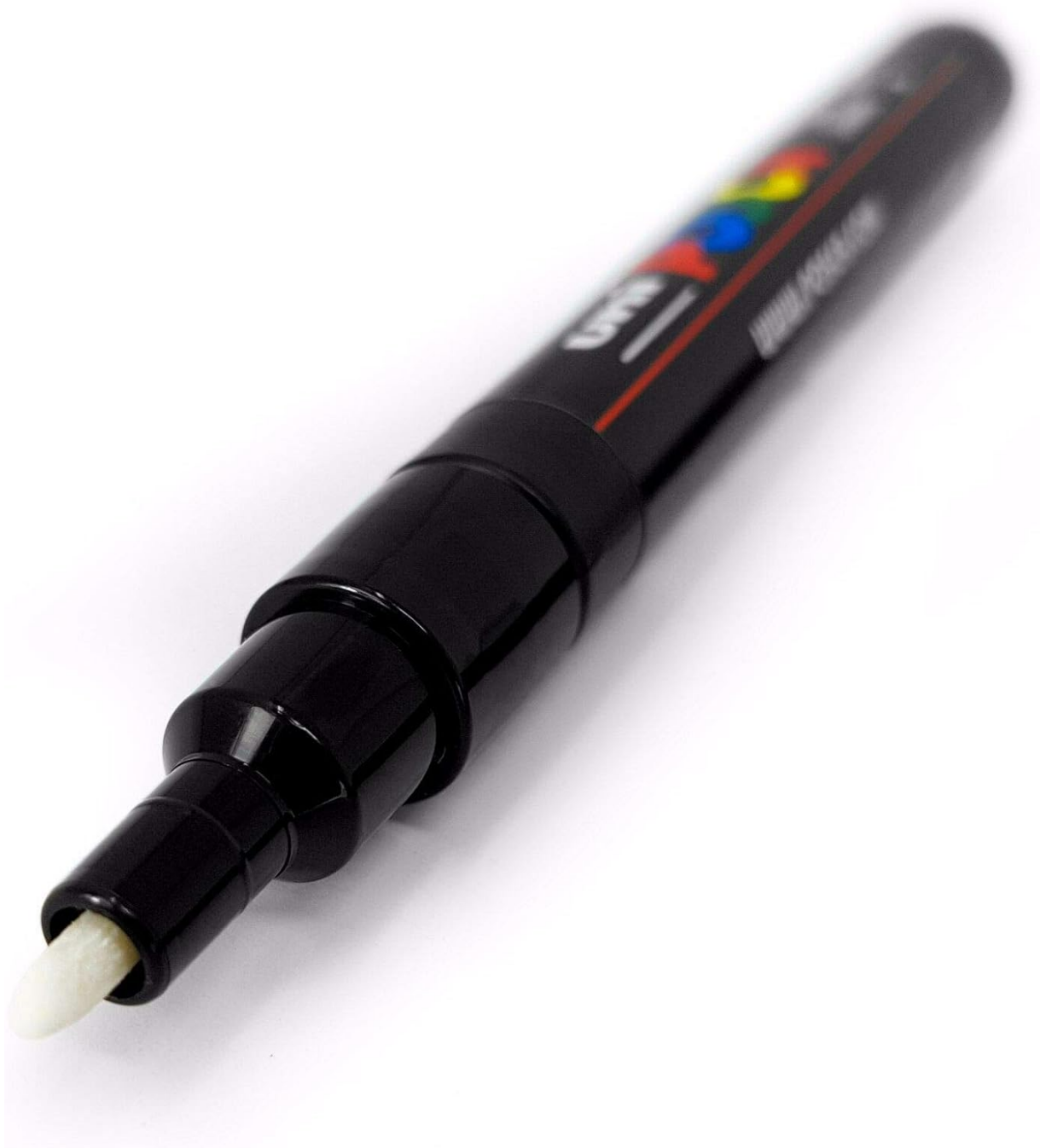
Image 2: Detailed view of the PC-3M marker's bullet tip, designed for precise lines and controlled ink flow.