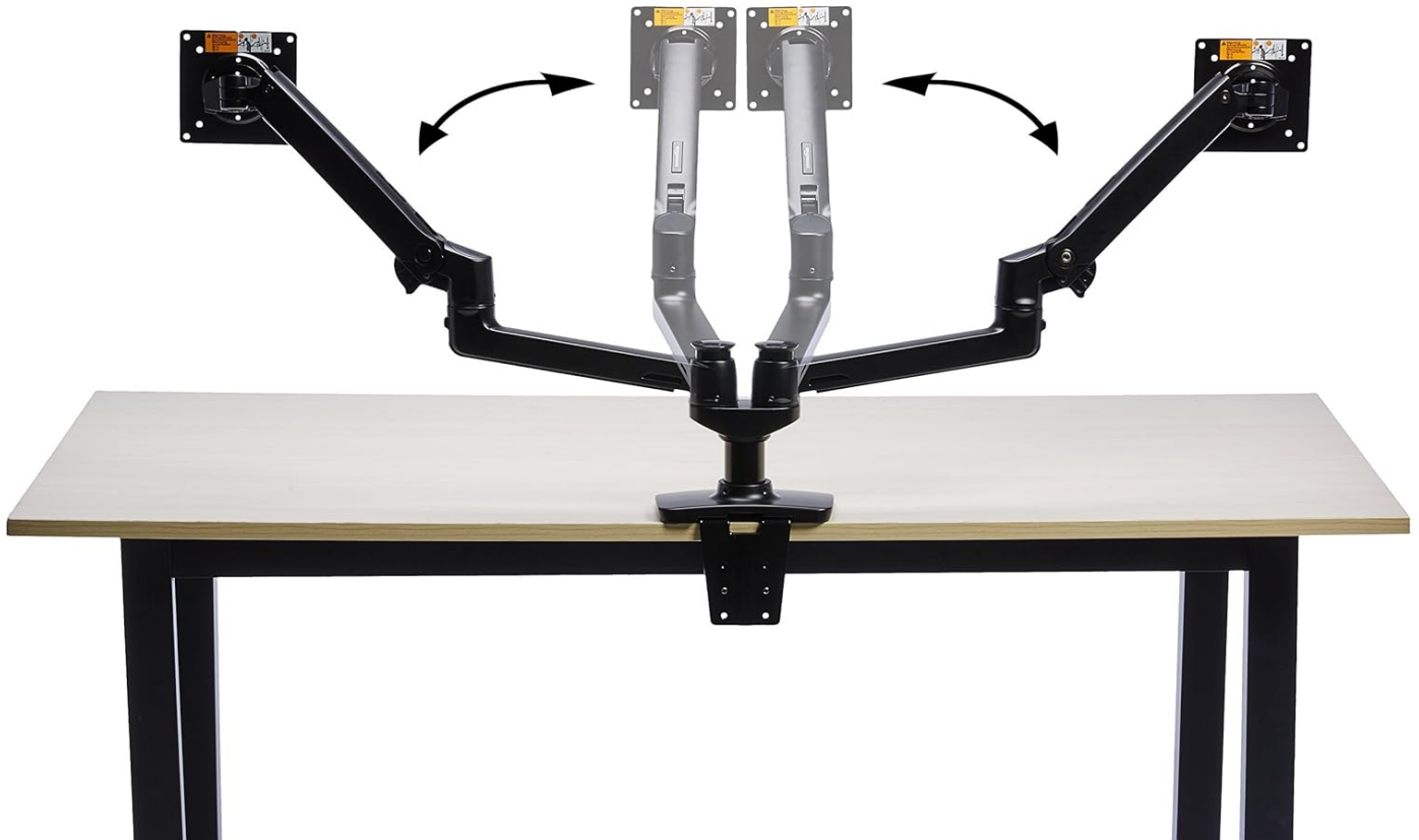
Image: The dual monitor stand demonstrating its adjustable positioning capabilities, allowing monitors to be moved left, right, up, and down.