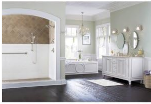
Image: A spacious bathroom featuring Moen Wynford collection fixtures, including a shower with a similar trim kit, demonstrating the product's aesthetic integration.