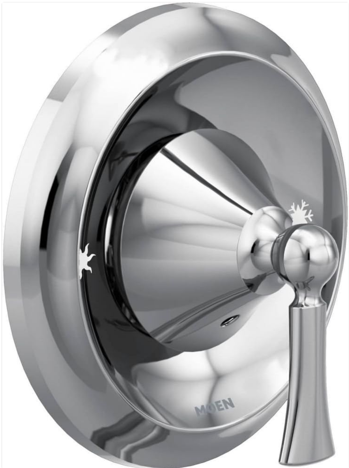
Image: The Moen Wynford Posi-Temp Shower Valve Trim Kit T5501, showcasing its polished chrome finish and single handle design.