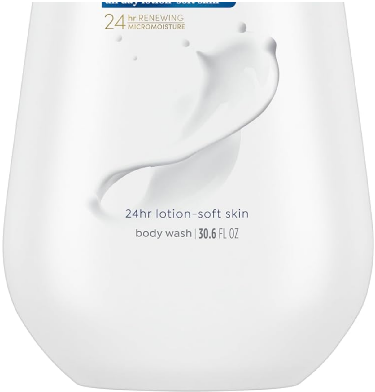
Image 1.1: Front view of the Dove Deep Moisture Body Wash bottle with pump.

This body wash is recognized for its quality, having received the Allure Best of Beauty award. It is also formulated with plant-based moisturizers and is PETA approved, reflecting a commitment to ethical and environmentally conscious production.