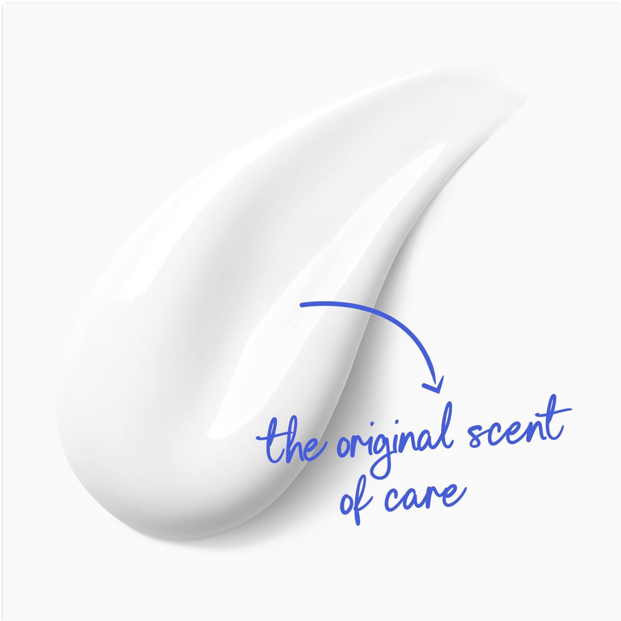
Image 3.2: Illustrates the application of the body wash, actively regenerating skin's natural moisture.