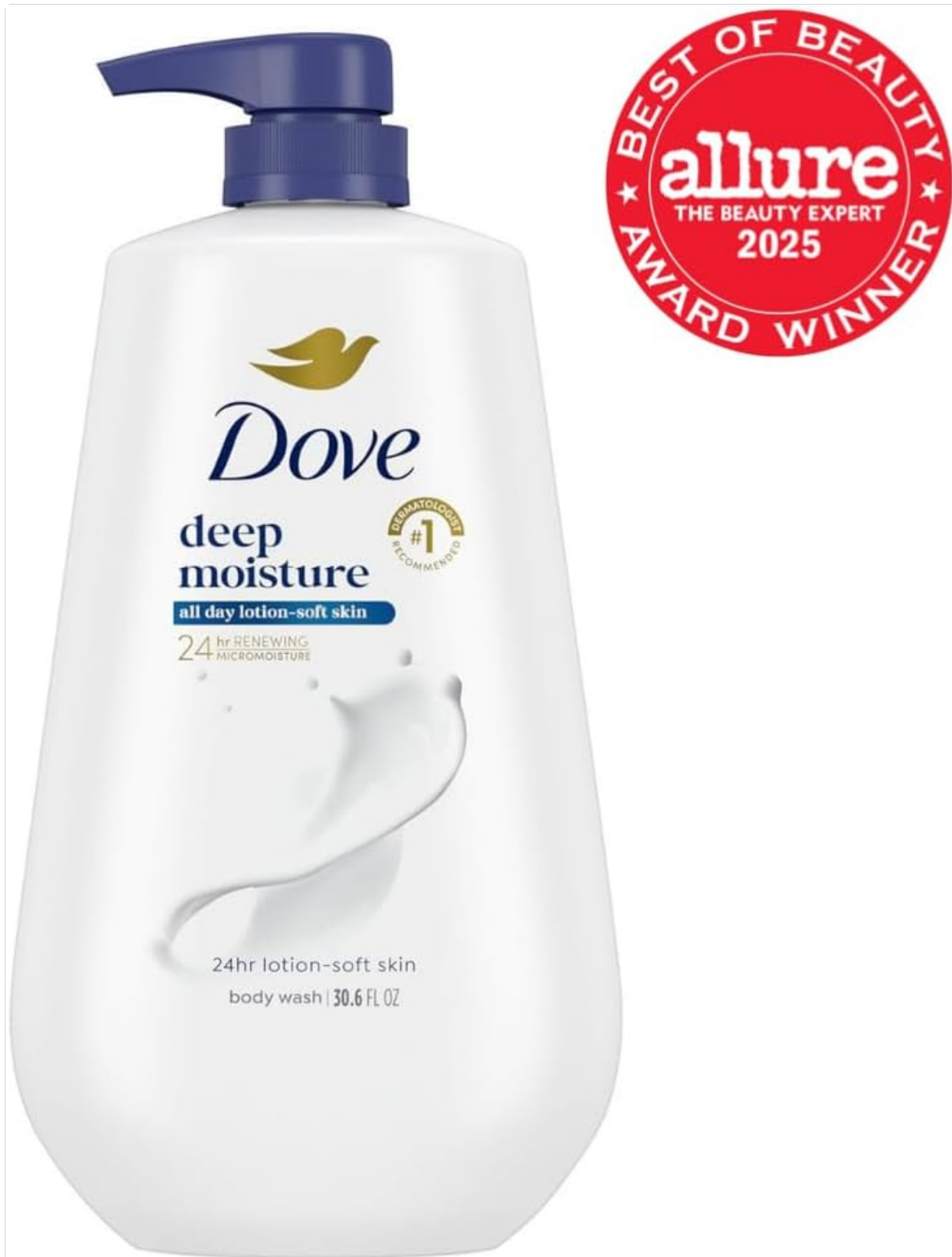
Image 2.1: Close-up of the Dove Deep Moisture Body Wash pump mechanism.