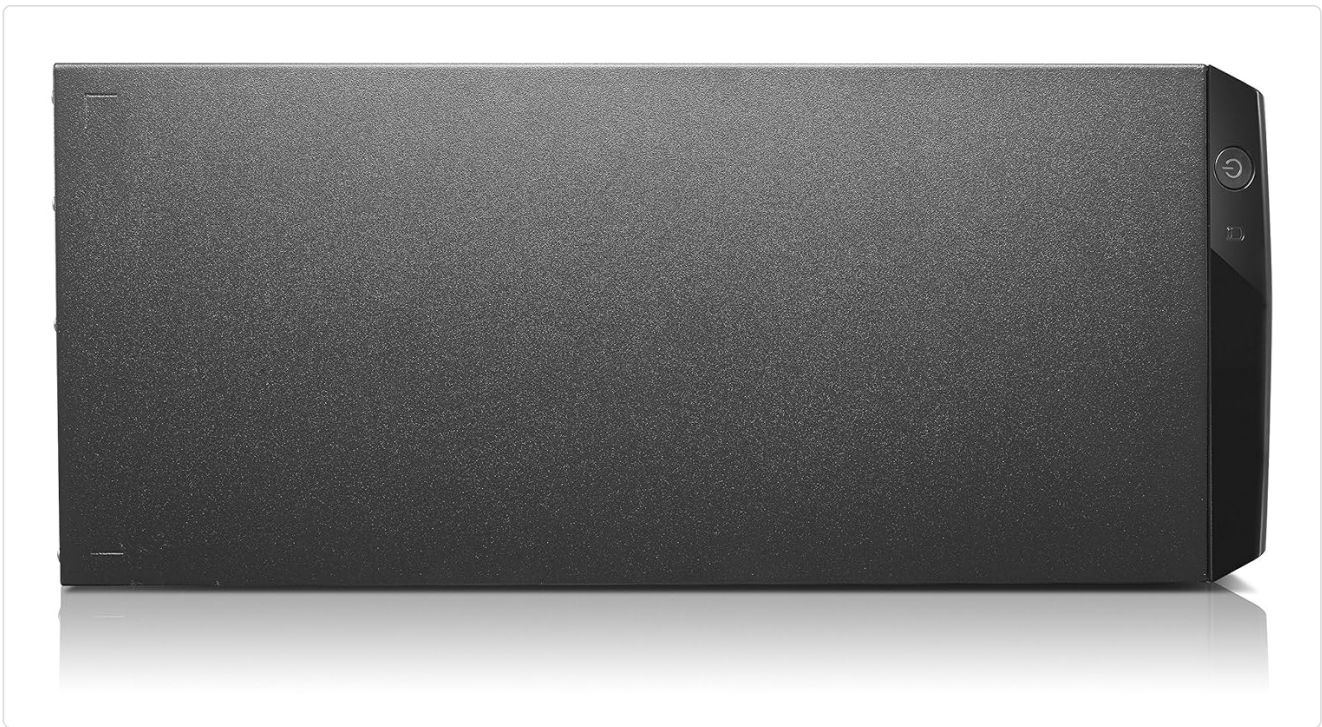
Figure 2.6: Top view of the Lenovo H50, featuring the power button and subtle branding.