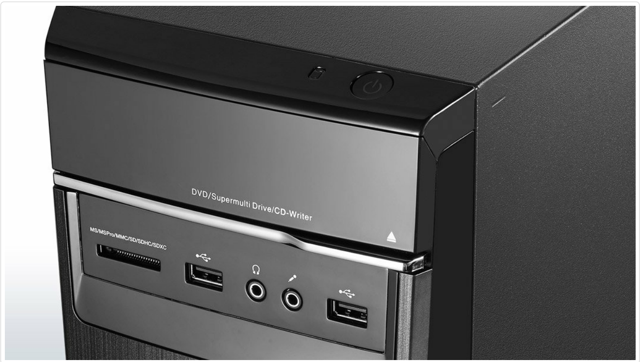
Figure 2.4: Detailed view of the front panel ports, including USB 2.0 ports, headphone and microphone jacks, and a multi-card reader slot.