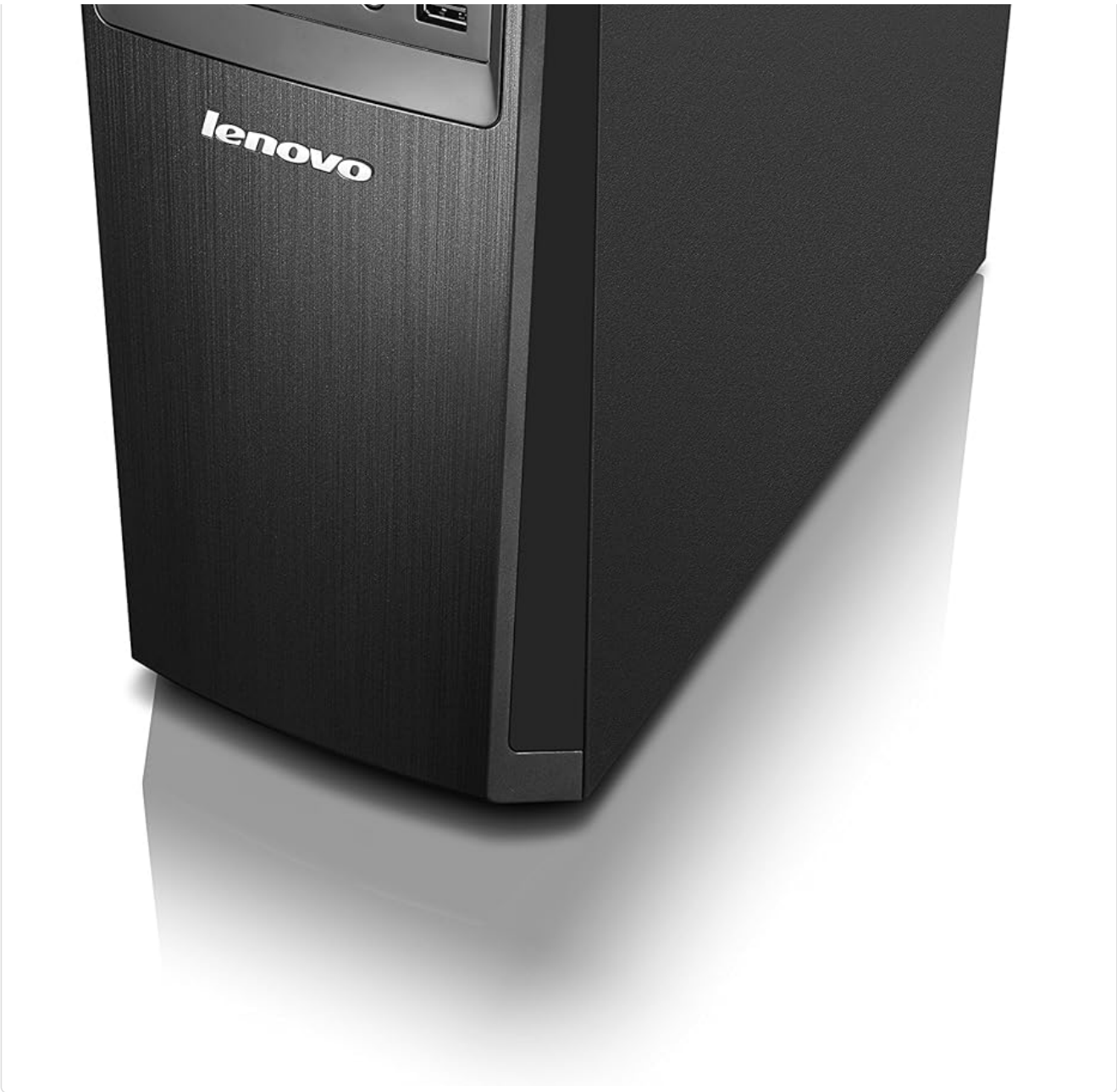
Figure 2.1: Angled view of the Lenovo H50 desktop computer, showcasing its compact tower design and front panel features.