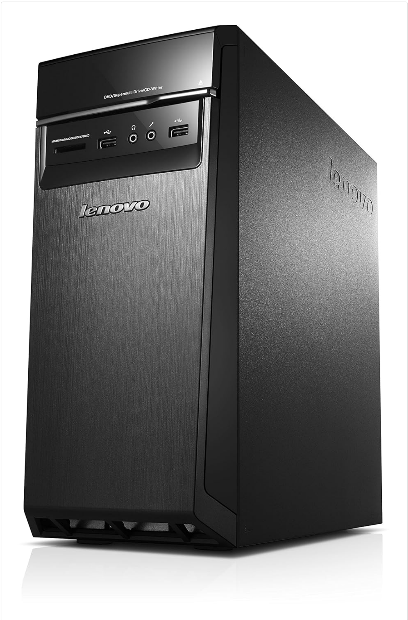
Figure 2.5: Left side view of the Lenovo H50, showing the side panel design and ventilation.