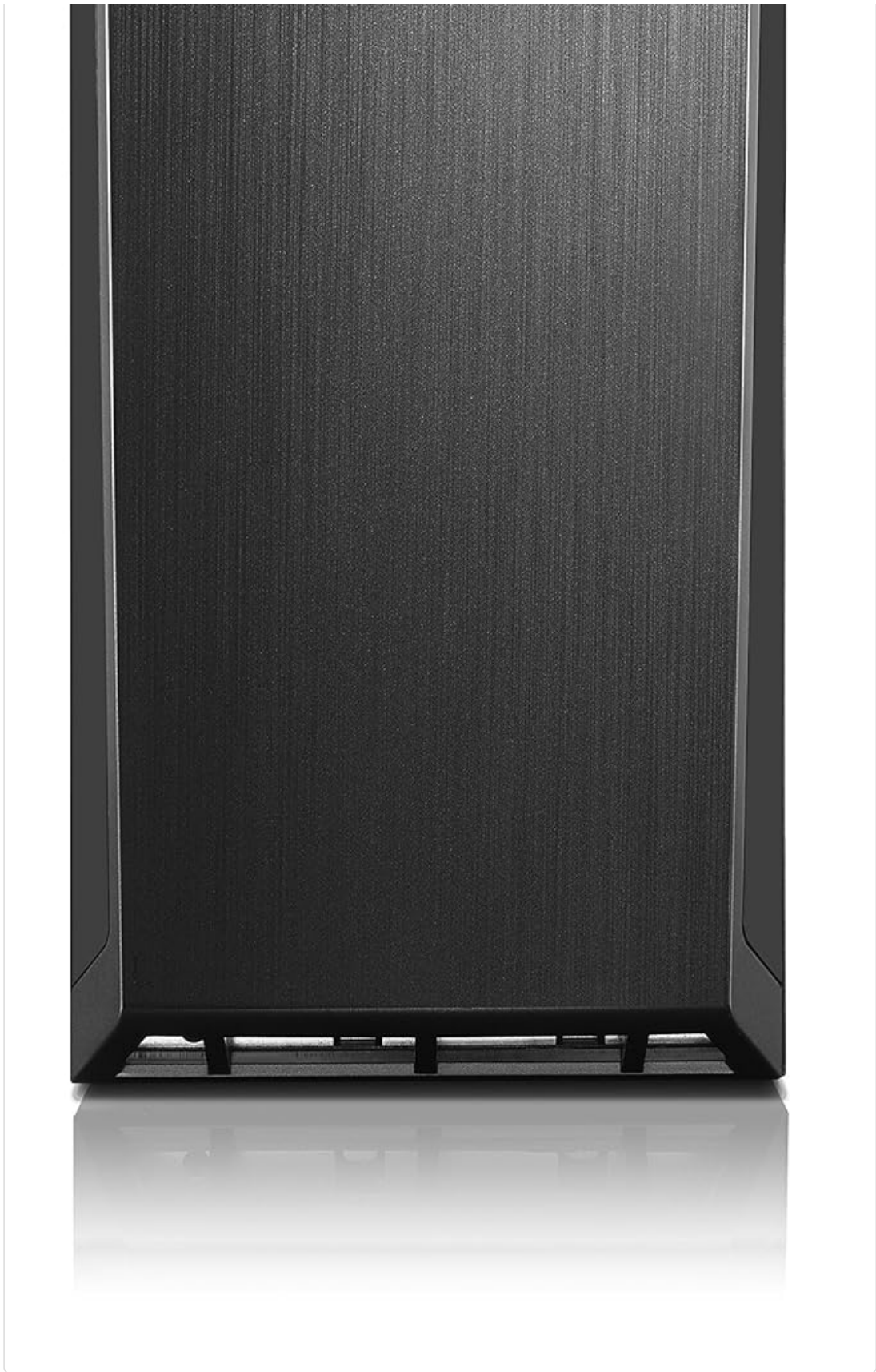
Figure 2.2: Front view of the Lenovo H50, highlighting the optical drive, front USB ports, audio jacks, and media card reader.