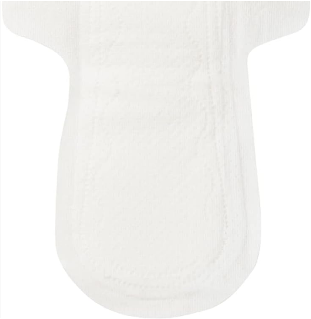
Image: An unwrapped Natracare pad, showing its full shape and wings.