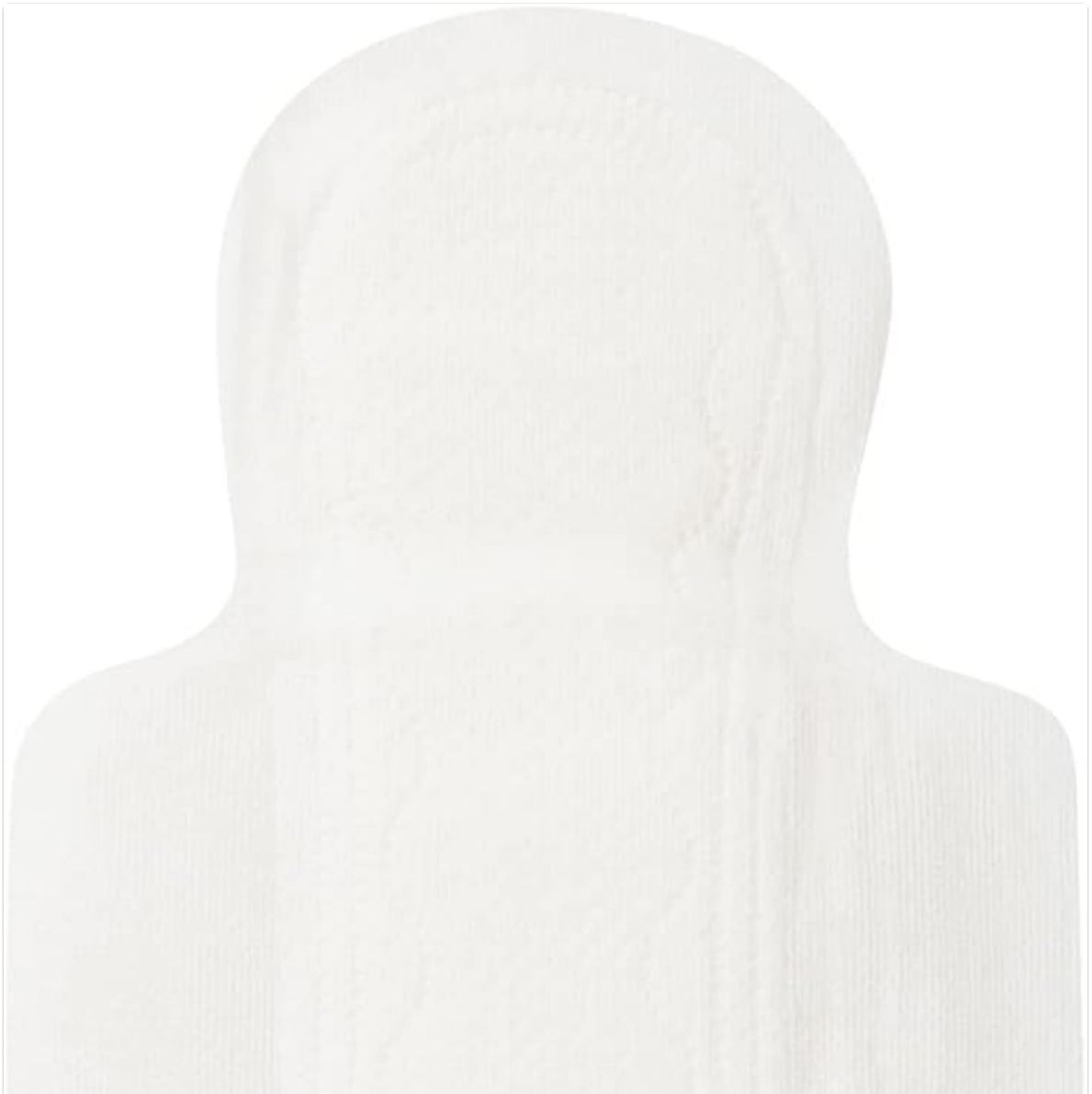
Image: A single Natracare pad, still in its individual, compostable wrapper.