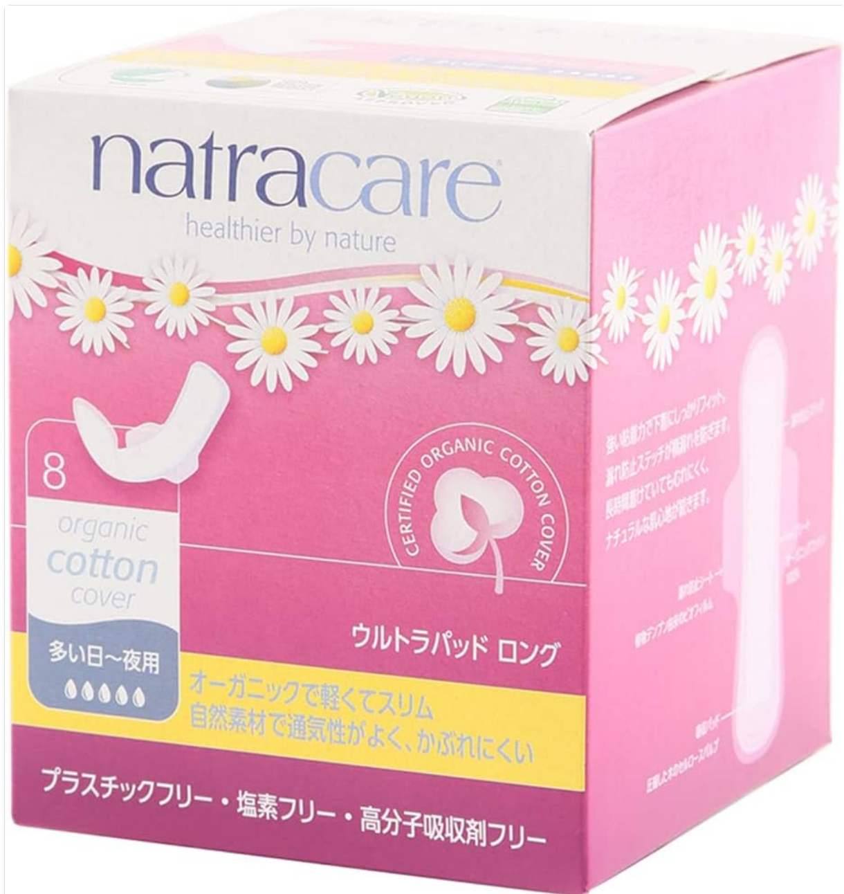
Image: Natracare Ultra Extra Pads product box, showing the pink packaging with daisies and product information.