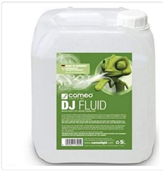
Cameo AH-CLFDJ5L Fog Fluid container, side view