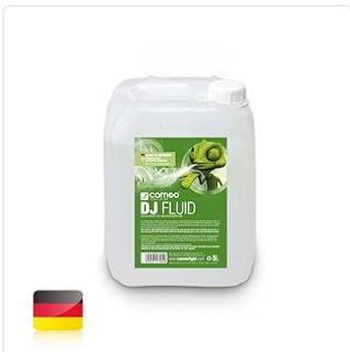
Cameo brand image with chameleon