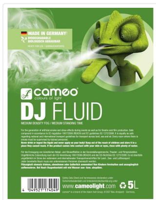
Cameo AH-CLFDJ5L Fog Fluid container with detailed label