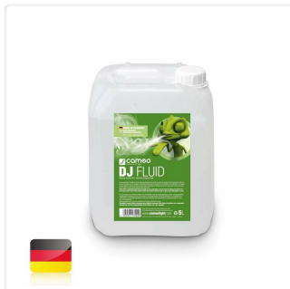
Cameo AH-CLFDJ5L Fog Fluid 5L container