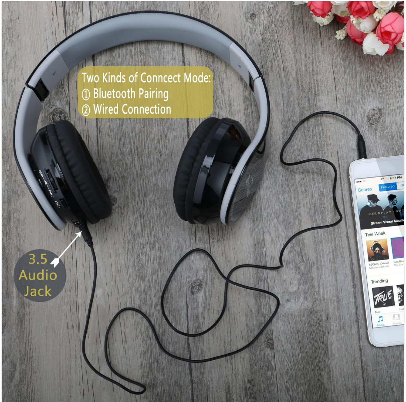
Image: The Beyution BT513 headphones connected to a smartphone using the 3.5mm audio cable, illustrating the wired connection option.