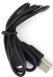
USB charging Cable