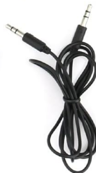
3.5mm Audio Cable