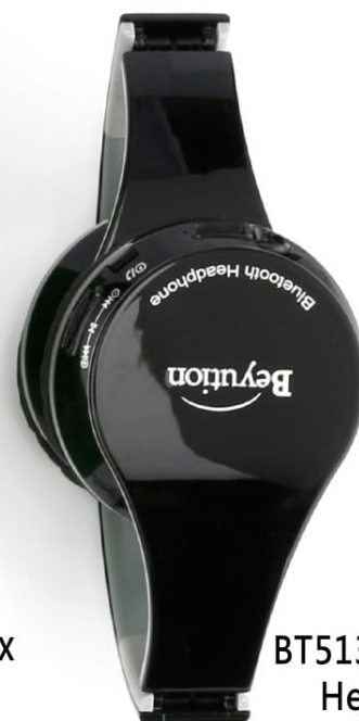
BT513 Bluetooth Headphone