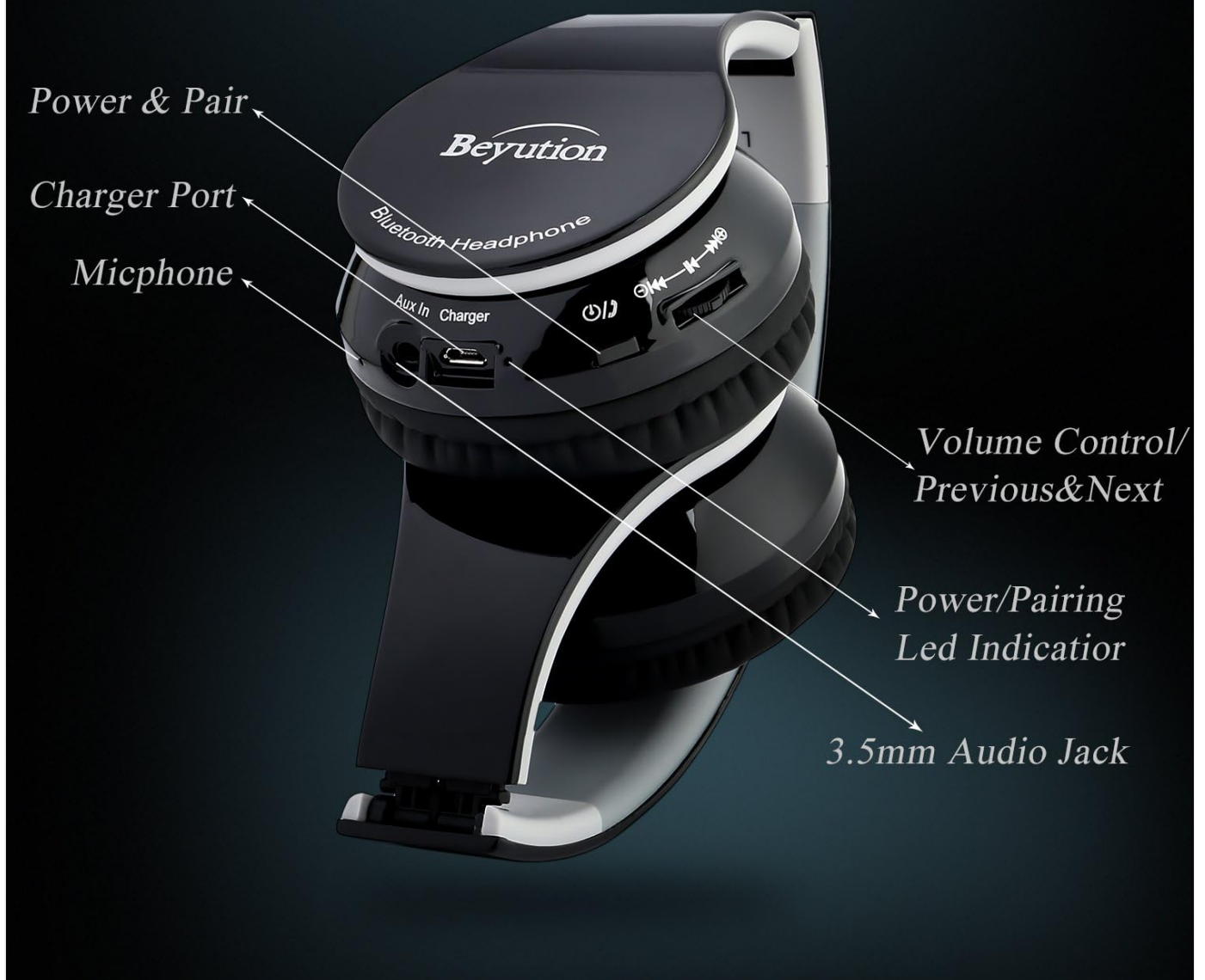
Image: Diagram showing the location of operation keys and ports on the Beyution BT513 headphones, including Power & Pair button, Charger Port, Microphone, Volume Control/Previous & Next buttons, Power/Pairing LED Indicator, and 3.5mm Audio Jack.