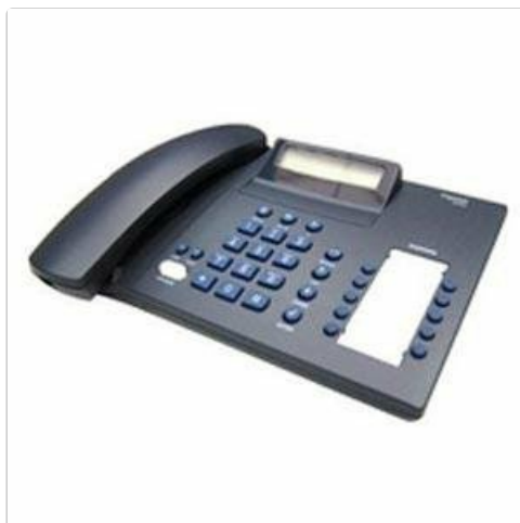
Figure 2.1: The Euroset 2025C Corded Phone as packaged in its box.