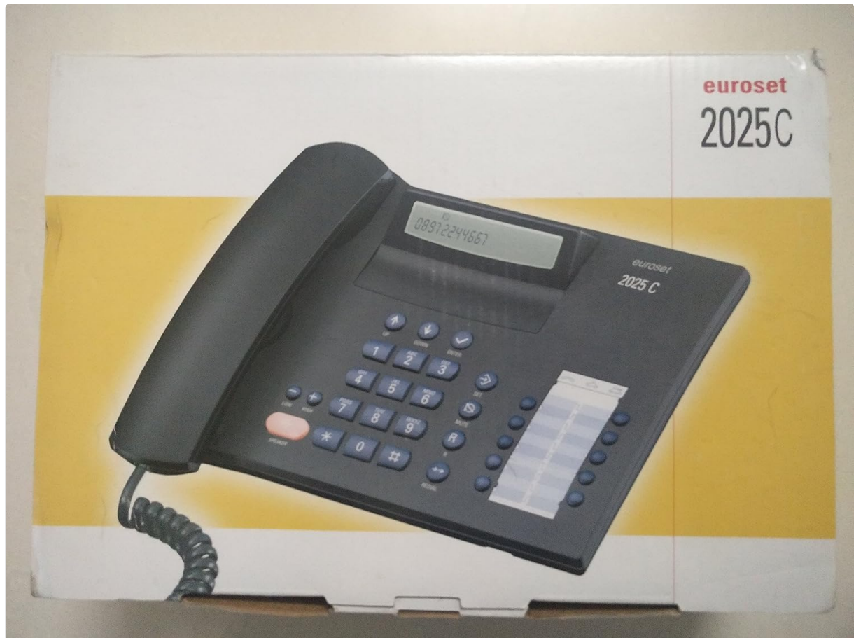
Figure 3.1: Front view of the Euroset 2025C Corded Phone. This image displays the alphanumeric keypad, the LCD screen, and the handset cradle.

The Euroset 2025C is a corded telephone designed for reliable communication. It features a clear display, an alphanumeric keypad, and various functions to enhance your calling experience.