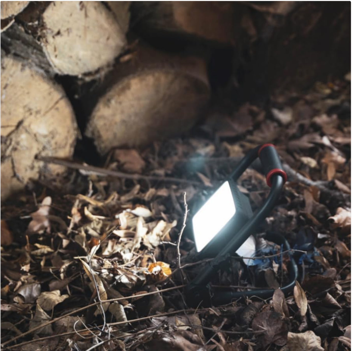
Image 5.1: The floodlight in operation, providing illumination in a natural environment.