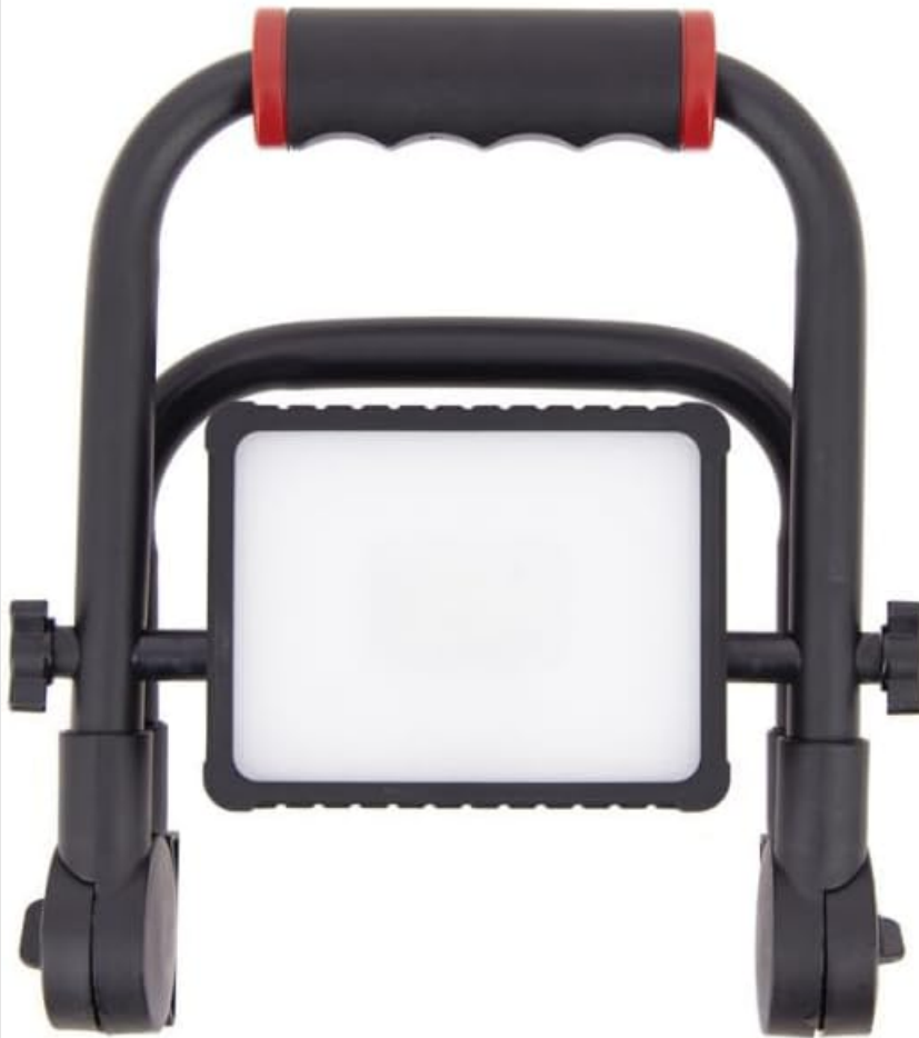
Image 3.2: Front view of the floodlight, illustrating its design optimized for easy storage and transport.