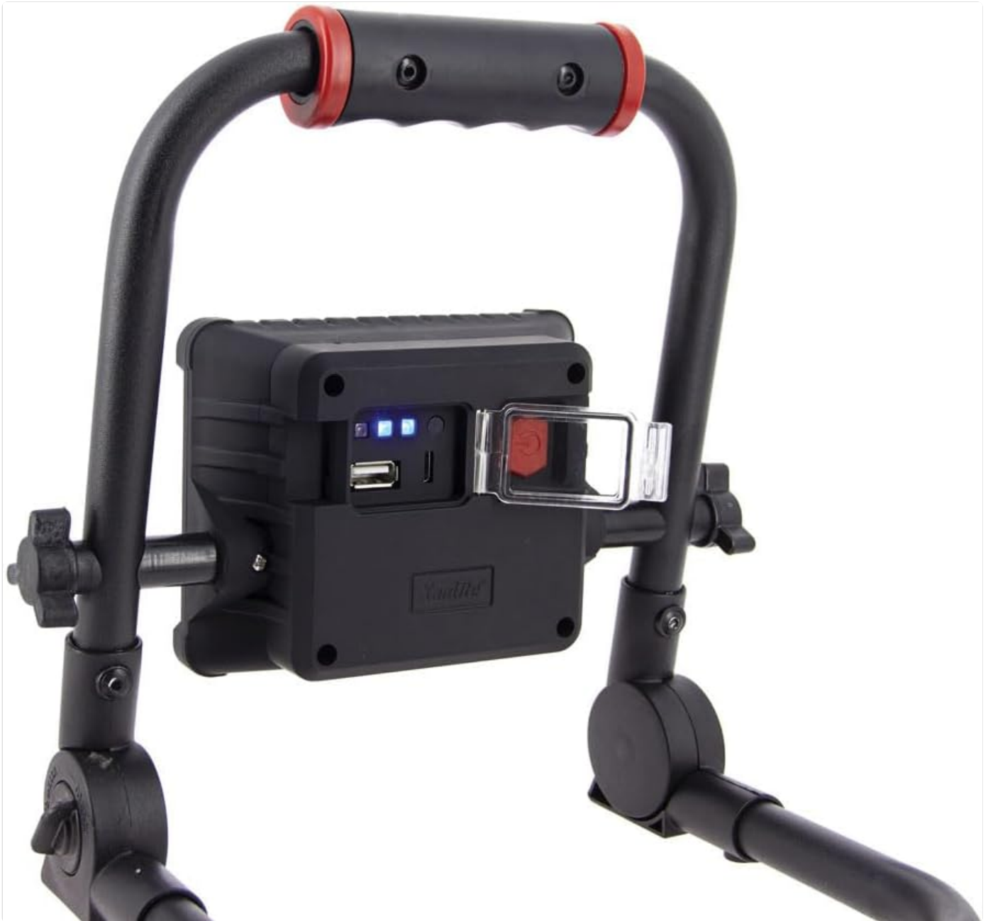
Image 4.1: Rear view of the floodlight's control panel, featuring the USB charging port, power button, and battery level indicators.