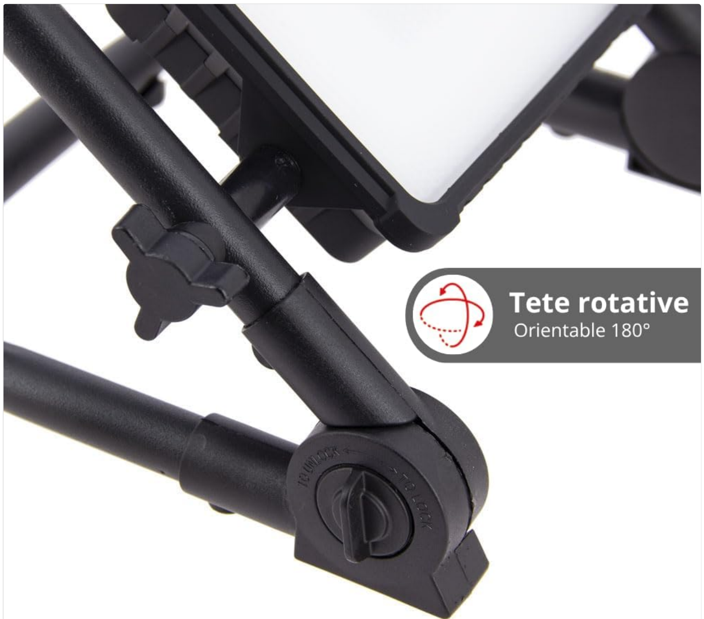
Image 5.2: Detail of the floodlight's adjustable pivot, allowing for 180-degree rotation of the light head.