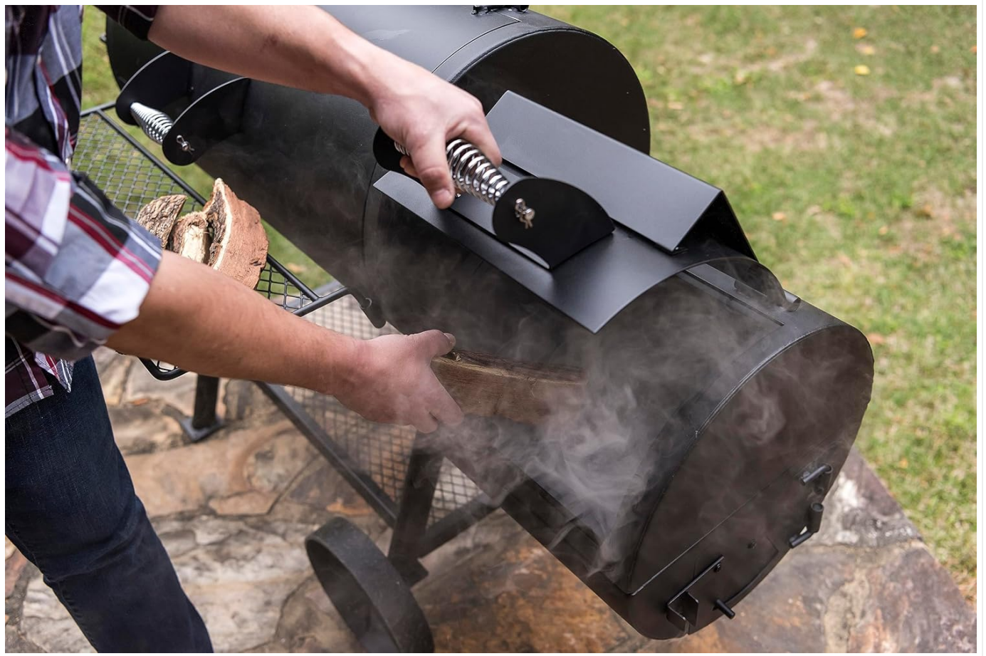
Figure 3: Adding wood chunks to the firebox for smoking.