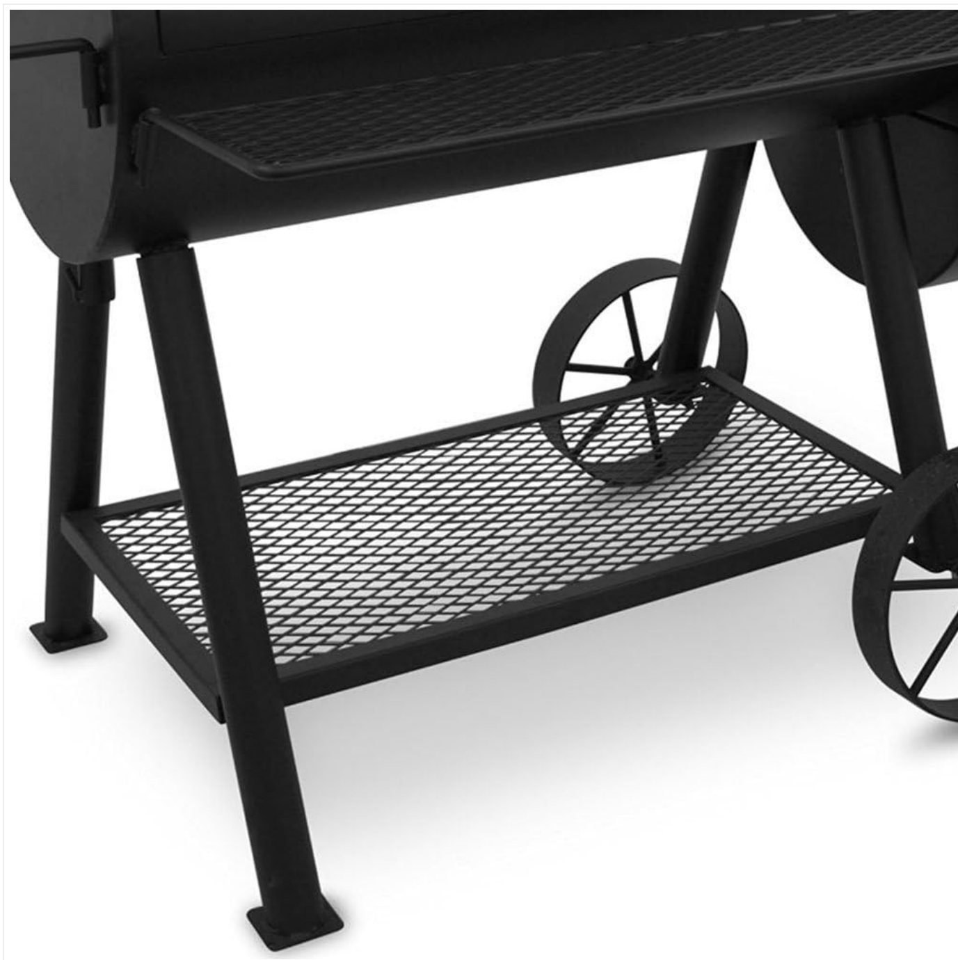
Figure 6: The sturdy bottom shelf provides convenient storage for accessories.