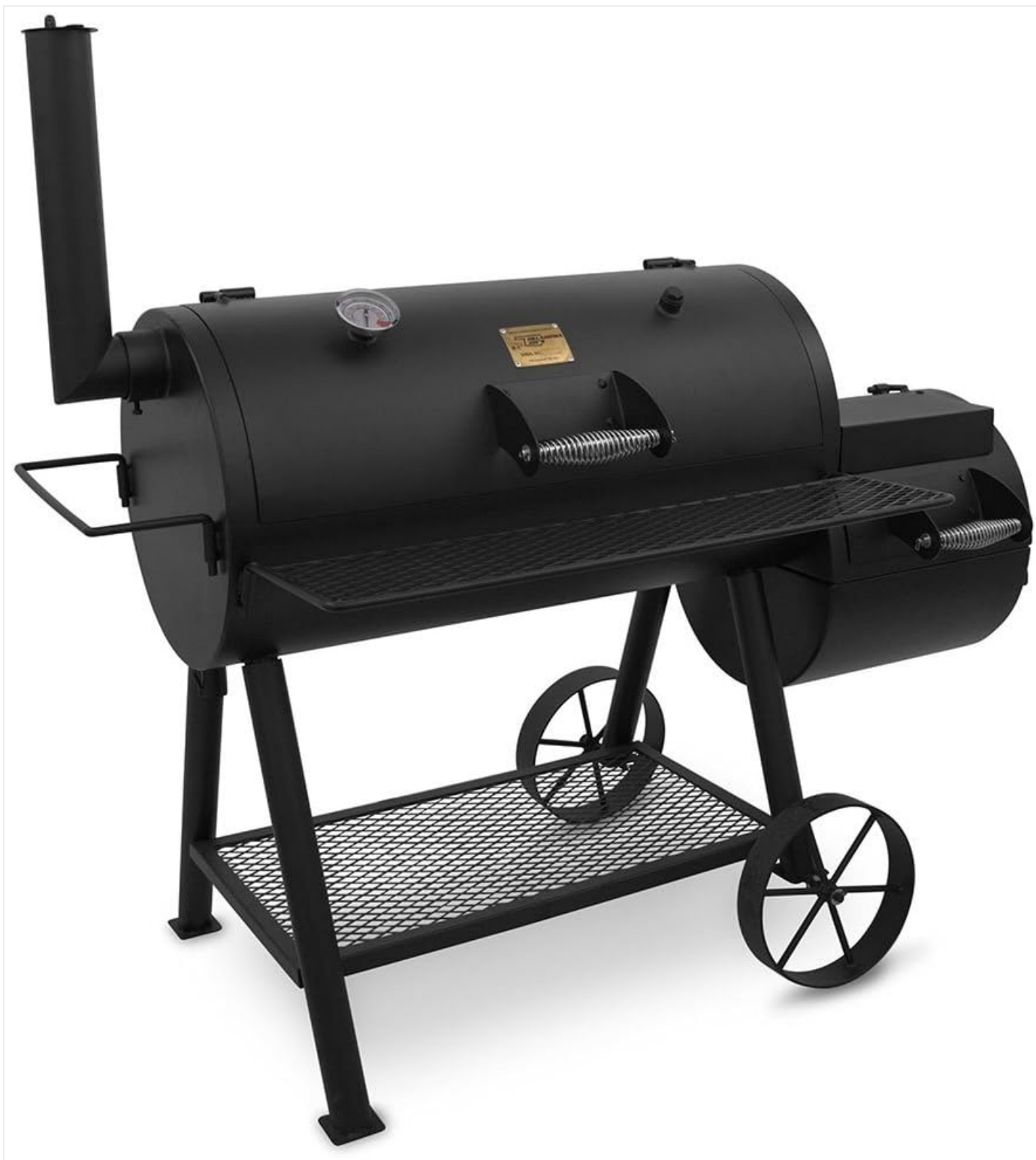
Figure 1: Fully assembled Oklahoma Joe's Highland Offset Smoker.