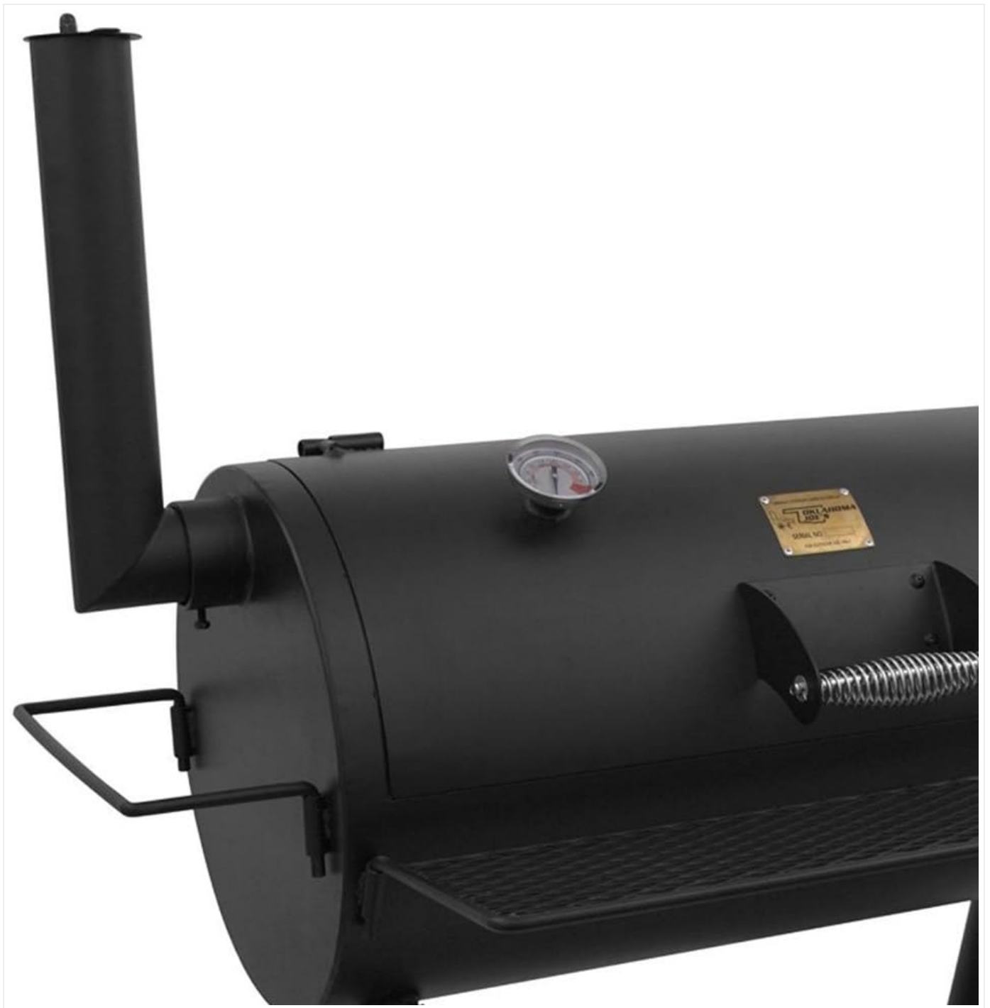
Figure 4: Integrated temperature gauge for precise heat monitoring.