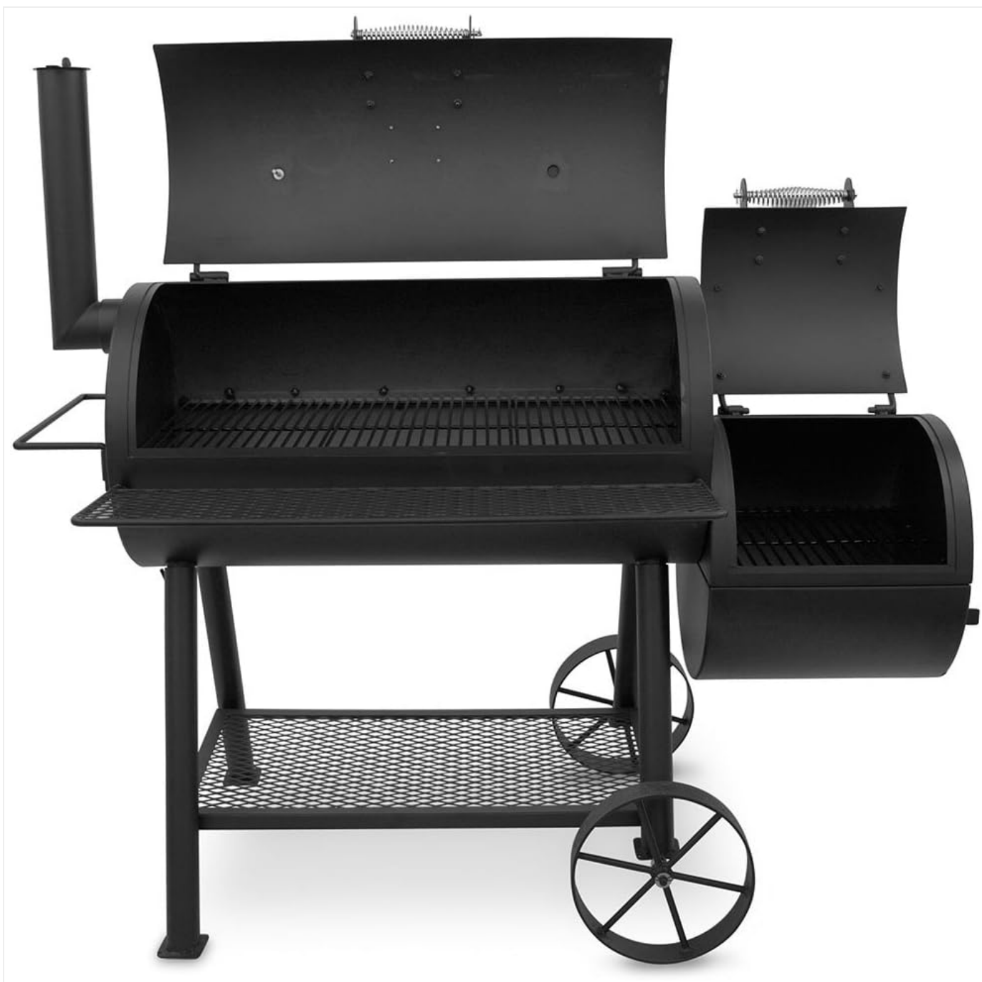
Figure 5: Smoker with lids open, showing cooking grates in both chambers.