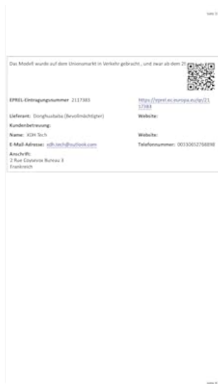
Image: EU Energy Label for the echosari ES-FairyL, indicating its energy efficiency class and consumption. For more details, visit EPREL Database .