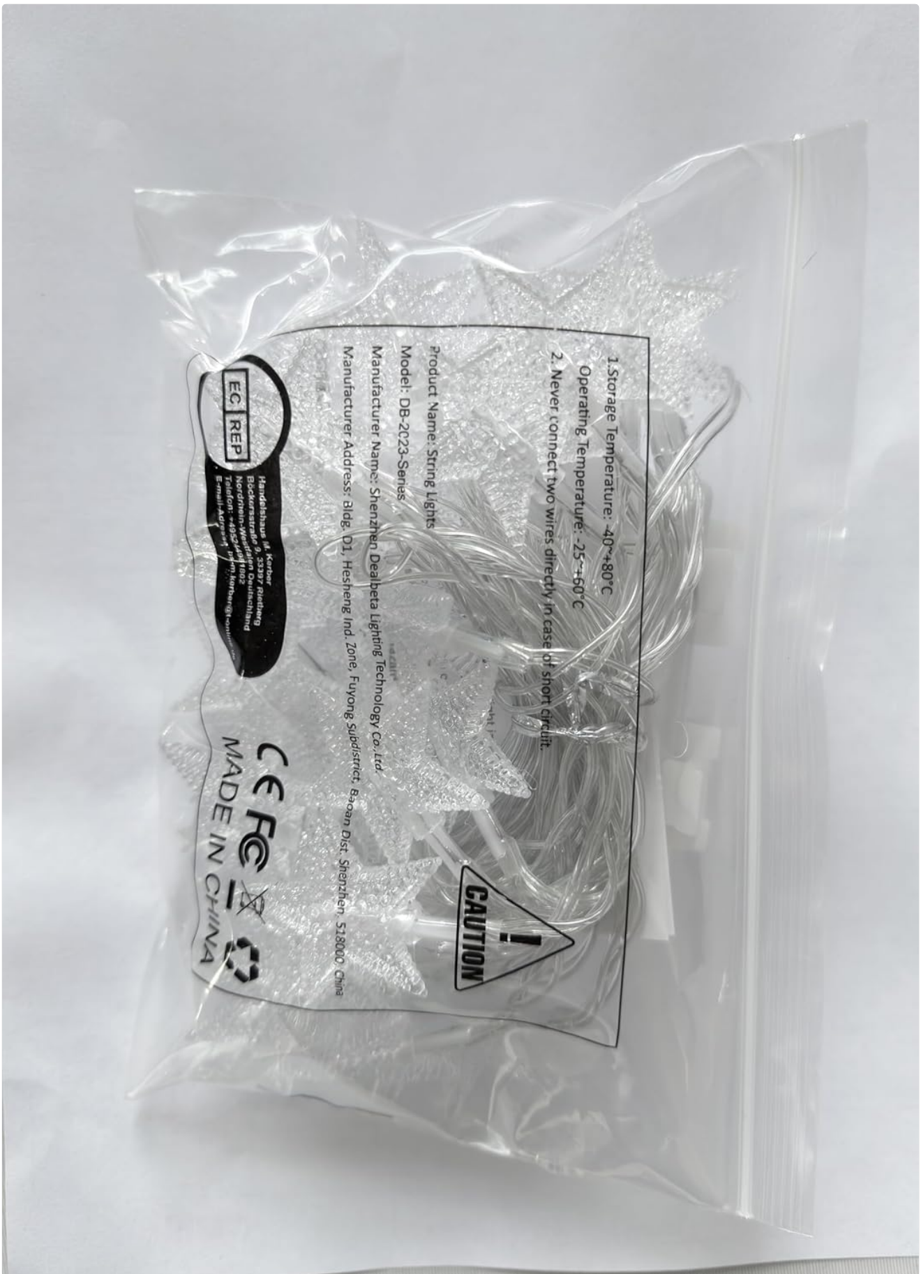
Image: The echosari Star String Lights and their battery pack as they appear in the product packaging.