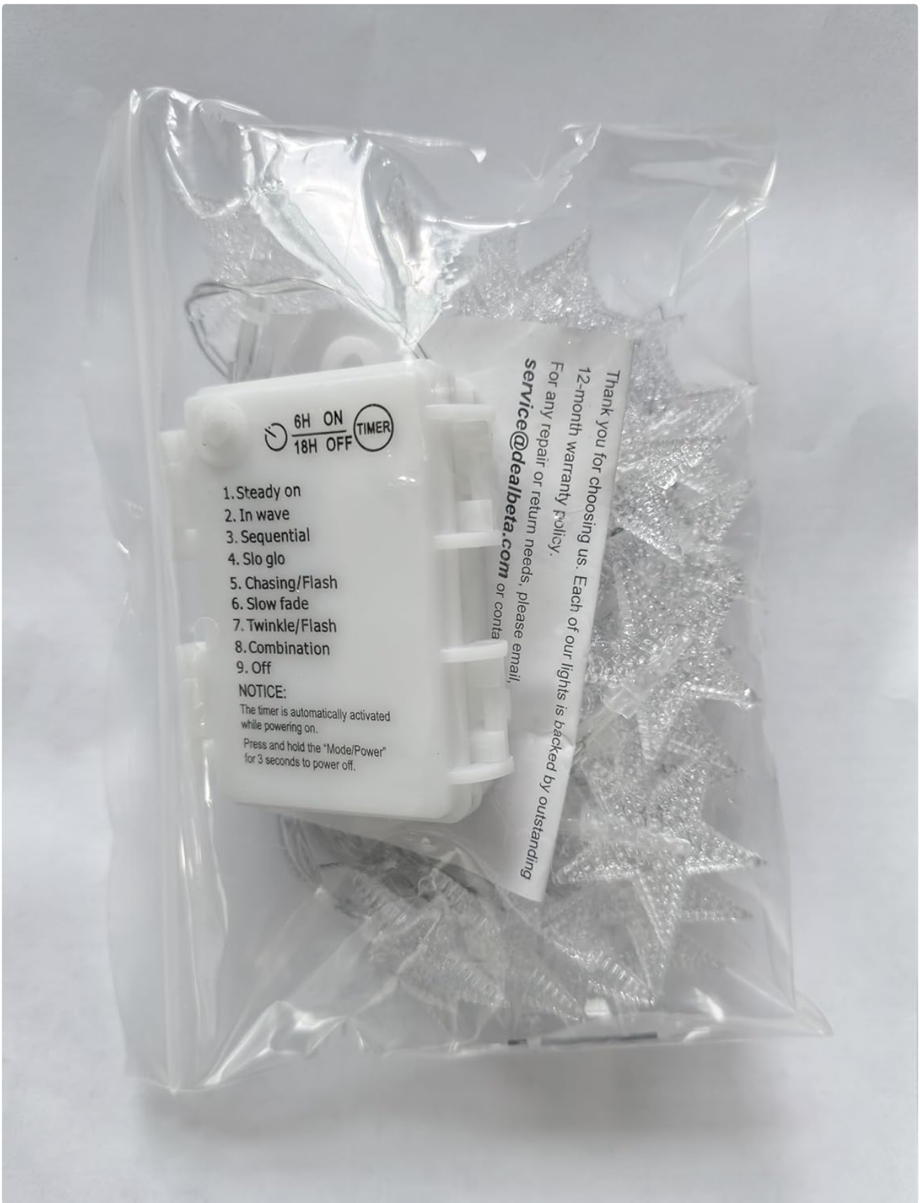
Image: The back of the product packaging, displaying warranty details and customer service contact information.