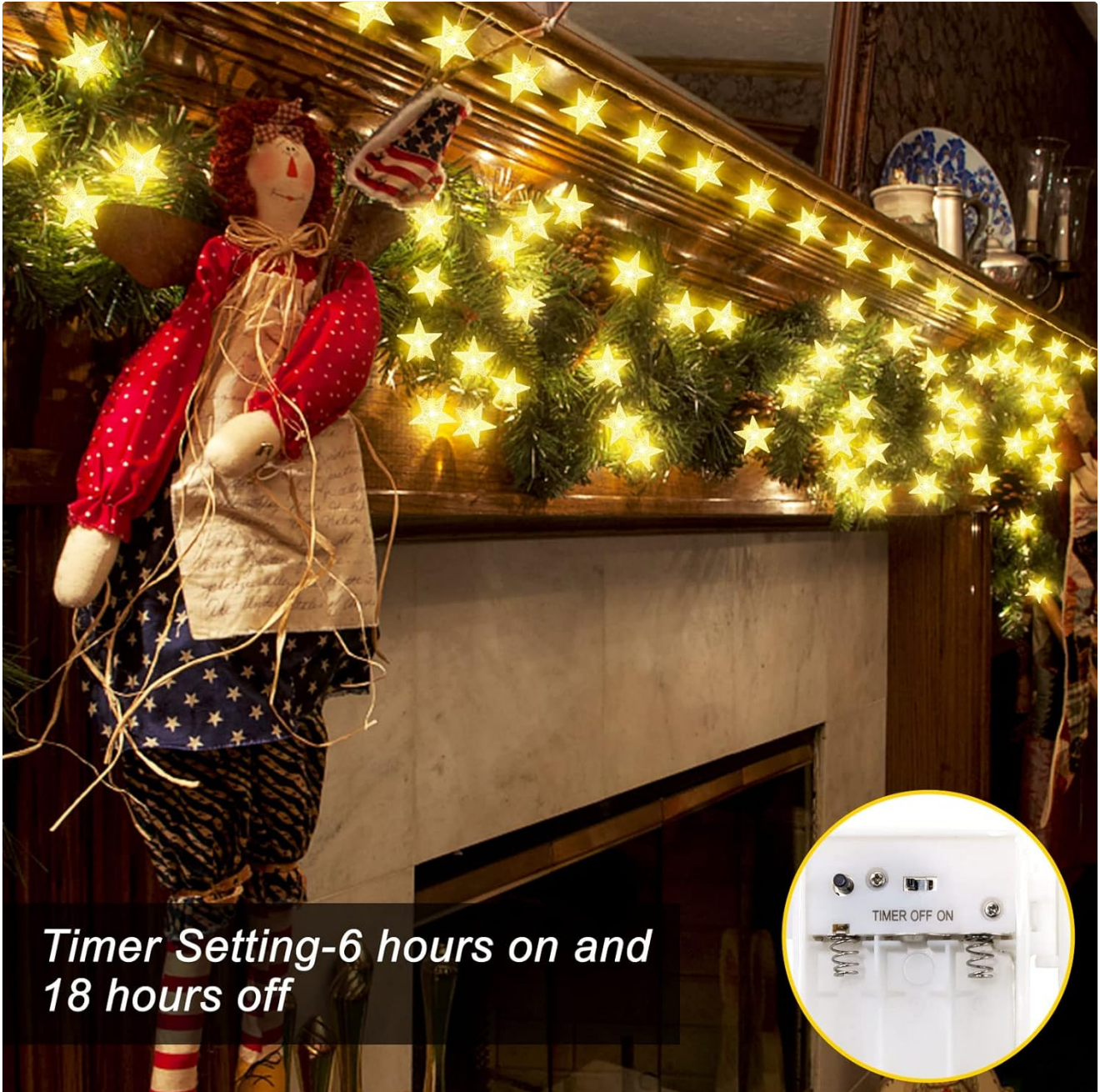
Image: Detailed view of the battery box, highlighting the mode selection button and the ON/TIMER/OFF switch for easy setup.