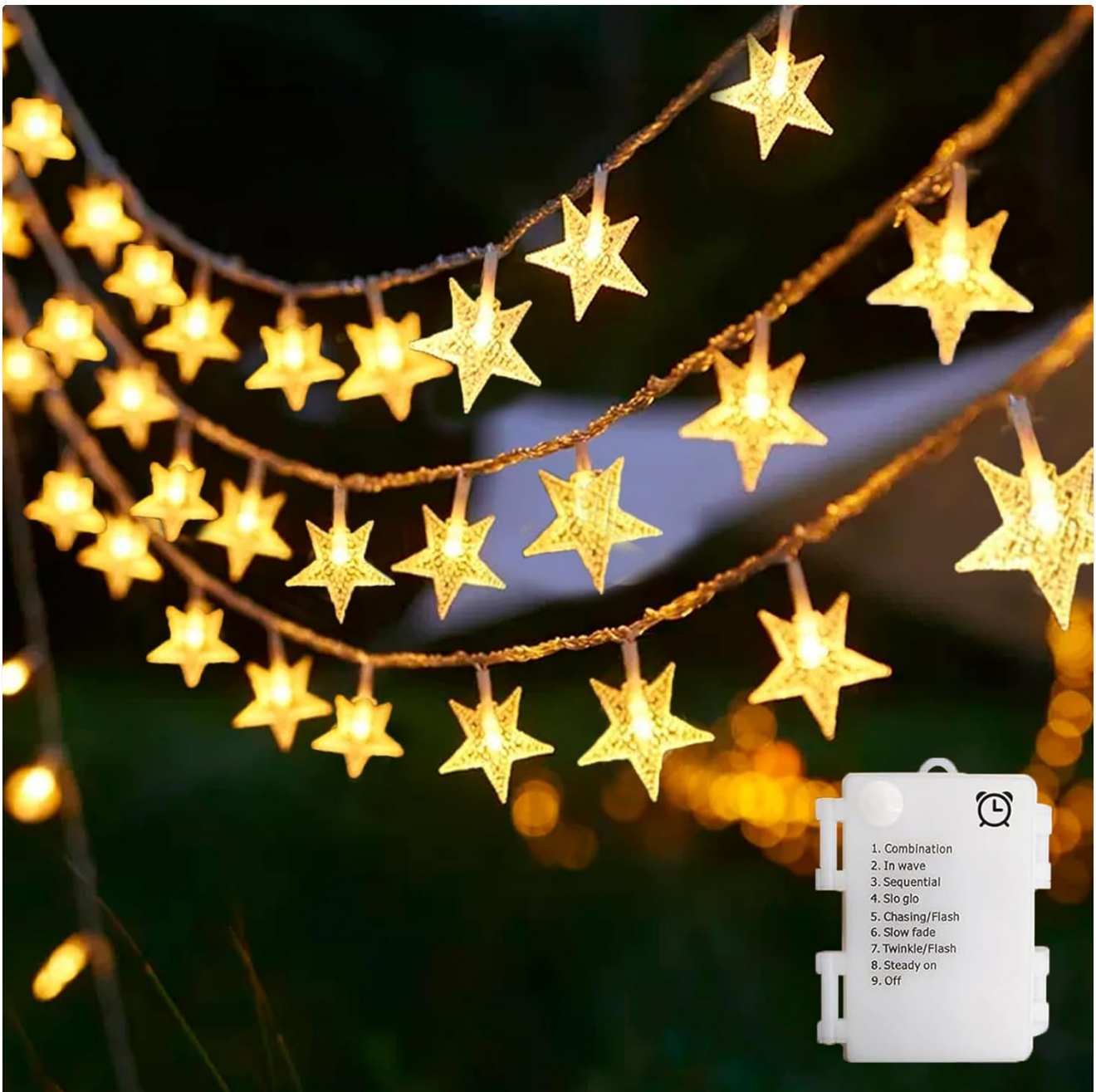
Image: echosari Star String Lights with the battery box, illustrating the product's appearance and control unit.