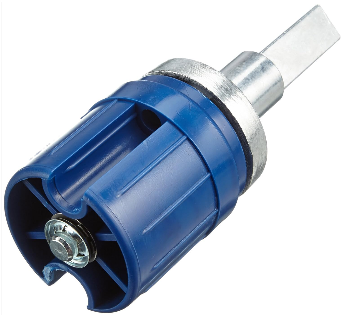
Figure 1: The Fiamma 98655-121 F45 Plus End Stop Device. This image shows the blue plastic housing, the metal shaft, and the internal spring mechanism.