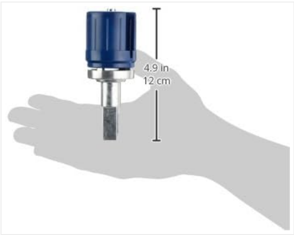
Figure 2: Dimensions of the Fiamma 98655-121 End Stop Device, showing a length of approximately 4.9 inches (12 cm).

Information regarding the specific warranty for the Fiamma 98655-121 F45 Plus End Stop Device is not provided in this document. Please refer to the original purchase documentation or contact Fiamma customer support for warranty details and technical assistance.