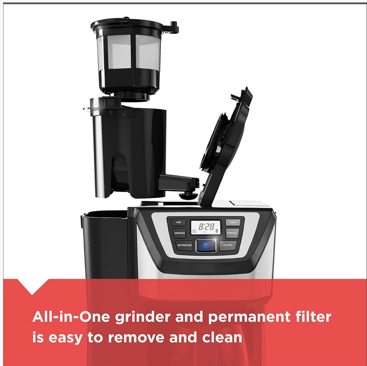
Image: The all-in-one grinder and permanent filter assembly removed from the coffee maker, showing its components for easy cleaning.