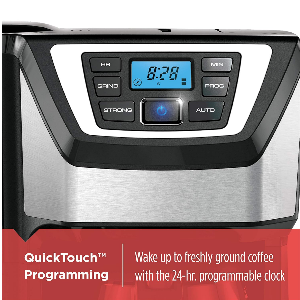
Image: Close-up of the QuickTouch programming panel with digital display and control buttons (HR, MIN, GRIND, STRONG, PROG, AUTO, Power).