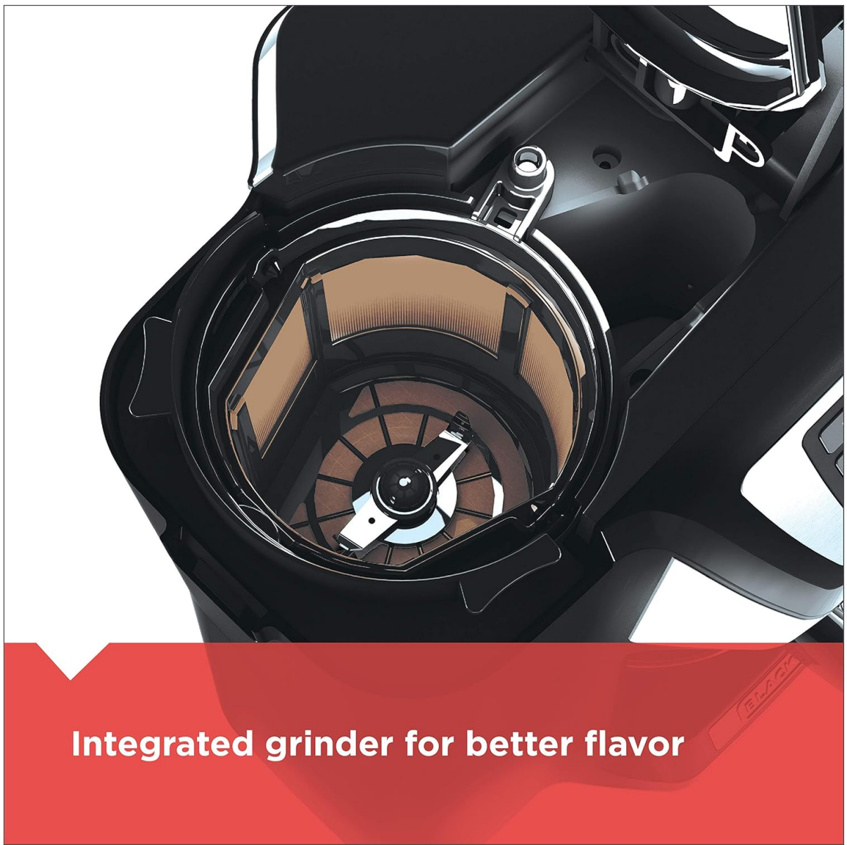
Image: Top-down view of the integrated grinder and permanent filter basket within the coffee maker.