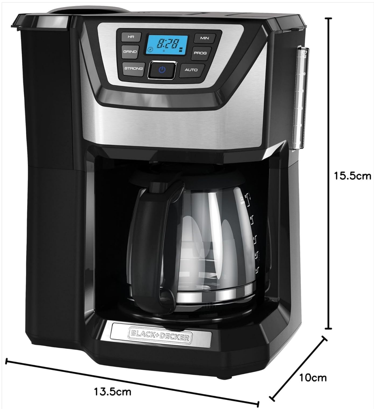
Image: The coffee maker with dimensions labeled: 15.5 inches height, 13.5 inches width, 10 inches depth.