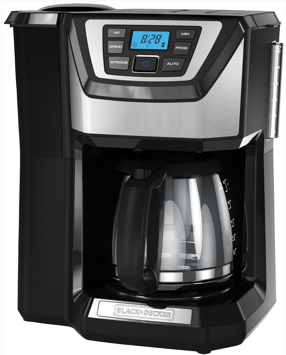
Image: Front view of the BLACK+DECKER 12-Cup Mill and Brew Coffee Maker, black and stainless steel finish.

The BLACK+DECKER 12-Cup Mill and Brew Coffee Maker offers integrated grinding and brewing for fresh coffee. It features programmable settings and a reusable filter for convenience.