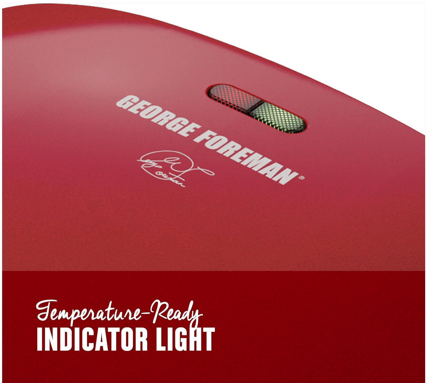
Image: A close-up view of the top of the George Foreman grill, highlighting the red and green indicator lights that signal power and readiness.