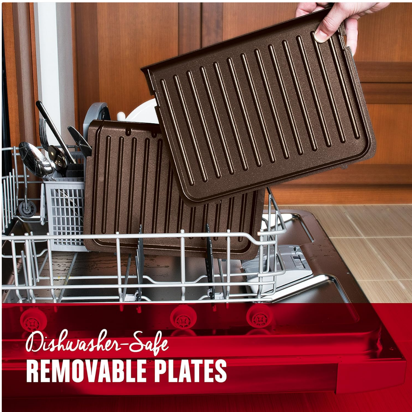
Image: A hand placing one of the removable George Foreman grill plates into a dishwasher rack, demonstrating their dishwasher-safe feature.