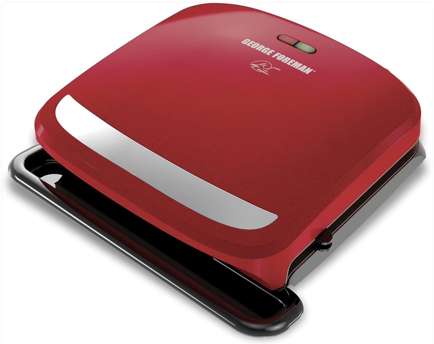
Image: The George Foreman 4-Serving Removable Plate Grill and Panini Press in its closed position, showcasing its sleek red design.