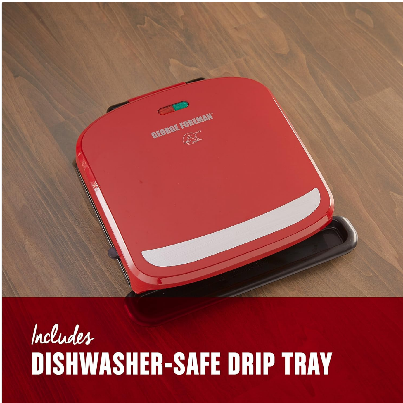
Image: The George Foreman grill with its black drip tray positioned underneath the front, ready to collect excess grease.