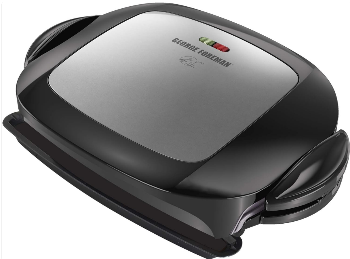
Image: The George Foreman 5-Serving Removable Plate Grill and Panini Press, showcasing its sleek design and indicator lights.