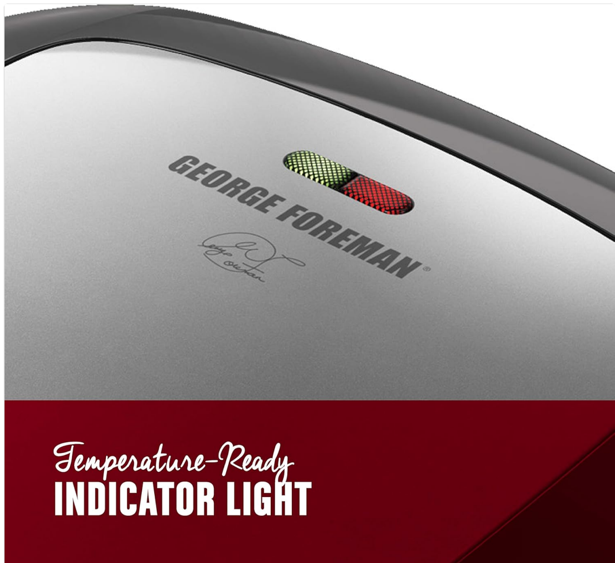
Image: A close-up of the George Foreman grill's lid, highlighting the red power and green ready indicator lights.