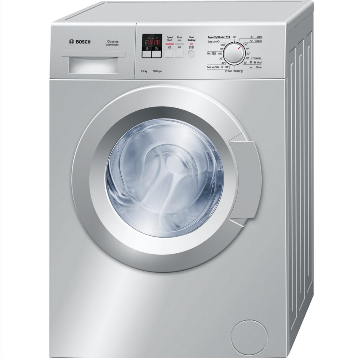
Image Description: Front view of the Bosch WAX20168IN washing machine. It features a silver finish, a large central porthole door, and a control panel at the top with a digital display, program selector dial, and various buttons.