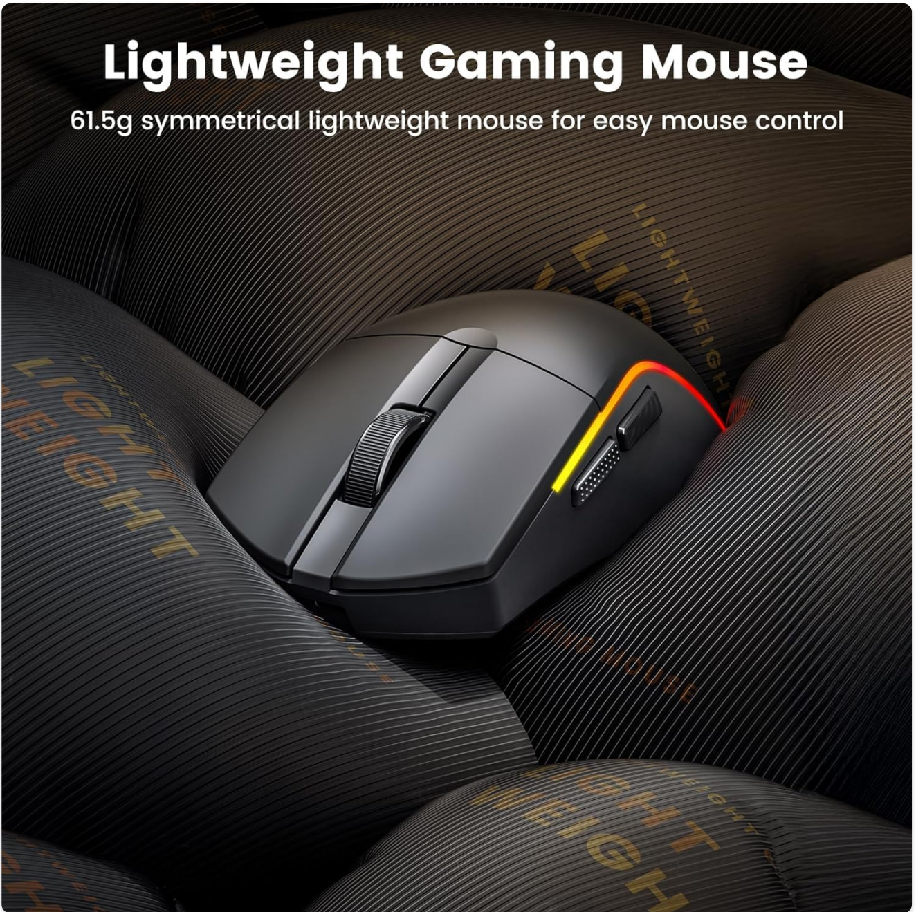
Figure 5.1: The 61g ultra-lightweight gaming mouse.

61.5g symmetrical lightweight mouse for easy mouse control