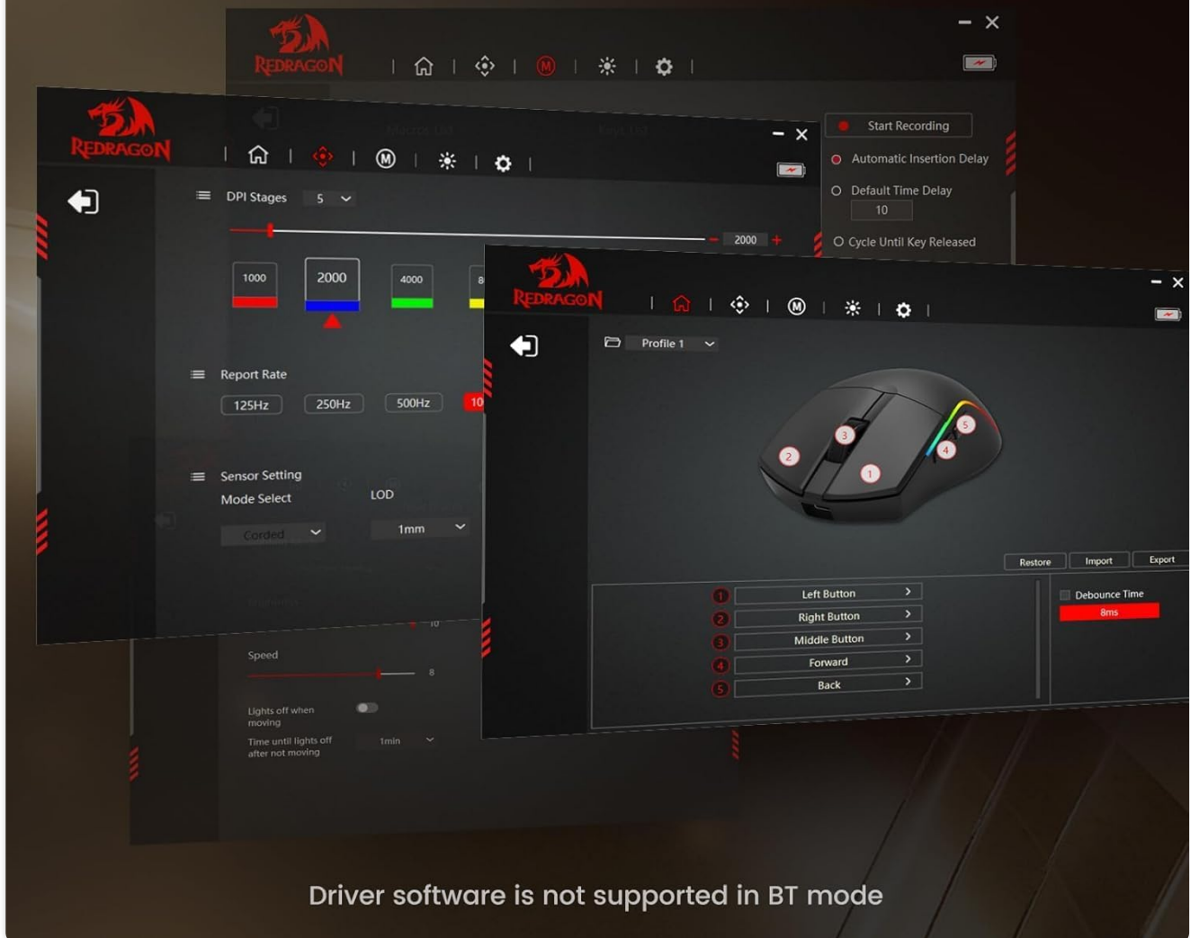
Figure 5.2: Mouse software for DPI, macros, and RGB customization.

Customizable mouse buttons, macros, DPI, RGB backlighting and more