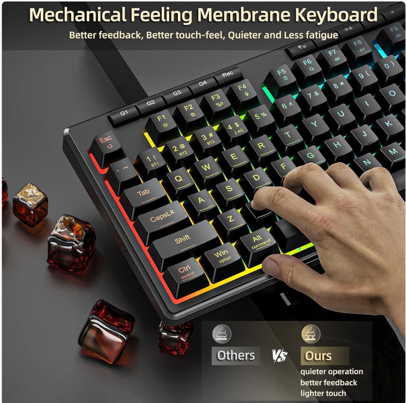
Figure 4.1: Mechanical-feel membrane keys for enhanced typing experience.

Better feedback, Better touch-feel, Quieter and Less fatigue