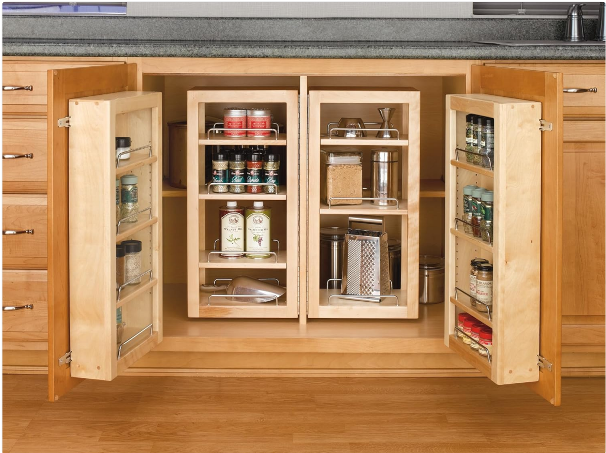
Image: The Rev-A-Shelf Wood Base Cabinet Door Mount Organizer shown installed inside a kitchen cabinet, providing organized storage for various items.