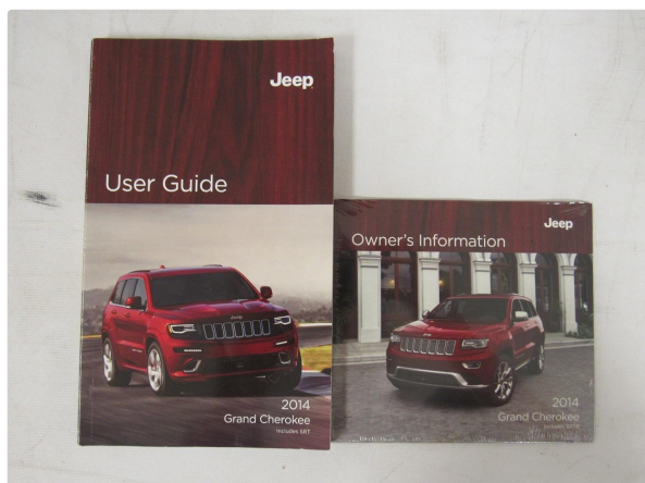
Image: The main User Guide and Owner's Information manuals for the 2014 Jeep Grand Cherokee.

The complete owner's manual set for the 2014 Jeep Grand Cherokee typically includes several documents designed to provide comprehensive information. These documents cover various aspects of vehicle operation, safety, and maintenance.